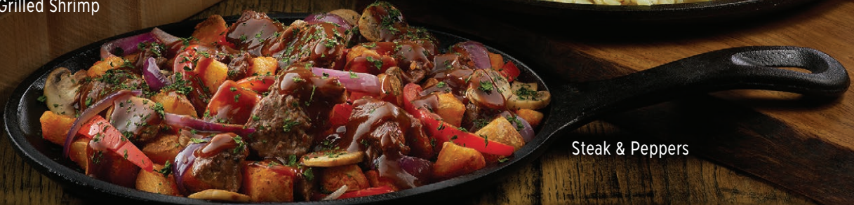
Steak & Peppers