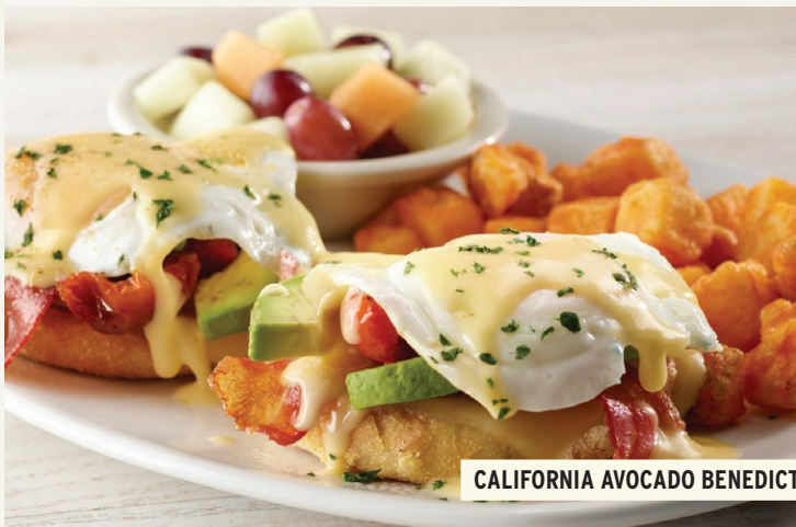
CALIFORNIA AVOCADO BENEDICT

Our scrumptious Benedicts are served with fresh fruit and choice of crispy hash browns or breakfast potatoes.