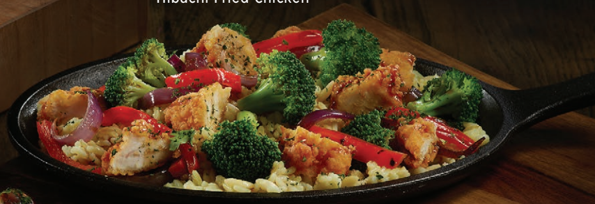
Hibachi Fried Chicken