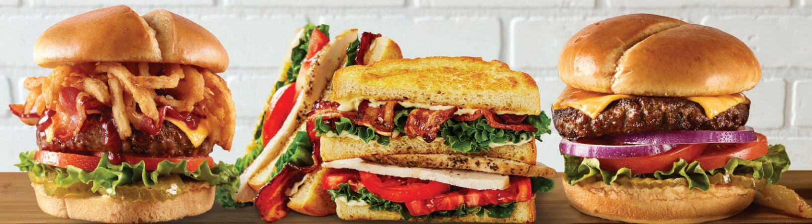
BBQ Tangler Burger