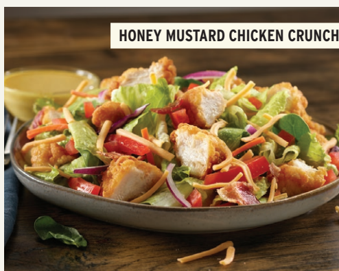
HONEY MUSTARD CHICKEN CRUNCH