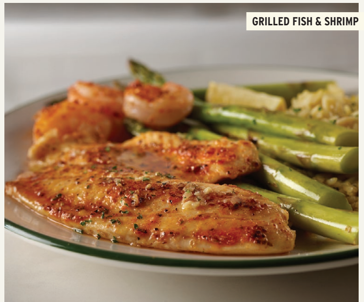
GRILLED FISH & SHRIMP