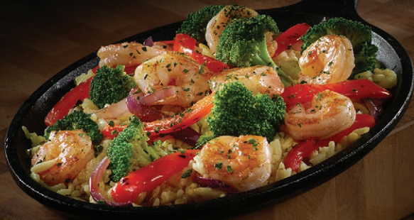
Hibachi Grilled Shrimp