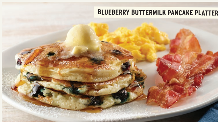
BLUEBERRY BUTTERMILK PANCAKE PLATTER

Three potato pancakes served with a side of applesauce. 18.49 · á la carte ③ 13.99