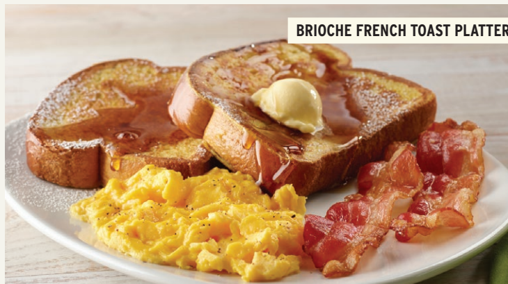
BRIOCHE FRENCH TOAST PLATTER

Three buttermilk pancakes loaded with juicy blueberries, grilled and sprinkled with powdered sugar. 16.49 · á la carte ③ 13.99