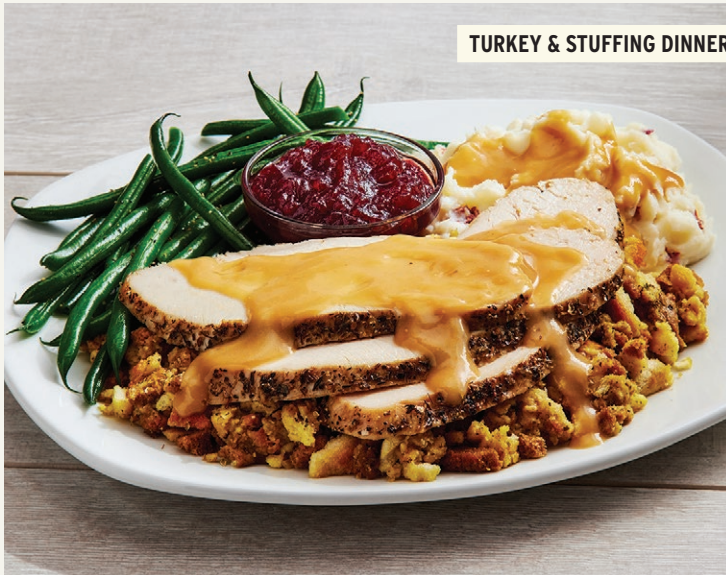
TURKEY & STUFFING DINNER

Add a fresh garden salad or cup of soup for only 3.29