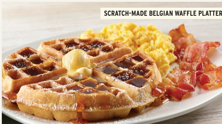
SCRATCH-MADE BELGIAN WAFFLE PLATTER

SWEETEN YOUR GRIDDLE GREAT! Add glazed strawberries 2.99