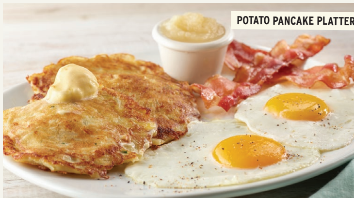
POTATO PANCAKE PLATTER