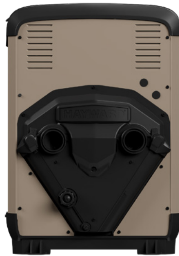
Universal HC Series Gas Heater with OmniX HDFS400