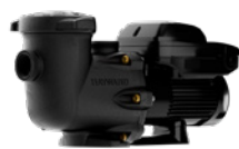
TRISTAR VS 900

WORKS GREAT WITH OUR OTHER OMNI X® COMPATIBLE PRODUCTS