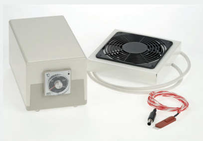
Fan heater-sensor kit For the cooling down of gels