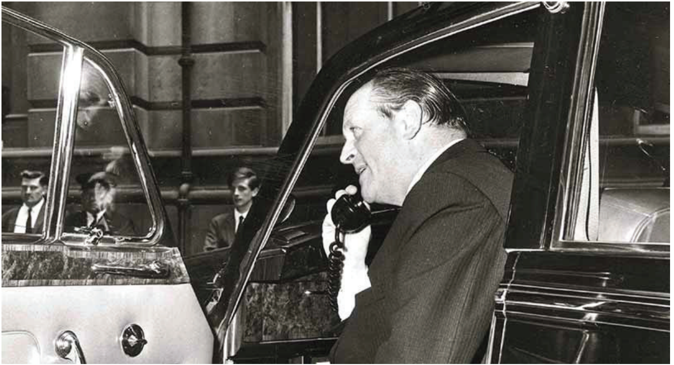
A public radio telephone service, first introduced in 1959, was extended to London in 1965 with the opening of the Post Office Tower. The first call was made to TV presenter, Richard Dimbleby, travelling in his chauffeur-driven Rolls Royce.