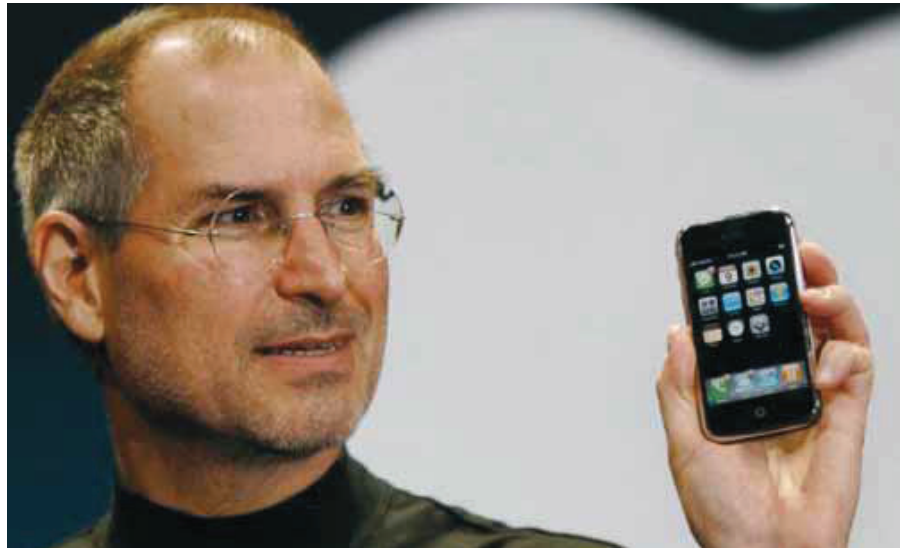
Steve Jobs announced that Apple was entering the mobile phone market on 7 January, 2007.

arrived in the UK on 30 October, 2012, with the launch of EE, a new brand from Everything Everywhere (the company formed by the merger of Orange UK and T-Mobile UK back in 2010). Everything Everywhere, now renamed EE, received permission from Ofcom to refarm (a term used for spectrum reallocation) some of their 1800MHz spectrum from 2G GSM to 4G Long Term Evolution (LTE) use. This enabled EE to launch a service prior to the auction for new mobile spectrum in the 800 and 2600MHz bands.