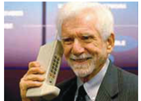
In 1973 Dr Martin Cooper made the first handheld mobile phone call outside the Hilton on Sixth Avenue, New York.