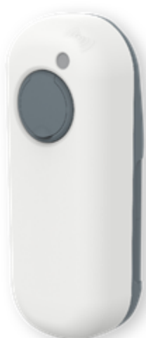
Type 2 socket

NOTE: The maximum charge capacity of the charge point depends on several factors. This includes; local rules & regulations, the type of EV, the grid connection at your location and the electricity usage of your building.