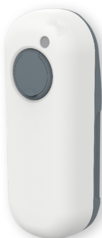
Type 2 socket

NOTE: The maximum charge capacity of the charge point depends on several factors. This includes; local rules & regulations, the type of EV, the grid connection at your location and the electricity usage of your building.