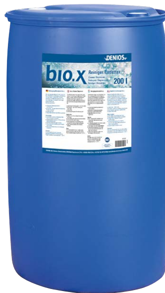
200 litre drum, Order number 161-524-B1