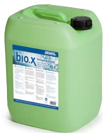
20 litre canister, Order number 130-032-B1