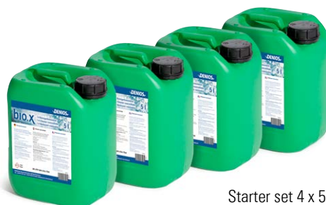
Starter set 4 x 5 litre canisters, Order number 187-606-B1