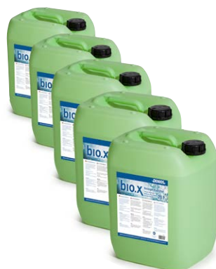
Starter set 5 x 20 litre canisters, Order number 130-030-B1