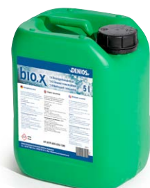
5 litre canister, Order number 183-543-B1