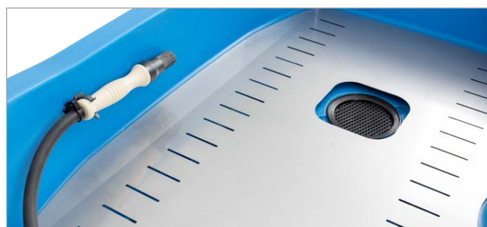
Perforated plate, Order number 274-095-B1