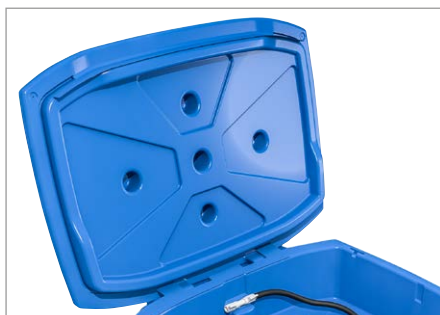
Lid, order number 274-098-B1