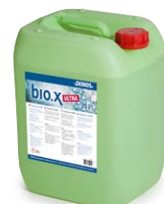
20 litre canister, Order number 194-745-B1