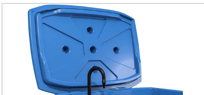
Lid, order number 274-093-B1