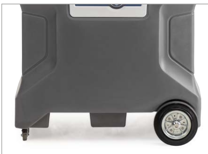
Set of castors, Order number 274-103-B1