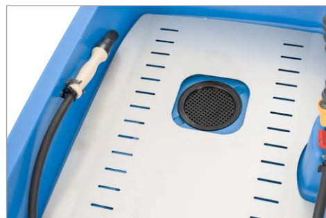
Perforated plate, Order number 274-099-B1