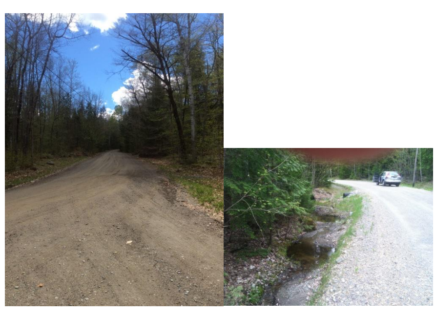
Cedar Rest Rd.