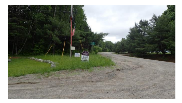
Webb Cove Rd.