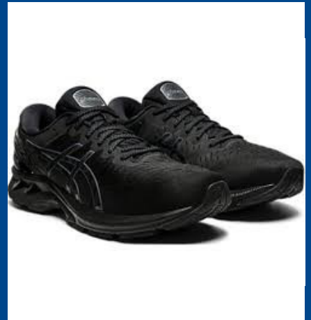
Asics Gel Kayano 27 Men's US Sizing 8-13 $260