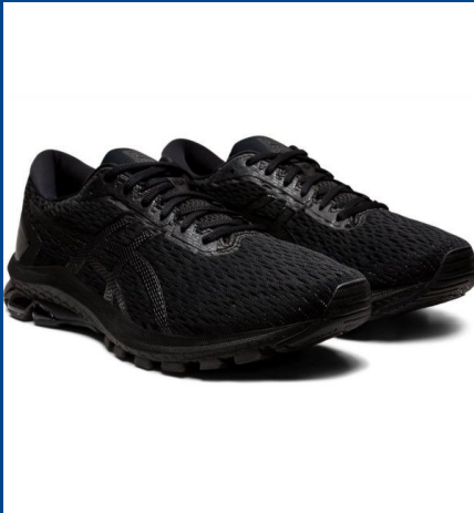
Asics GT1000 9 Women's US Sizing 6-10 $180