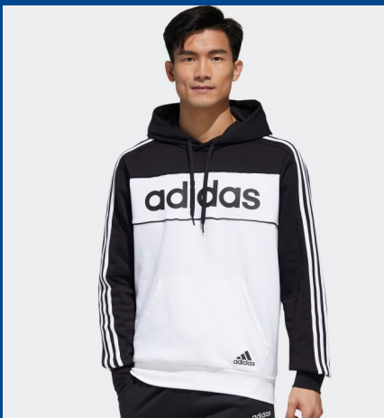
Adidas Essentials Hoodie Men's Sizing XS - XXL $80