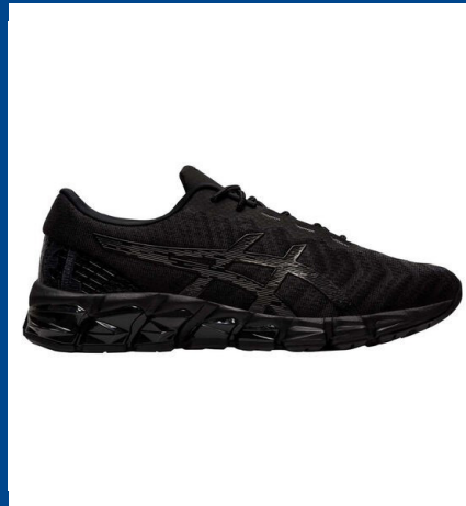
Asics Gel Quantum 180 Men's US Sizing 8-13 $200