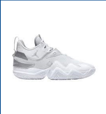
Jordan Westbrook Men's US Sizing 8-13 $140