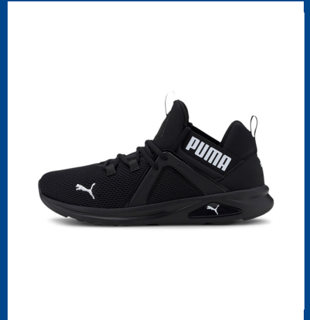
Puma Enzo Men's US Sizing 8-13 $110