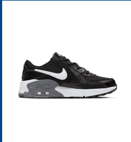
Nike Air Max Excee PS Kid's Sizing US 11C-3Y $95