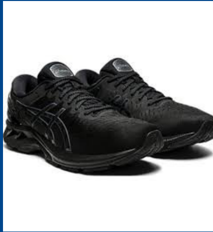
Asics Kayano 27 Women's US Sizing 6-10 $260