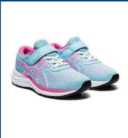
Asics Pre Excite PS Velcro Kid's Sizing US 11C-3Y $90