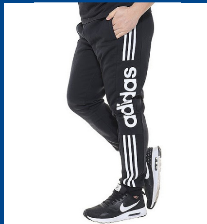
Adidas Essentials Pants Men's Sizing XS - XXL $70