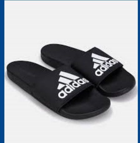
Adidas Adilette Slides Men's US Sizing 8-13 $50