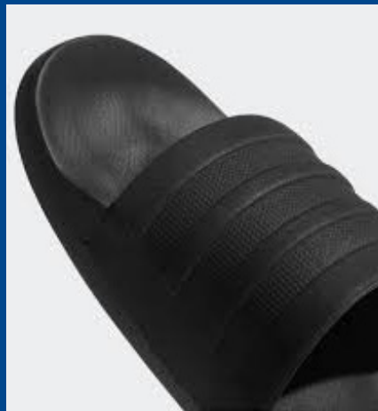
Adidas 3 Stripe Slides Women's US Sizing 6-10 $50