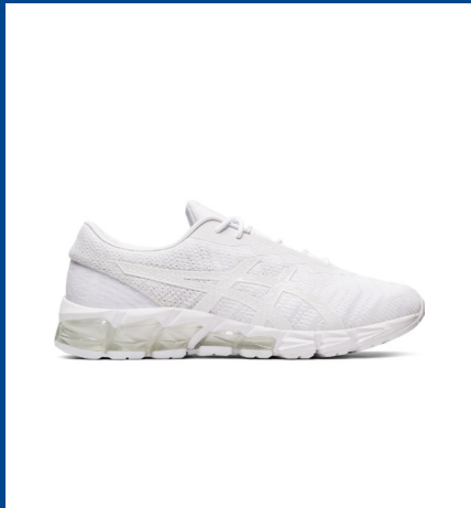
Asics Gel Quantum 180 Men's US Sizing 8-13 $200