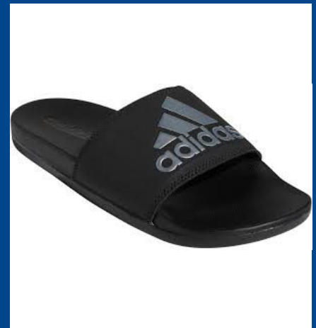
Adidas Adilette Slides Women's US Sizing 6-10 $50