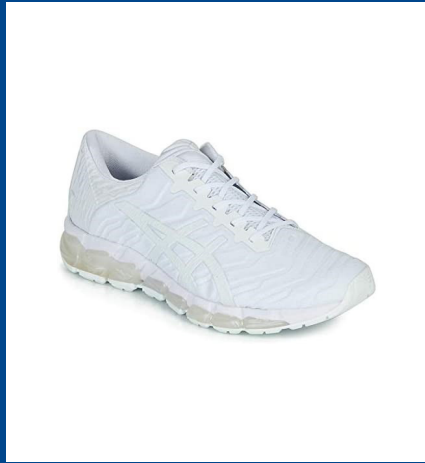
Asics Gel Quantum 360 Men's US Sizing 8-13 $260