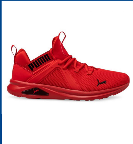
Puma Enzo Men's US Sizing 8-13 $110