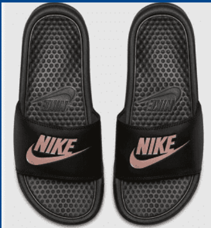
Nike Benassi Slides Black Women's US Sizing 6-10 $40