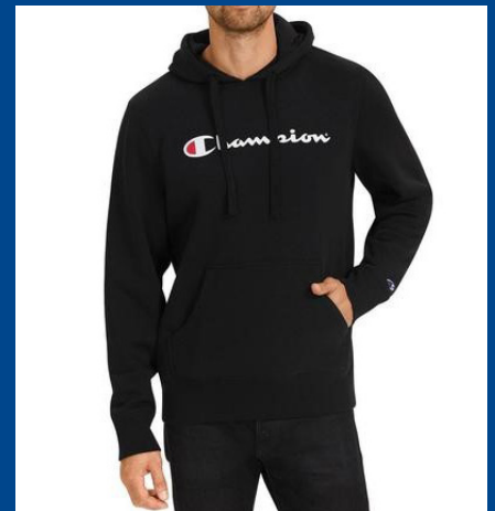
Champion Hoodie Men's Sizing S - XXL $70