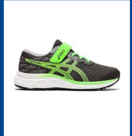
Asics Pre Excite PS Velcro Kid's Sizing US 11C-3Y $90