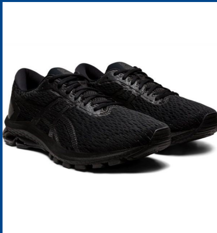
Asics GT1000 9 Men's US Sizing 8-13 $180