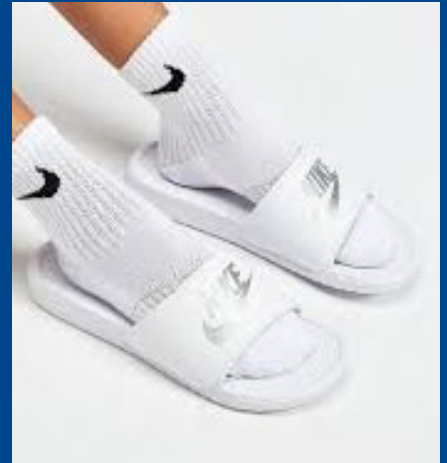
Nike Benassi Slides White Women's US Sizing 6-10 $40