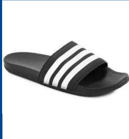
Adidas 3 Stripe Slides Men's US Sizing 8-13 $50