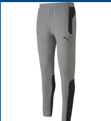
Puma Evostripe Pants Men's Sizing S - XXL $70