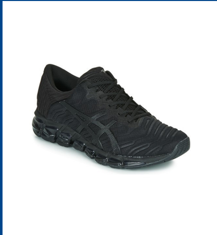
Asics Gel Quantum 360 Men's US Sizing 8-13 $260