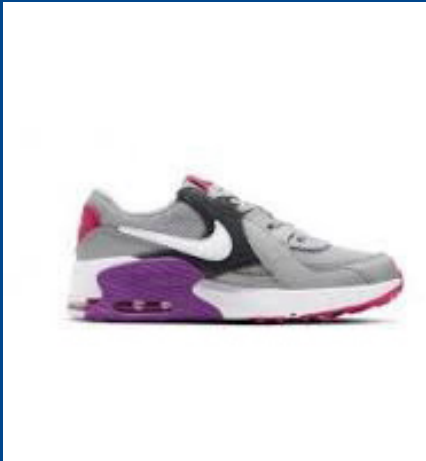
Nike Air Max Excee PS Kid's Sizing US 11C-3Y $95