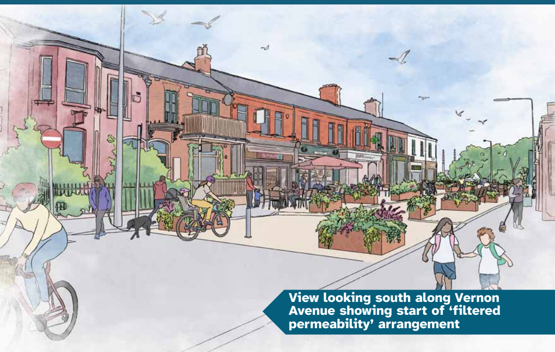
View looking south along Vernon Avenue showing start of 'filtered permeability' arrangement