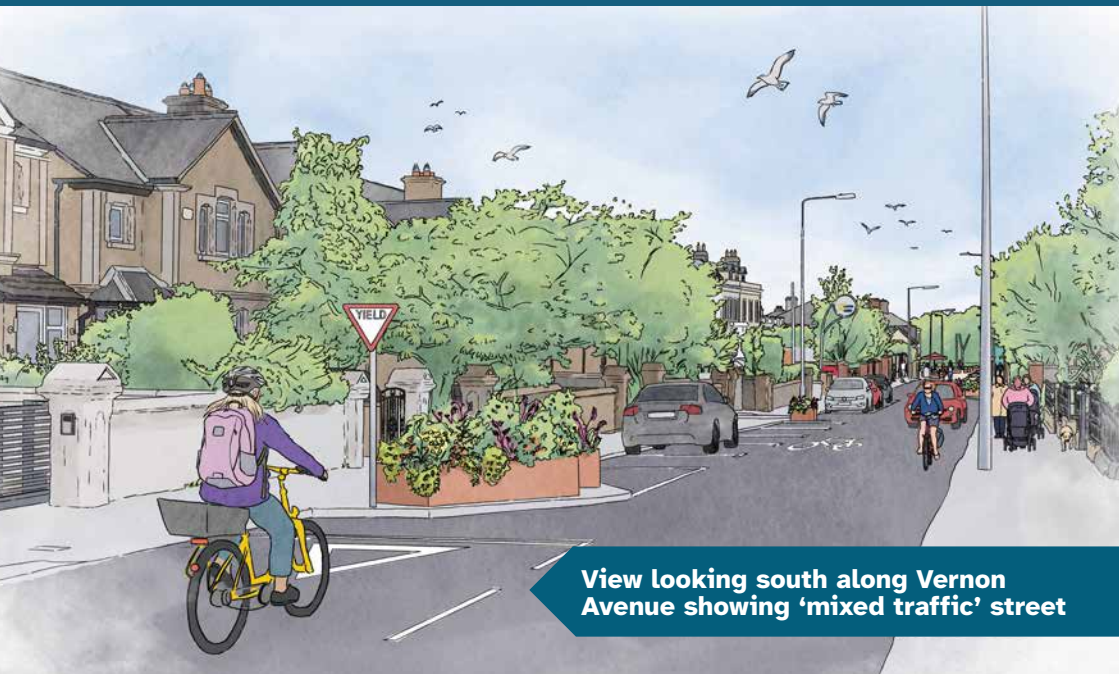
View looking south along Vernon Avenue showing 'mixed traffic' street