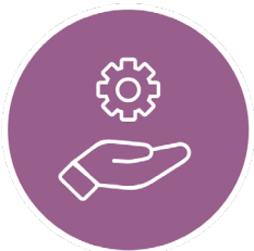
MAINTENANCE AND OPERATIONS POLICIES