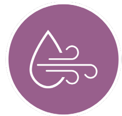
AIR AND WATER QUALITY