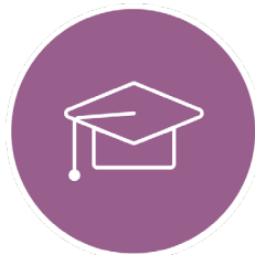
WELLBEING EDUCATION AND ENGAGEMENT