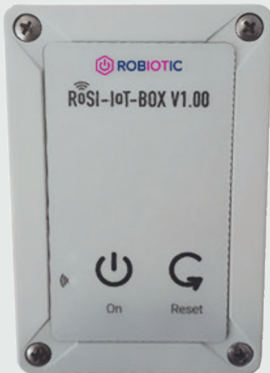
Customizable ROBIOTIC RoSi-IoT-Box

With its internal antenna, ROSI is able to work even as a stand-alone unit (in 2G or 3G versions). Optionally ROSI offers a variety of uFL ports for external devices as well as GPS antennas.