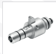
Quick ISO for straight and contra-angle handpieces.