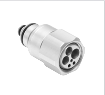
Quick RM for turbine handpieces

Thanks to the revolutionary Quick Connect System by W&H, switching between handpieces has never been easier. Simply connect the Quick ISO or the Quick RM and start maintaining all transmission instruments with a standard ISO or 4/6-hole connection. Thanks to its wide range of adaptors, the Assistina One can meet the requirements of all clinics.