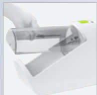
Removable rotating window Seals the maintenance area and can easily be removed

Assistina One is the first choice for maintaining dental transmission instruments, including handpieces, air motors and air scalers. The new generation of the W&H single-port device is equipped with the exceptional Quick Connect System for switching between handpieces. It can be easily adapted to individual needs and fits perfectly into every workflow.