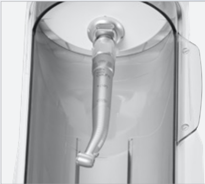
Quick ISO for straight and contra-angle handpieces