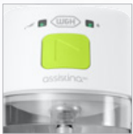
One-touch start button For intuitive use and easy handling