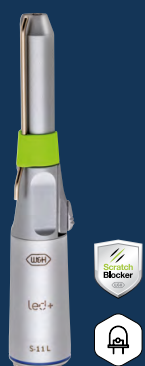
Straight handpiece S-11 L / 1:1