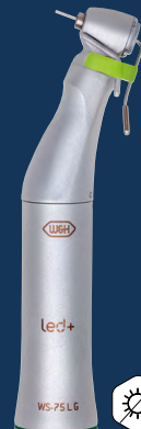
Contra-angle 20:1 WS-75