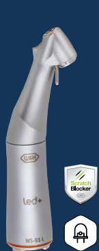
Contra-angle WS-91 L / 1:2.7