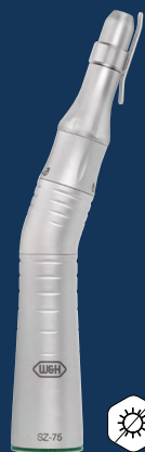
Handpiece 20:1 Zygoma SZ-75