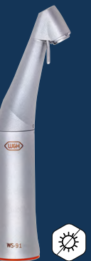
Contra-angle WS-91 / 1:2.7