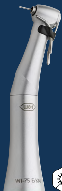
Contra-angle 20:1 WI-75 E/KM