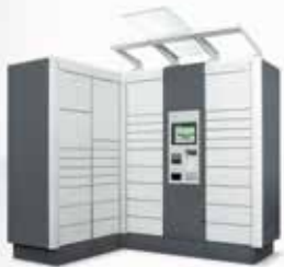
Automated parcel terminals