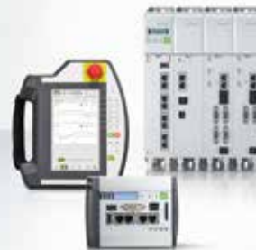
Control systems for industrial robots