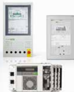
Automation solutions for machines