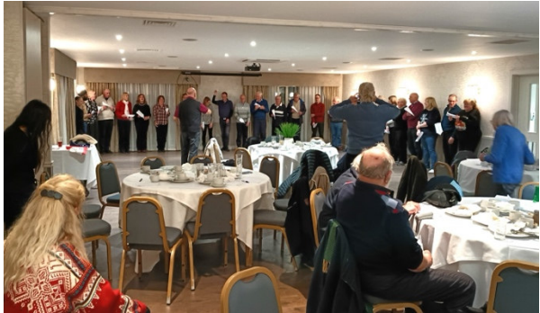
Paper Planes at the end of the New Year Run