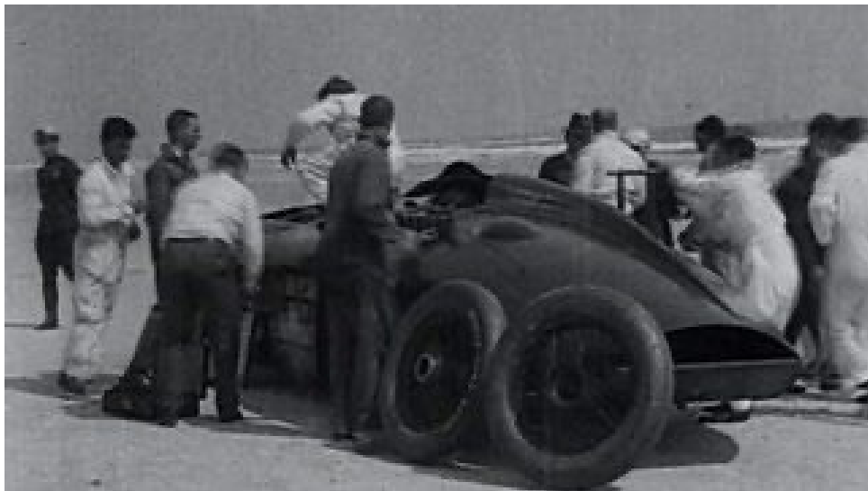
Sunbeam 1,000hp breaks the 200mph land speed barrier