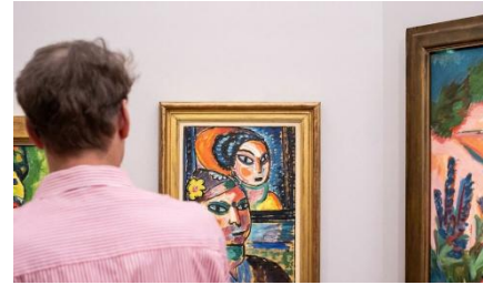
Kunst: Alexej von Jawlensky

https://hortencollection.com/en/guided-tours-and-workshops/for-adults