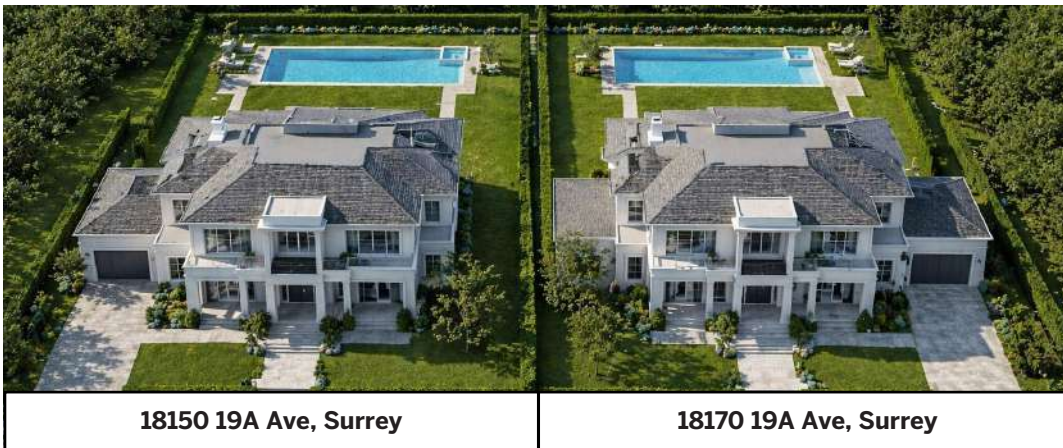
18150 19A Ave, Surrey