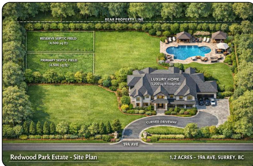
Redwood Park Estate - Site Plan