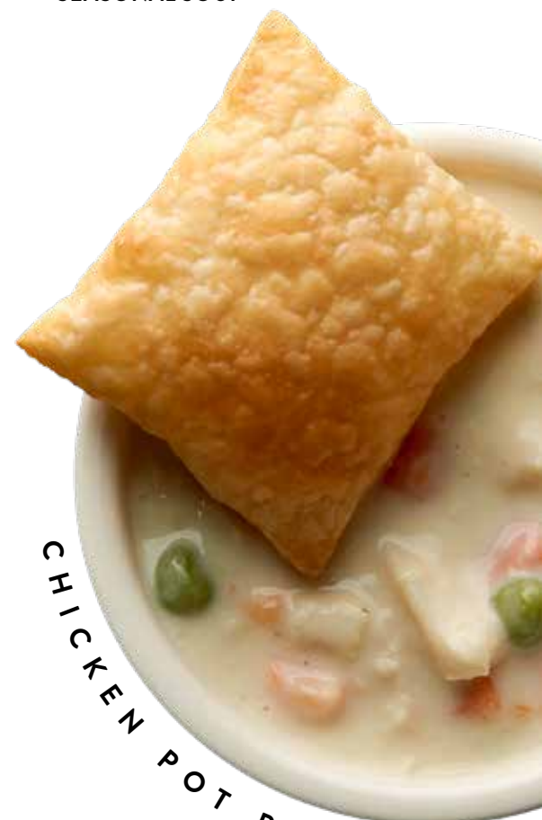
CHICKEN POT PIE SOUP