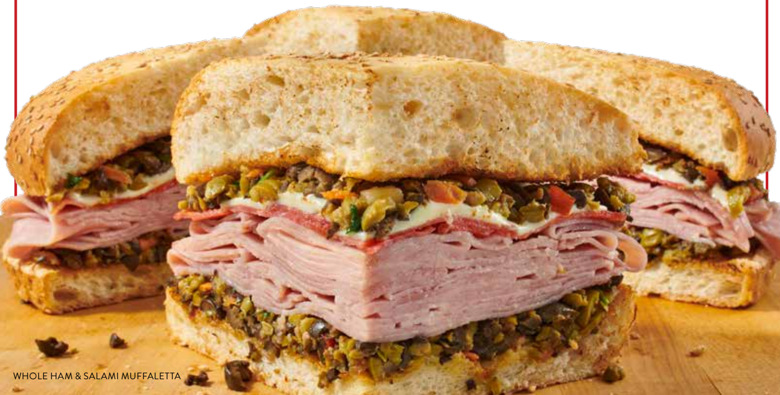
WHOLE HAM & SALAMI MUFFALETTA