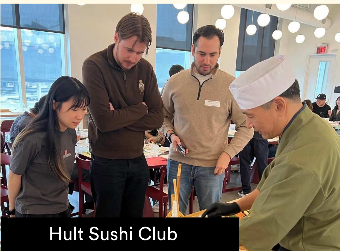
Hult Sushi Club