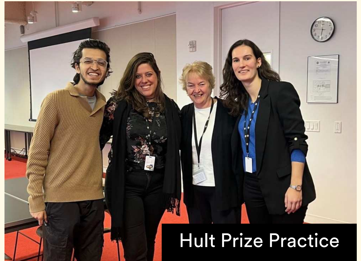
Hult Prize Practice