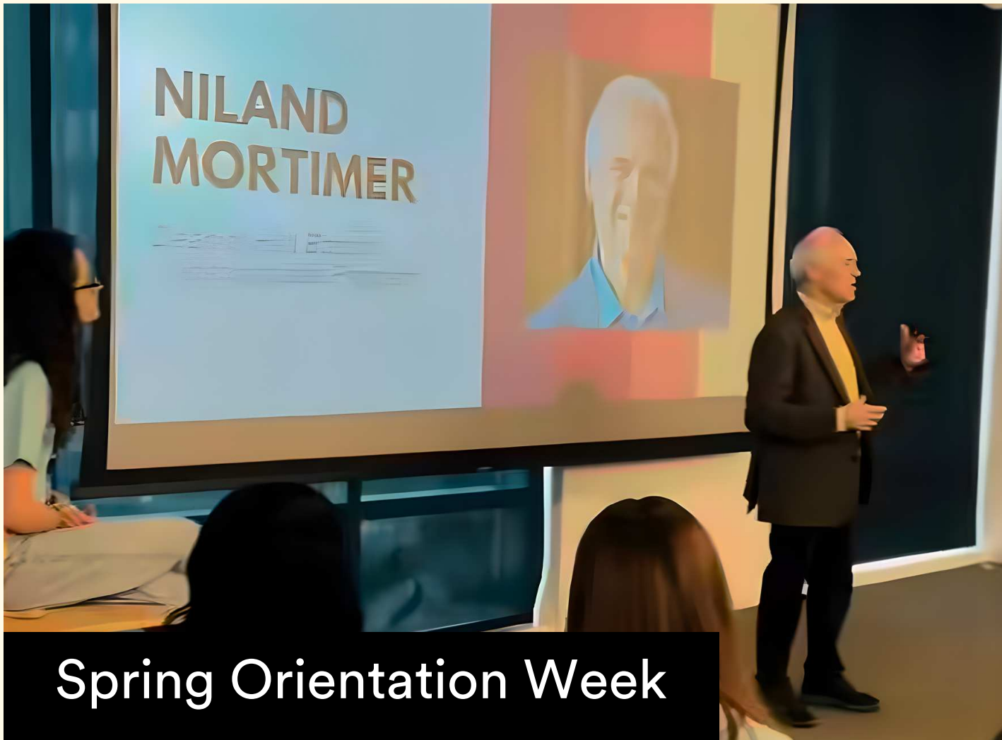
Spring Orientation Week