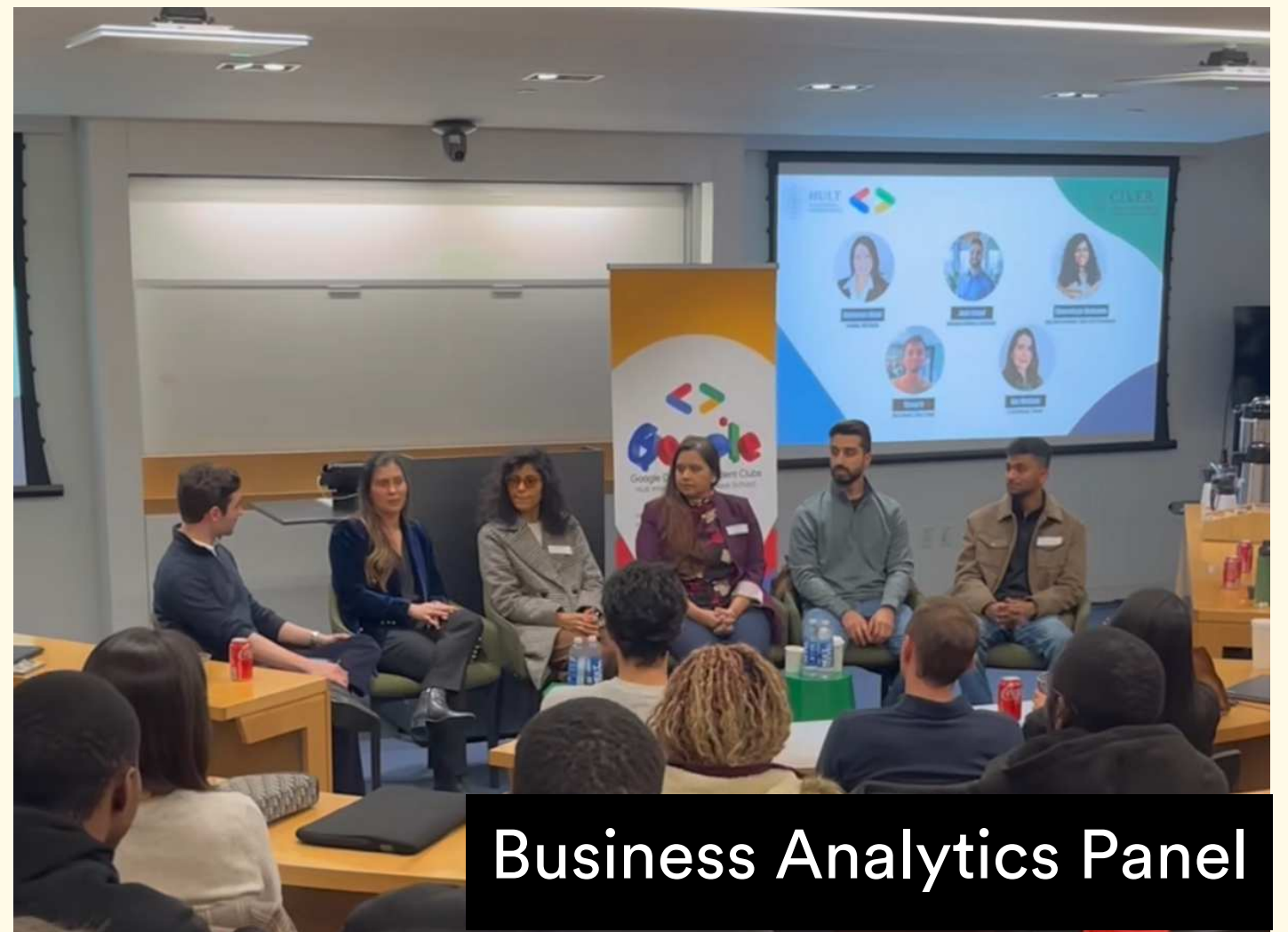
Business Analytics Panel