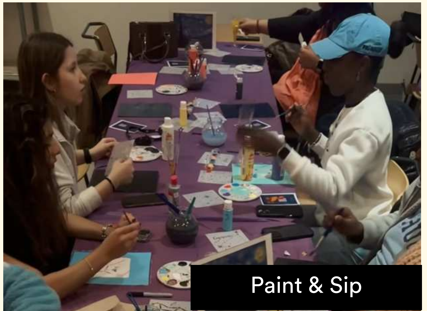
Paint & Sip