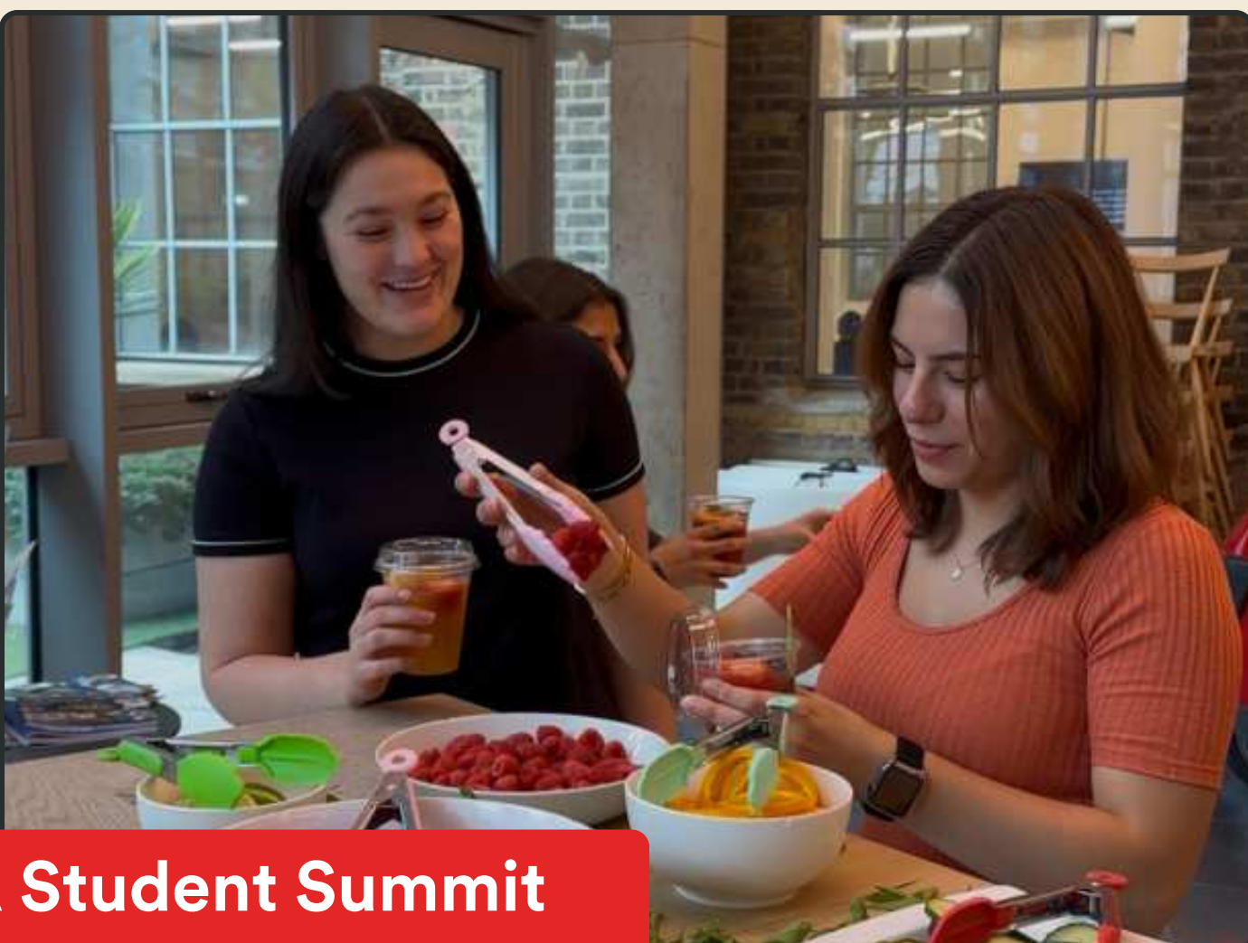
ALPFA Student Summit