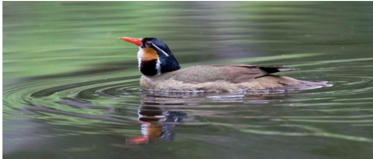
Sungrebe (singing)

If we were able to anchor near Zapote Creek overnight, we'll likely be out along this stream early this morning, or on another similar tributary of the Ucayali where we will continue to explore the area from small boats. Because the upper part of this river is a particularly wild area, we'll get an early start. This is a good region for raptors as well as parrots and parakeets, and we may see pairs or families of Blue-and-yellow Macaws, and even Scarlet Macaws along the river. In the upper portions of Zapote Creek, we have had good success with raptors, and have, on past tours, recorded both Harpy Eagle and Crested Eagle here, as well Gray-headed Kite, Hook-billed Kite, Slender-billed Kite, Buckley's Forest-Falcon (very rare) and more common species such as Black-collared Hawk and Slate-colored Hawk. A sample of other birds here might include almost any of the species mentioned on days 3 and 4, as well as Capped Heron, Rufescent Tiger-Heron, Green Ibis, Great Black-Hawk, Speckled Chachalaca, Sungrebe, Sunbittern (scarce), Chestnut-fronted Macaw, Black-throated Mango, up to five species of kingfishers, Forest and Yellow-crowned elaenias, Cinnamon and White-eyed (Dull-capped) attilas, Lesser Kiskadee, and Gray-capped Flycatcher. This is also an excellent area for primates and among the possibilities are Red Howler Monkey, Night Monkey, Squirrel Monkey, Saddle-backed Tamarin, Dusky Titi-Monkey, Brown capuchin, and perhaps even the unusual Monk Saki (scarce and retiring).