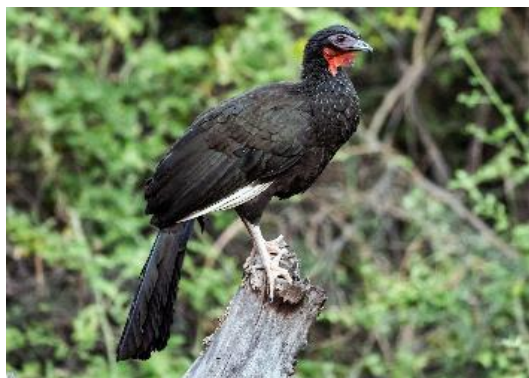
White-winged Guan

This morning after a well-deserved sleep, enjoy a cup of coffee while we indulge our eyes at a small hummingbird pool-party by a running creek just below the outdoor dining room, a great way to start the day! The number of species vary seasonally and based on weather conditions, with less species on overcast mornings. This oasis is visited frequently by Amazilia and Tumbes hummingbirds. Purple-collared Woodstars, Long-billed Starthroat, Peruvian