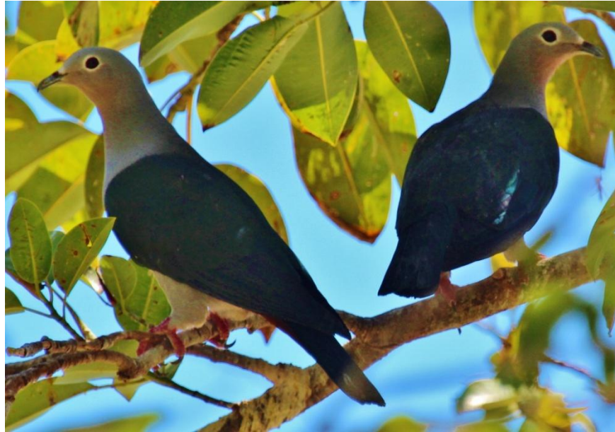
A pair of Island Imperial-Pigeons - set against a turquoise blue ocean in New Britain.

New Britain is the largest of the Melanesian islands in the Bismarck Archipelago. It has a unique bird fauna, reflecting the fact that it has never been in contact with mainland New Guinea, allowing colonizing species to evolve in isolation. It is a superb coral fringed, forest-covered island dominated by volcanoes, some of which are active. The forests support an amazing biomass of birds, many spectacular, raucous and conspicuous. It will be impossible to miss such species as the Brahminy Kite, Blue-eyed Cockatoo, Eclectus Parrot, Blyth's Hornbill and Purple-bellied Lory.