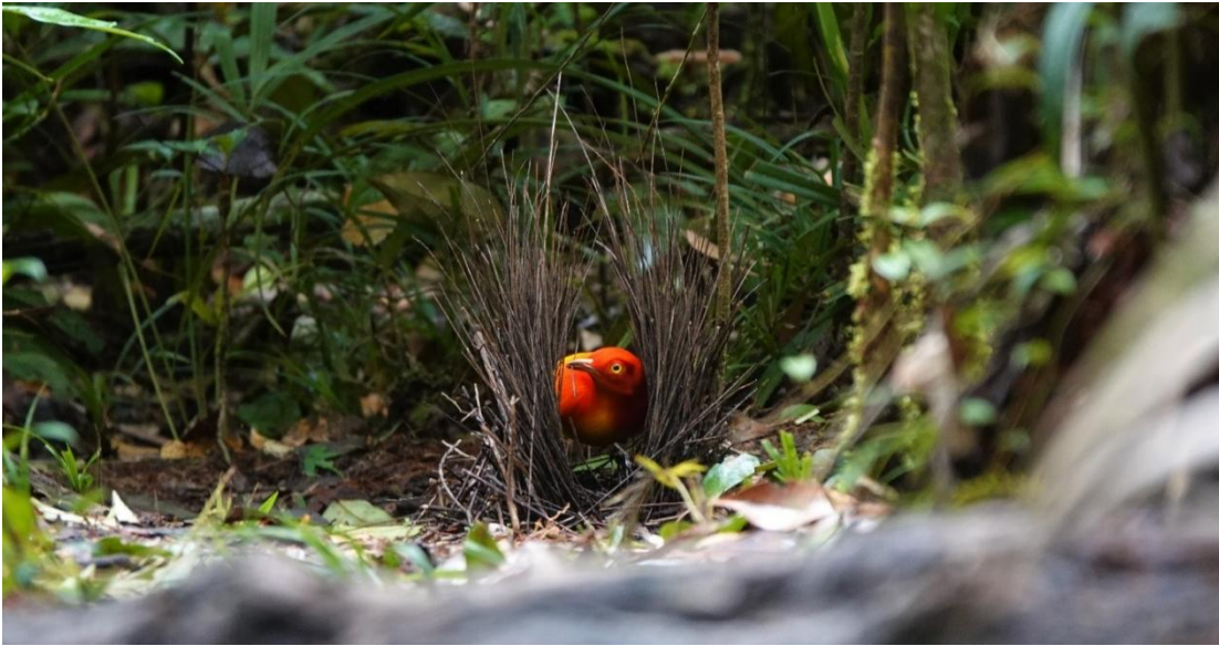
The breathtaking male Flame Bowerbird is always a possibility around Kiunga

If we can find an appropriate flowering tree, we should see a nice selection of honeyeaters including several myzomelas and meliphagas. Typically, they will be busily competing with the shy Meyer's Friarbird and Plain, Streak-headed and the elusive Obscure honeyeaters. Other species we will be looking for include White-spotted Munia, a rather nomadic species; possibly the poorly known, Yellow-eyed Starling; Golden and Yellow-faced mynas; and the dapper Lowland Peltops. Flame Bowerbird is one of the area's most sought after species. Previous tours we have been treated to several sensational views of this spectacular bird, but it remains an overall elusive species.