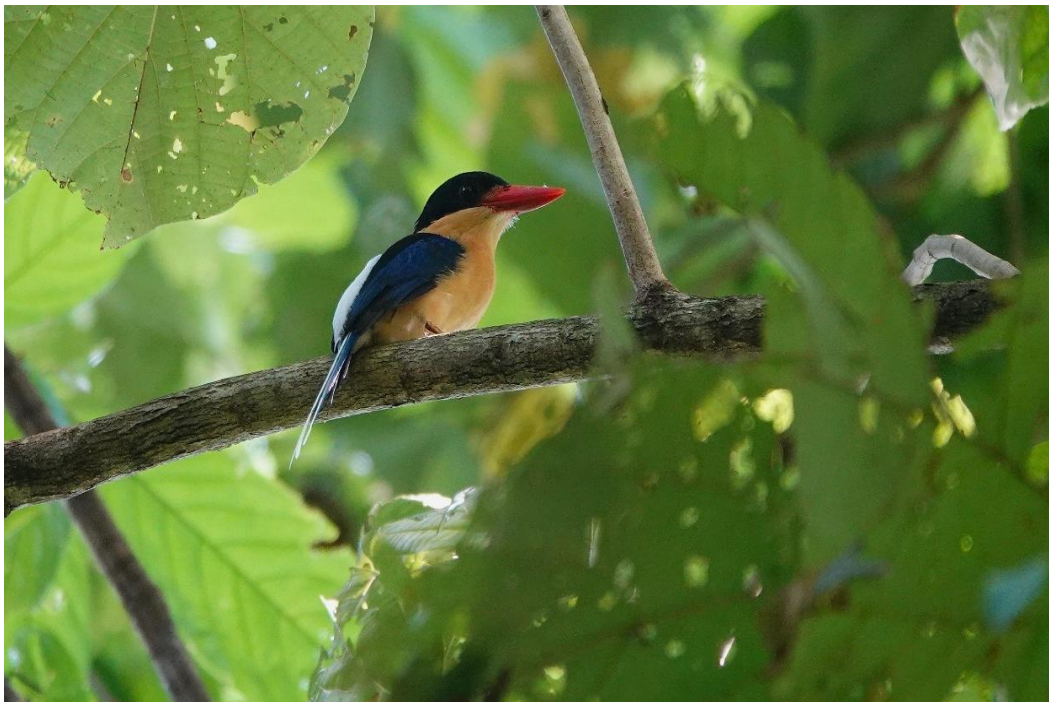
The Black-capped Paradise-Kingfisher is endemic to New Britain

NIGHT: Walindi Plantation Resort, West New Britain