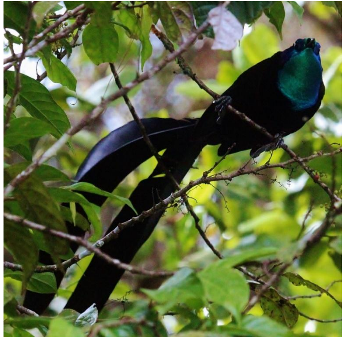
The male Stephanie's Astrapia is a prized sighting at Ambua Lodge.

Other birds we may encounter include four species of rather retiring tiger-parrots; Papuan King-Parrot; Fan-tailed Cuckoo and Rufous-throated Bronze-Cuckoo; Papuan Boobook; Mountain Swiftlet; Mountain Kingfisher; Hooded Cuckooshrike and Black-bellied Cicadabird; Long-tailed Shrike; Pied Bushchat; Papuan Island Thrush; Papuan Logrunner (shy); Island Leaf-Warbler; White-shouldered and perhaps Orange-crowned fairywren; Mountain Mouse-Warbler; three species of diminutive scrubwrens; the songful Brown-breasted Gerygone; Gray Thornbill; Dimorphic, Friendly and Black fantails; the very handsome Black-breasted Boatbill; Canary Flyrobin; Black Pitohui; Papuan and Black sittellas; Mid-mountain and Fan-tailed berrypeckers;