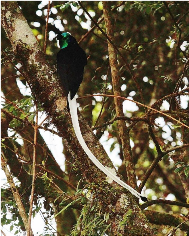
A male Ribbon-tailed Astrapia glows in the dark forest at Kumul Lodge.

Also present are the elusive Bronze Ground-Dove, two species of rather retiring tiger-parrots— Brehm’s and the uncommon Painted; five species of lorikeet (Stella’s, Plum-faced, Orange-billed, Yellow-billed and in the lower valley sometimes Goldie’s); Rufous-throated Bronze-Cuckoo; Archbold’s Nightjar (scarce); Mountain Swiftlet; Long-tailed Shrike; Pied Bushchat; Papuan Island Thrush; Blue-capped Ifrita; Regent, Brown-backed and Black-headed whistlers; Rufous-naped Bellbird; Island Leaf-Warbler; Mountain Mouse-Warbler; Papuan and Large scrubwrens; Brown-breasted Gerygone; Dimorphic and Black fantails; the very handsome Black-breasted Boatbill; Canary Flyrobin; the peculiar-looking Wattled Ploughbill; Mid-mountain and Fan-tailed