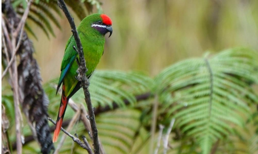
Plum-faced Lorikeet © Max Breckenridge

Capped and New Guinea white-eyes; Hooded Munia; Mountain Firetail; Mountain Peltops; Great Woodswallow; Black Butcherbird; and with luck, the elusive Archbold's and MacGregor's bowerbirds.