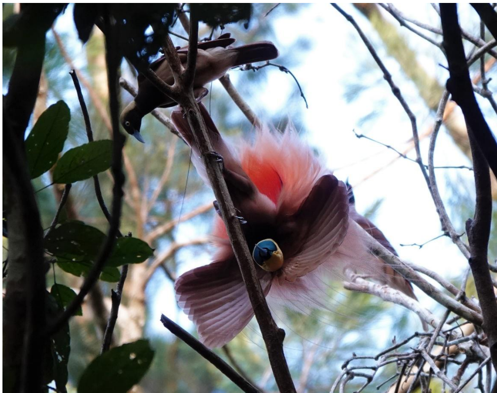
We have a good chance of seeing the extravagant display of the famous Raggiana Bird-of-Paradise

NOTE: Papua New Guinea is very special and one of the most exciting places to visit on earth. However, the internal airline schedule can change frequently. This itinerary is subject to change, dependent on the existing internal air schedules, which may affect the order of the day-to-day activities. Please be assured that the focus of the tour will stay the same and you will still visit all the same areas. It is also important to realize that security can be an issue, and participants are advised not to go birding on their own and always follow the instructions of the leader.