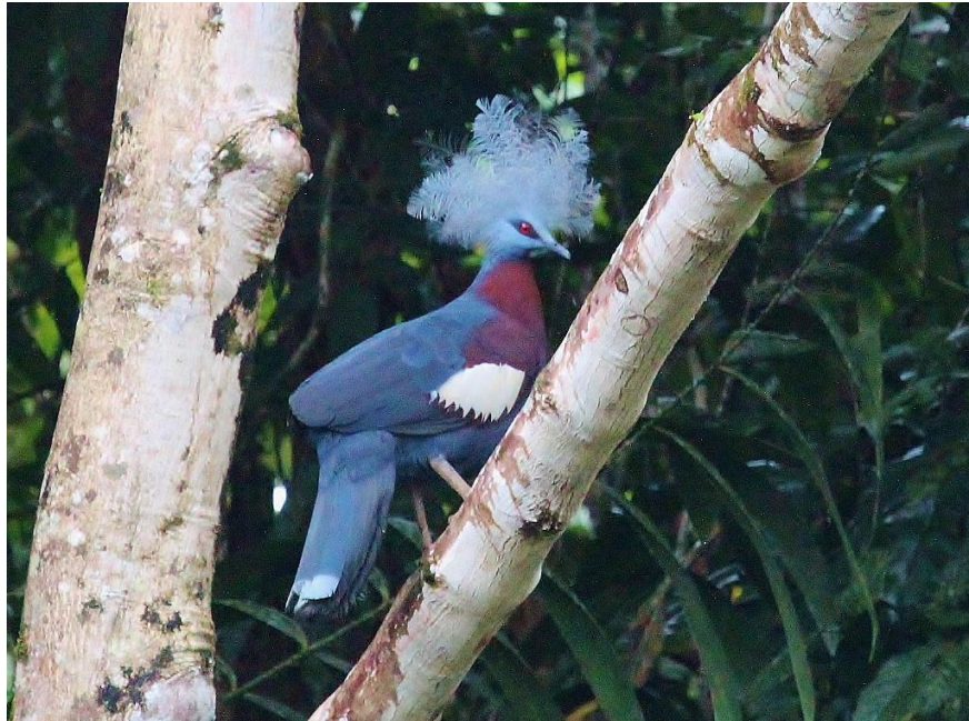
The amazing Sclater's Crowned Pigeon is a chance along the rivers near Kiunga