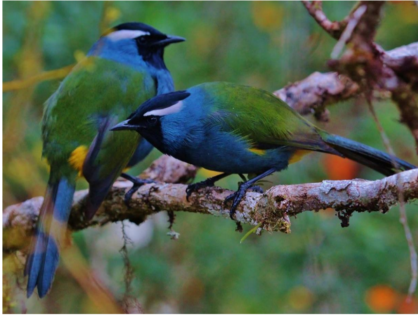
The superb Eastern Crested Berrypecker from Kumul Lodge; representative of a New Guinea endemic bird family