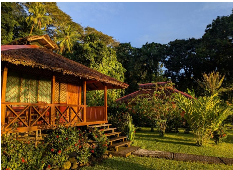
Walindi Plantation Resort lodgings

NIGHTS: Walindi Plantation Resort, West New Britain