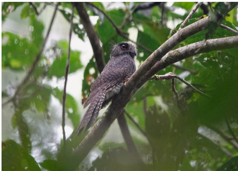
The Barred Owlet-Nightjar is one representative of a small family unique to Australasia and is sometimes encountered in Varirata NP

Varirata harbors an astonishing array of PNG's most alluring but elusive specialties, many of which are ground-birds. With a bit of luck, we should be able to lure a few of these species into view. Genuine skulkers include Pheasant Pigeon, Painted Quail-thrush, Chestnut-backed Jewel-babbler, Papuan Scrub-Robin, Piping Bellbird and Ochre-breasted Catbird.