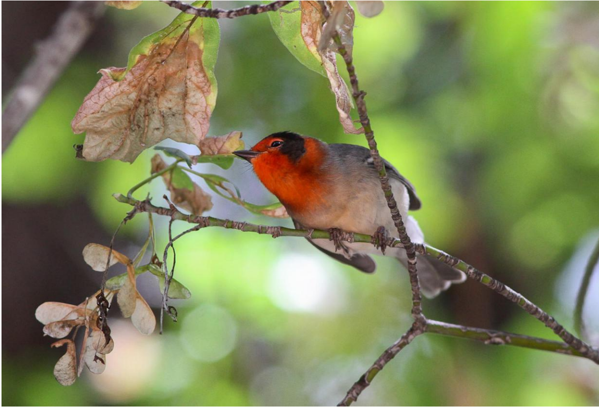
Red-faced Warbler

Camp Chiricahua, co-sponsored by Black Swamp Bird Observatory (Ohio), offers young naturalists between the ages of 14 and 18 the opportunity to explore the biologically rich ecosystems of Southeast Arizona, centering on the famed Chiricahua Mountains. The primary focus is on the birdlife of the Chiricahuas (pronounced Cheer-ick-ow-wahs) and other important sites in Southeast Arizona, but we will take time to observe all facets of nature and emphasize patient field observation, note taking, and learning bird sounds. The camp is set in a productive learning environment in which participants are educated on ecology, habitats, and ecosystems, and on increasing observation skills. Daily activities are based on thorough exploration of each of the distinct regions we visit. Hikes, field trips, and discussions will complement free time, during which campers will have the luxury of exploring their natural surroundings in small groups.