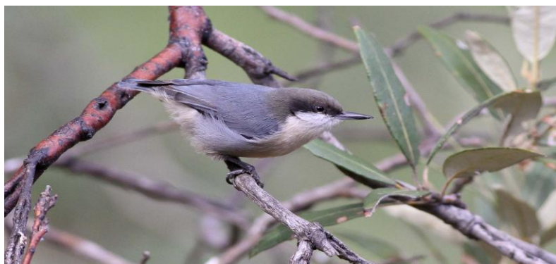
Pygmy Nuthatch