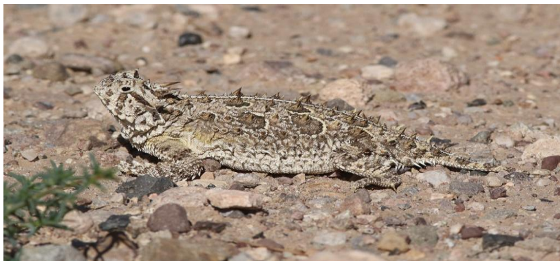
Texas Horned Lizard

We will depart early today to explore our final mountain range, the Santa Ritas. Our itinerary will be somewhat flexible, but our first stop will likely be Box Canyon, a remote and rugged landscape with rocky slopes covered in ocotillo. This beautiful canyon has received more attention from birders