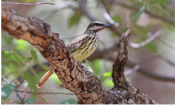
Sulphur-bellied Flycatcher

Cave Creek Canyon – One of the most exciting days will be our first visit to the South Fork of Cave Creek. This is a beautiful riparian habitat in the lower elevations of the Chiricahuas, where oaks, sycamores, pines, and cypress provide shade for the lush green undergrowth. The birds here are wonderful; Elegant Trogon must lead the list, but Blue-throated Mountain-Gem, Arizona Woodpecker, Sulphur-bellied and Dusky-capped flycatchers, Hutton's and