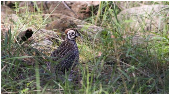
Montezuma Quail © Michael O'Brien

owls, Common Poorwill, and Mexican Whip-poor-will elevate the ambience of a Chiricahua summer evening, and we have decent chances of seeing some of these nocturnal sprites. On another evening we will load up and head out to the desert for a night drive. Cruising lightly traveled side roads brings opportunities for a variety of other critters, including snakes, toads, kangaroo rats, scorpions, and tarantulas.