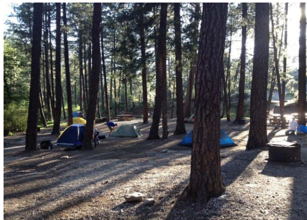
Rose Canyon Lake Campground

NIGHT: Camping at Rose Canyon Lake, Catalina National Forest