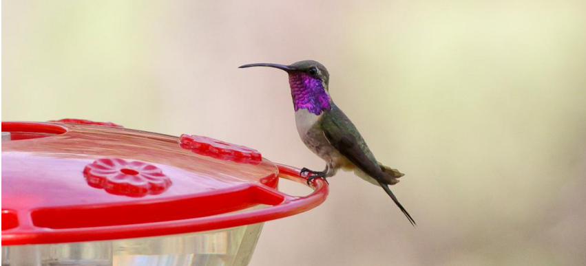
Lucifer Hummingbird

we will likely visit Miller Canyon. Miller Canyon is well known for rarities, having hosted such exciting subtropical wanderers as Eared Quetzal, Aztec Thrush, Brown-backed Solitaire, and Tufted Flycatcher. While such dream sightings should not be expected, the possibility of something new and remarkable awaiting discovery at the next turn of the trail adds an undeniable sense of excitement.