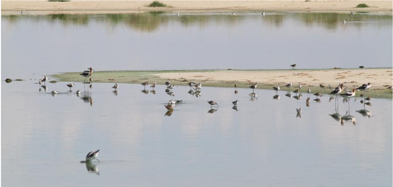
Shorebirds at Lake Cochise

East of Wilcox, the highway skirts the north flank of the Chiricahuas, offering fine views of the peculiar geologic formation known as Cochise’s Head. We’ll arrive in the Portal area, near the mouth of Cave Creek Canyon, late this afternoon. Our first view of the canyon, with its towering, multi-colored cliffs and lush riparian floor, will make a lasting impression. It is these secret enclaves of cool and verdant growth, filled with specialty birds and surrounded by arid grasslands that make birding Southeast Arizona so special.