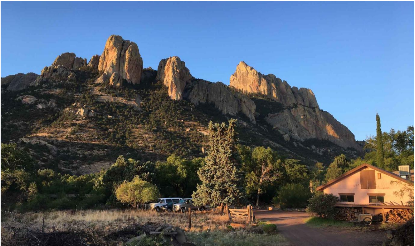
Cave Creek Ranch

Starting in Tucson, we will first do some desert birding on the east side of town before ascending Mount Lemmon in the Catalina Mountains. Two nights of camping in the forested highlands will acquaint us with the “sky islands” so very characteristic of the borderlands of Southeast Arizona.