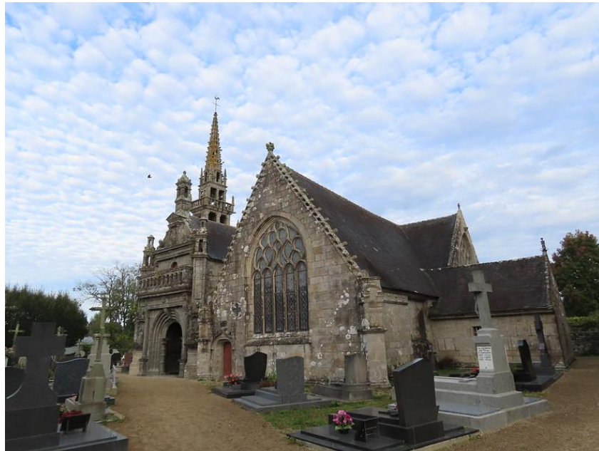
The spectacular enclos of Trémaouézan.

Breakfast in our hotel is served beginning at 5:00 am, but given the late sunrise, we have no need to rush, especially as our first birding destination is a scant twenty-minute west of our hotel. We plan to leave the hotel at 8:30 for the brief drive to the Lann Gazel Regional Nature Preserve, which today occupies five hundred acres of bogs, forest, and heath once destined to serve as a landfill for the Brest area. Surrounded by pasture and cropland, the preserve is home to several rare plant species. Among the birds we'll be hoping to find here are such colorful residents as the Eurasian Jay, Eurasian Nuthatch, and Yellowhammer; migrants may include Barn Swallows, Common Chiffchaffs, and Barn Swallows.