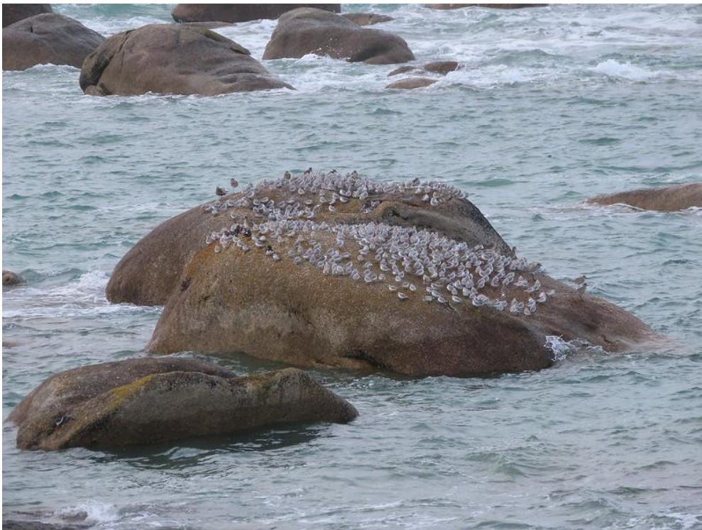
A gathering of Sanderlings, Ruddy Turnstones, and Black-bellied Plovers at our hotel.

Life on the wild and rocky coast of northern Brittany is measured by the tides, and the activities of both the birds and the birders depend closely on water levels. Thus, we may find ourselves needing to occasionally adjust our day-to-day scheduling to take us to sites where conditions are optimal. The best of those sites is right on the Bay of Goulven, whose waters lap at the seawall below our hotel.