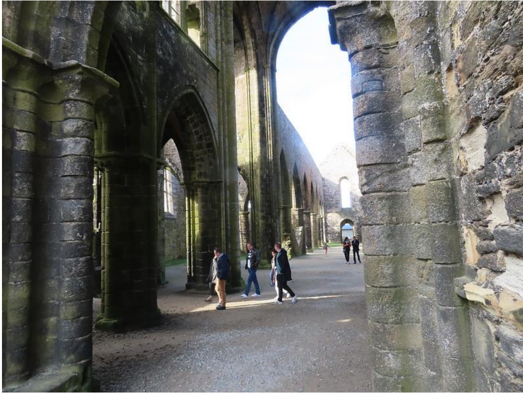
The awe-inspiring ruins of the abbey church of Saint-Mathieu.

We will have an outstanding lunch across the street from the lighthouse, then visit Le Conquet, a picturesque fishing community that is the most westerly municipality in continental France. The town's erstwhile military significance is still reflected in the fragments of fortification around the snug harbor; just across the water stands the unusual square lighthouse of Kermorvan, rising twenty stories above the rocks and sea, its light visible from twenty-five miles away. Our time here will be largely unstructured, a chance to do some shopping or to admire the lively harbor.