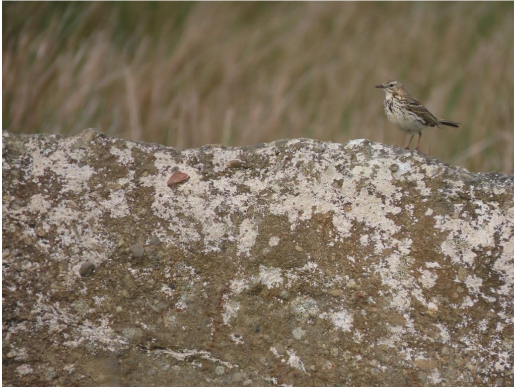
Meadow Pipits are the most abundant passerine migrant at this season.

Seabirds, too, occur at this season in respectable numbers, and we will watch from the seawall at our hotel for Parasitic Jaegers, Northern Gannets, and Manx Shearwaters. Much of our time, though, will be spent birding traditional migrant traps in search of everything from Crested Tits and Zitting Cisticolas to Firecrests and Fieldfares. October is prime time, too, for a wide range of much scarcer migrants, among them the enchanting little, Red-breasted Flycatcher, the bizarre Rosy Starling, and the irresistible Pallas's Leaf Warbler. Even if a given day passes without our discovering a real rarity, we can count on enjoyable days in the field with large numbers of birds, a chance to truly get to know species seen elsewhere in scattered ones and twos.