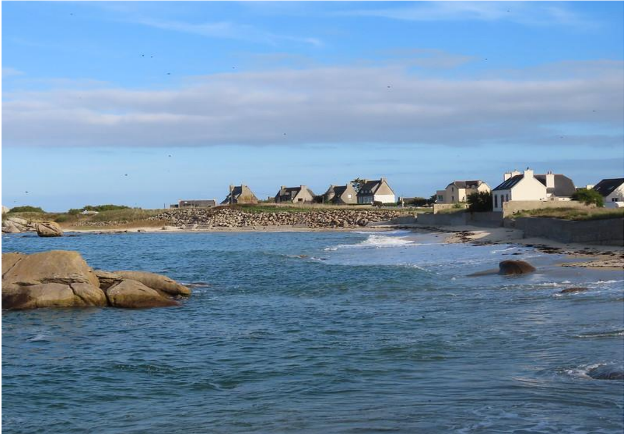
The stunning view from the Hotel de la Mer.

They call it Finistère, the ends of the earth, and this westernmost jurisdiction in metropolitan France preserves some of the wildest and most breathtakingly beautiful landscapes in all of Europe. Rocky headlands, ocean bays, and vast sandy beaches are the backdrop to scattered villages where the Breton language and ancient Celtic folkways survive, while scrubby forests, dunes, and heath are home to breeding birds now rare elsewhere in Europe. Nature and culture come together most delightfully in October, when the year's cider is pressed and migrant birds pour in from all directions: over the years, more than 330 species have been recorded here in that month, including hordes of Arctic shorebirds and waterfowl, finches and pipits from Scandinavia and Russia, and hawks and warblers from continental Europe.