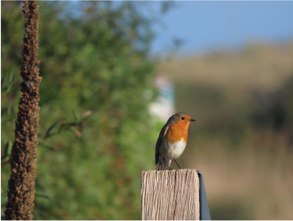
Common, confiding, and noisy at this season: the European Robin.