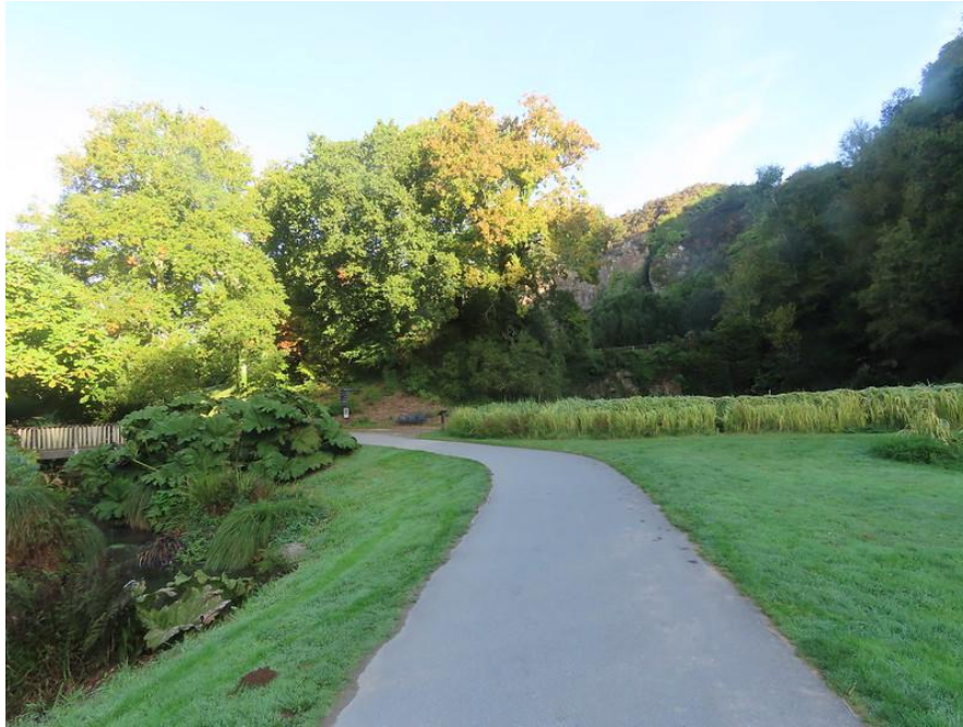
The National Botanical Conservatory in Brest.

From Le Folgoët, we will drive the final 20 minutes north to the shores of the Celtic Sea, where the waters of the English Channel meet the open Atlantic. Our aptly named hotel perches on the wild rocks above the beach, with European Shags, Rock Pipits, and a nice selection of shorebirds and gulls often visible right from our sea-view windows. We will check in, then offer our first bit of daily seawatching from the hotel seawall or the nearby radar tower. Mediterranean Gulls, Northern Gannets, and hordes of migrating Sanderlings and Ruddy Turnstones are among the birds we can expect to see, and if conditions are right, even a Sabine's Gull or Cory's Shearwater may drift by.