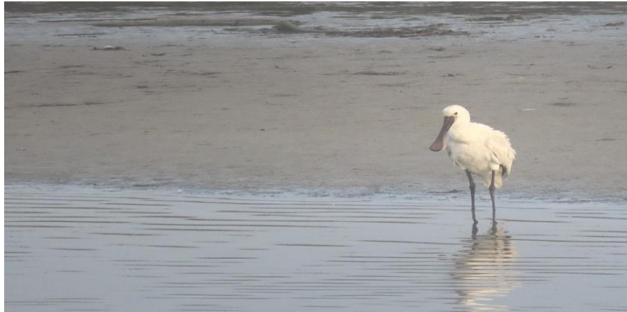
An uncommon visitor to the Bay of Goulven, the European Spoonbill.

water and mudflats, where Common Shelducks, Sandwich Terns, and European Stonechats are among the specialties we will hope to encounter. Eurasian Spoonbills, locally scarce, are possible here, and Northern Wheatears, Meadow Pipits, and Eurasian Skylarks can occur in good numbers given the right winds.