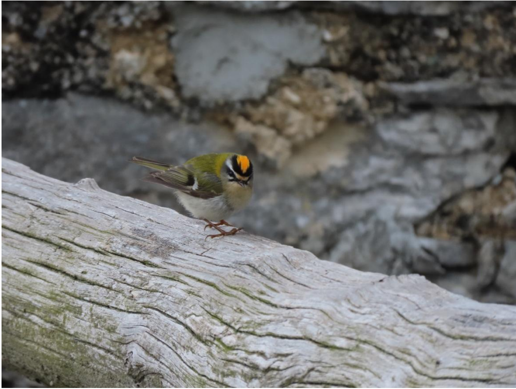
A southbound Common Firecrest pauses on the beach.