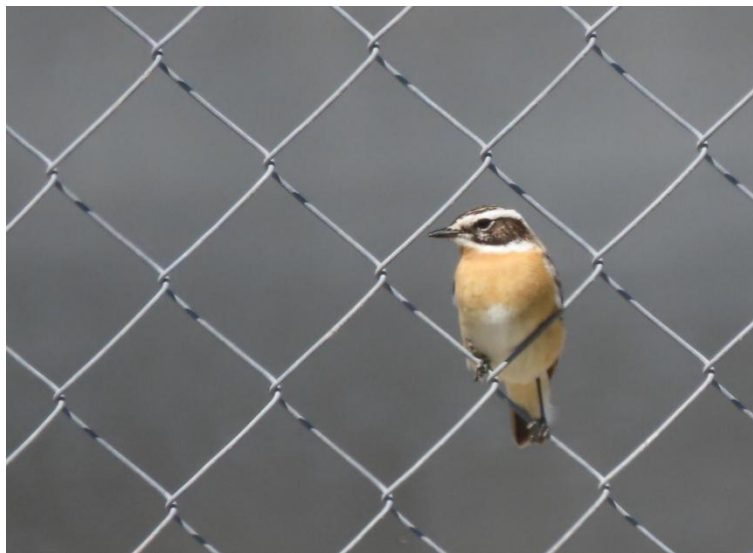
A migrant Whinchat takes an unusual perch.

Brest has excellent rail, road, and air connections to the rest of France and to many other European destinations. If you are interested in extending your stay, the VENT office, given sufficient notice, will be happy to help you with any arrangements.