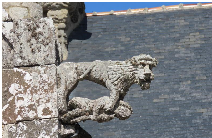
A somewhat chilling detail of the late Gothic church of Saint Goulven

NIGHT : Hotel de la Mer, Brignonan-Plages