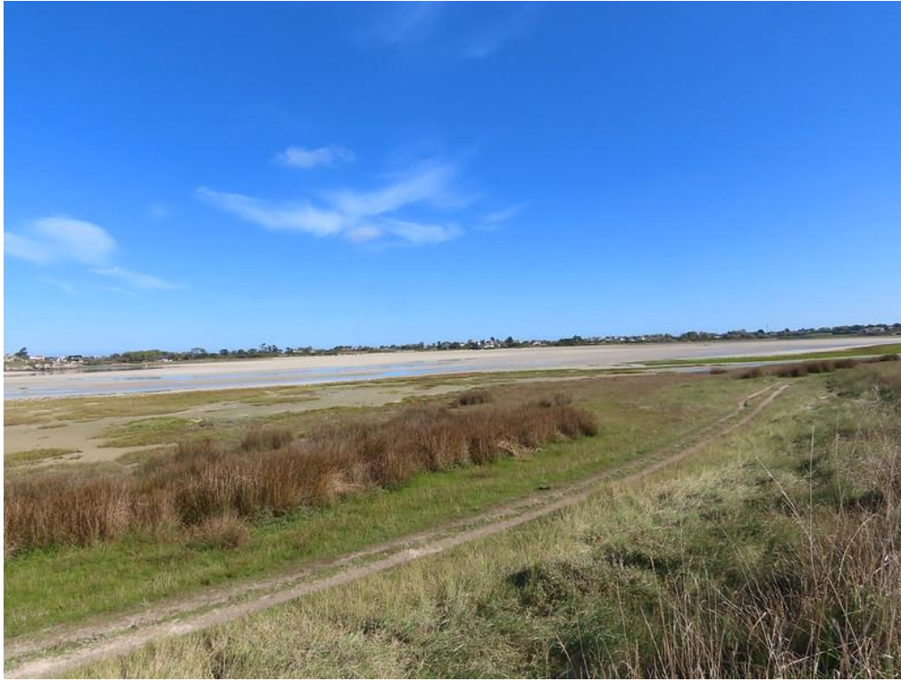
The dike path above the Bay of Goulven.

In the dunes themselves, accessible on a flat, broad rails-to-trails path, migrating flocks of Meadow Pipits and Linnets pause to feed in the sparse grasses. Birders are not alone in enjoying this dune avifauna. Merlins and Peregrine Falcons hunt here in the morning and evening, too. Those dashing raptors have miles to go on their own migrations—but we are just twenty minutes away from our hotel, where we plan on offering our usual seawatching stint before dinner. For those interested in a more physically strenuous activity, on this and some other afternoons, we may offer a longer walk as an alternative to our essentially stationary seawatch.