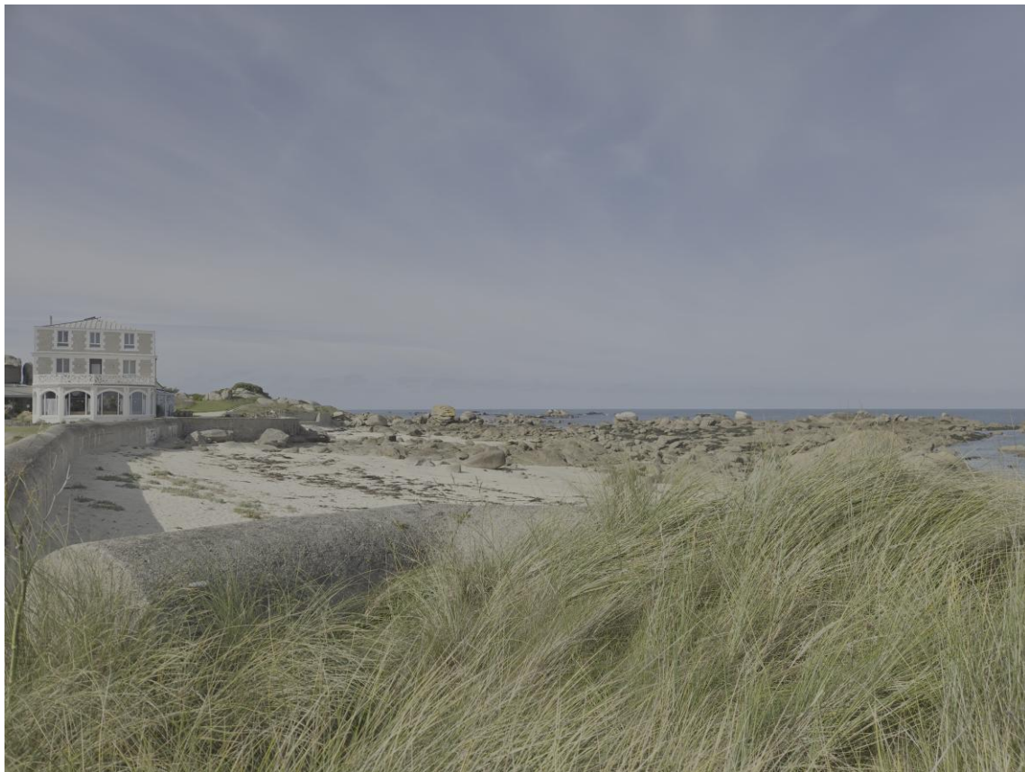
The Hotel de la Mer.