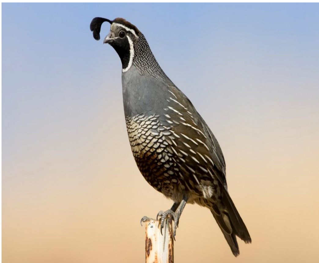
California Quail