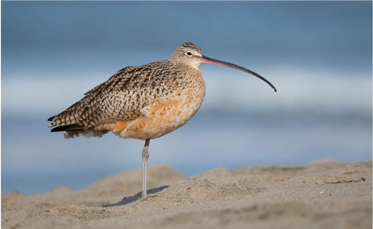
Long-billed Curlew

NIGHT: Oceano Hotel & Spa, Half Moon Bay