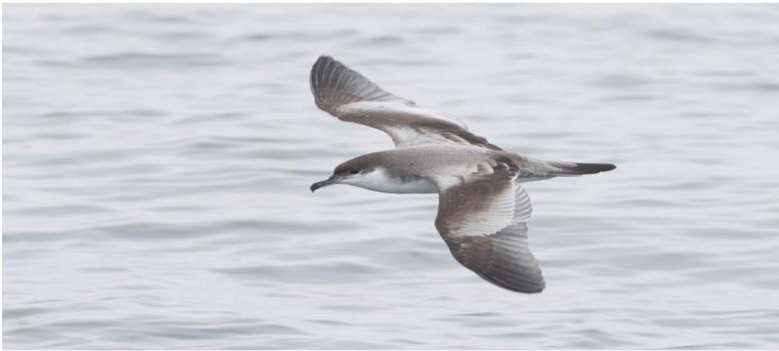
Buller's Shearwater