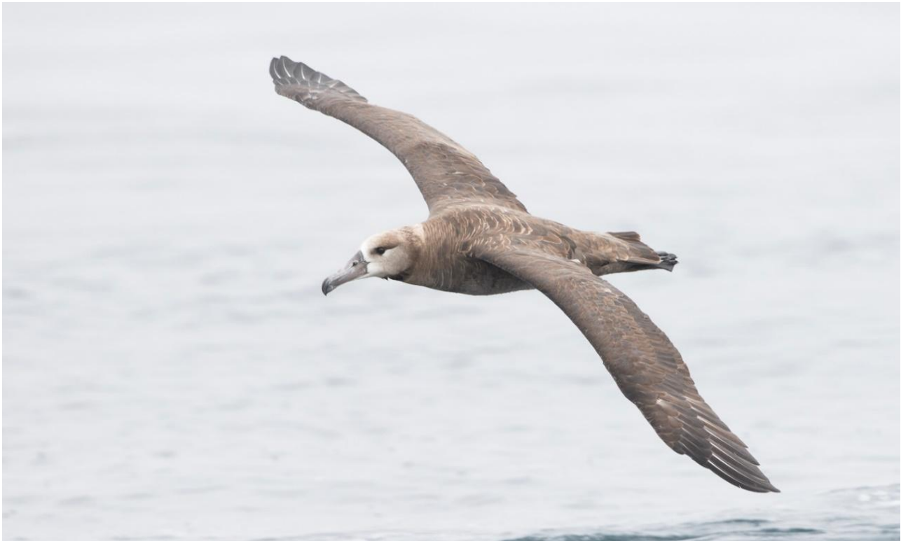
Black-footed Albatross

This weeklong exploration of the central California coast featuring Monterey Bay, offshore waters, tidal marshes, chaparral covered hills, and oak-filled interior valleys promises an amazing array of great California birds. From Buller's Shearwaters and Black-footed Albatross offshore to Yellow-billed Magpie and California Condor inland.