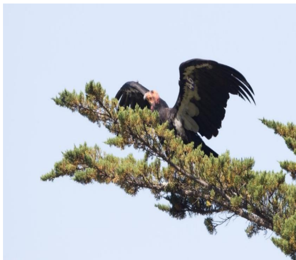
California Condor

Our chances of seeing condors are high, but we may need to check several areas throughout the morning and early afternoon hours before we can claim success. If we are fortunate, we may see