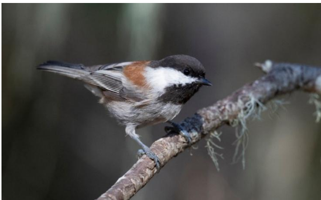
Chestnut-backed Chickadee

This morning we'll head south from Monterey to start our day on the famous Big Sur coast. Our objective is observing the reintroduced California Condor in its coastal refuge, in addition to a suite of other western birds. Our travels will take us to several areas, including stands of towering coast redwoods and other forested habitats where we'll watch for an