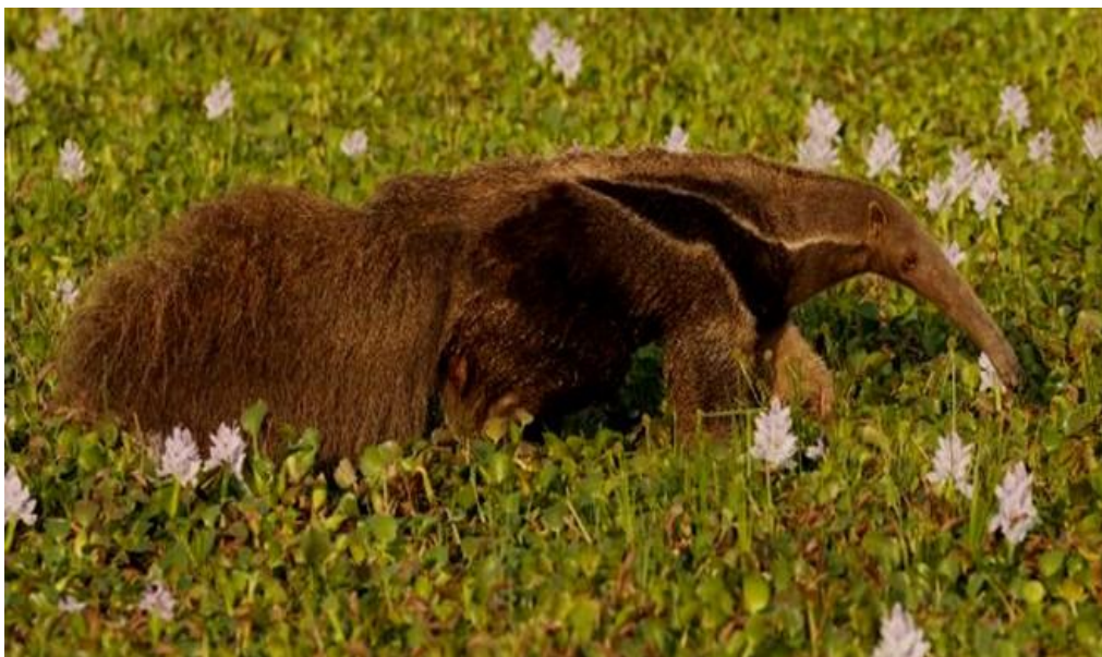
Giant Anteater