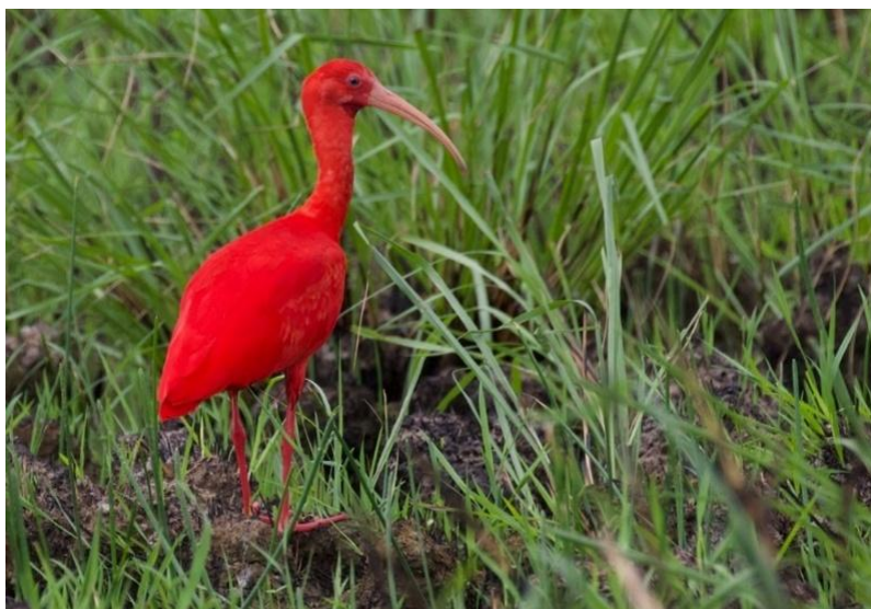
Scarlet Ibis

Located in the far north of the country, Georgetown sits on the coast, where a mosaic of aquatic and forest habitats supports a mix of common and widespread birds and species restricted to the swamp forest and mangrove stands that once blanketed the Atlantic coast of the Guianas. We will sample these habitats. Our day likely begins with a visit to coastal mudflats where the restricted distribution Rufous Crab Hawk occurs. Here, we also may be delighted by brightly-colored Scarlet Ibis, Mangrove Rail, diminutive White-bellied Piculet, and Plain-bellied Emerald, a hummingbird found close to mangrove stands. Next, we will enjoy a boat trip on the tree-lined Mahaica River, where we will look for the bizarre and largely vegetarian Hoatzin. This activity brings the prospect of many birds; among the possibilities are Great Black-Hawk, Snail Kite, Green-tailed Jacamar, Wing-barred Seedeater, Epaulet Oriole, and probably a roost of Boat-billed Heron (a typically crepuscular and nocturnal species). We will also stay vigilant for pairs of the entertaining Black-capped Donacobius, an elegant bird known for its unique display choreography.