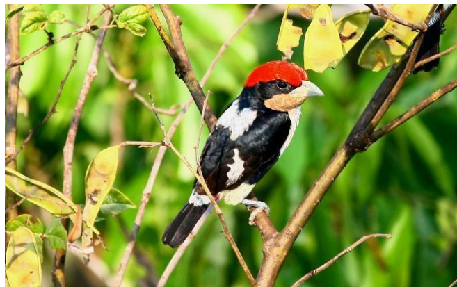
The near-endemic Black-girdled Barbet

Another of the trip's attractions is ascending the lodge's canopy tower, atop of which we'll enjoy views of treetop species at eye-level, and where we can experience the forest awakening or going quiet on morning and afternoon visits. Highlights from previous tours include sightings of the breathtaking Crimson Fruitcrow; Spangled, Pompadour, and Purple-throated cotingas; White-bellied Parrot; Gould's Toucanet; Crested Owl; Amazonian Pygmy-Owl; Paradise Jacamar; White-necked and Pied puffbirds; the newly described Eastern Striolated Puffbird; Orange-cheeked Parrot; Sclater's Antwren; Dusky-capped (Rondonia) Woodcreeper; Tooth-billed Wren; Klages's Gnatcatcher; Yellow-shouldered Grosbeak; a kaleidoscope of tanagers including Paradise, Green-and-gold, Opal-rumped, and Red-billed Pied Tanager; Short-billed Honeycreeper; Yellow-bellied Dacnis; White-winged Shrike Tanager; and many others.