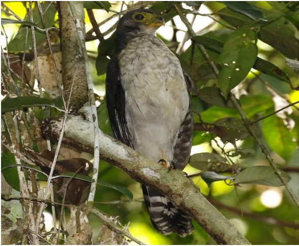
Immature Slaty-backed Forest-Falcon

hearing and seeing the shy Starred Wood-Quail, Cryptic and Slaty-backed forest-falcons, or tiny Zigzag Heron (which is almost common here!). In the mid-morning hours, raptors such as White-browed Hawk and Ornate Hawk-Eagle soar above the forest on rising thermals. Additionally, we hope to encounter a diversity of macaws and parrots including Chestnut-fronted, Red-bellied, Scarlet, Blue-and-Yellow, and Red-and-Green macaws; Yellow-crowned and endemic Kawall's Amazon; near endemic Crimson-bellied and Santarem parakeets; and fruit-eating birds such as Gould's Toucanet; Red-necked Aracari; and Channel-billed Toucan.