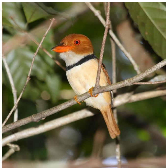
Collared Puffbird, a rarely seen forest dweller

This trip, however, is about more than specialty birds, as we have a chance to see some of the most distinctive and dazzling birds in the American Tropics. Representative are Zigzag and Agami herons; Chestnut-fronted, Scarlet, Blue-and-Yellow, and Red-and-green macaws; the poorly known Kawall's Parrot; the spectacular Crimson-bellied Parakeet; Gould's Toucanet; Red-necked Aracari; Green-and-rufous Kingfisher; Pavonine Quetzal; Blue-cheeked and Paradise jacamars; Black-girdled Barbet; the striking Rufous-necked and Collared puffbirds; Snow-capped and Flame-crested manakins; the endemic Para Foliage-gleaner; Rufous-tailed Xenops; endemic Hoffman's Woodcreeper; Pearly and Bamboo antshrikes; Pale-faced Bare-Eye and White-breasted Antbird; Black-bellied Gnateater (rare); Crimson Fruitcrow; Black-necked Red-Cotinga; Pompadour and Purple-breasted cotingas; and the lovely Rose-breasted Chat.