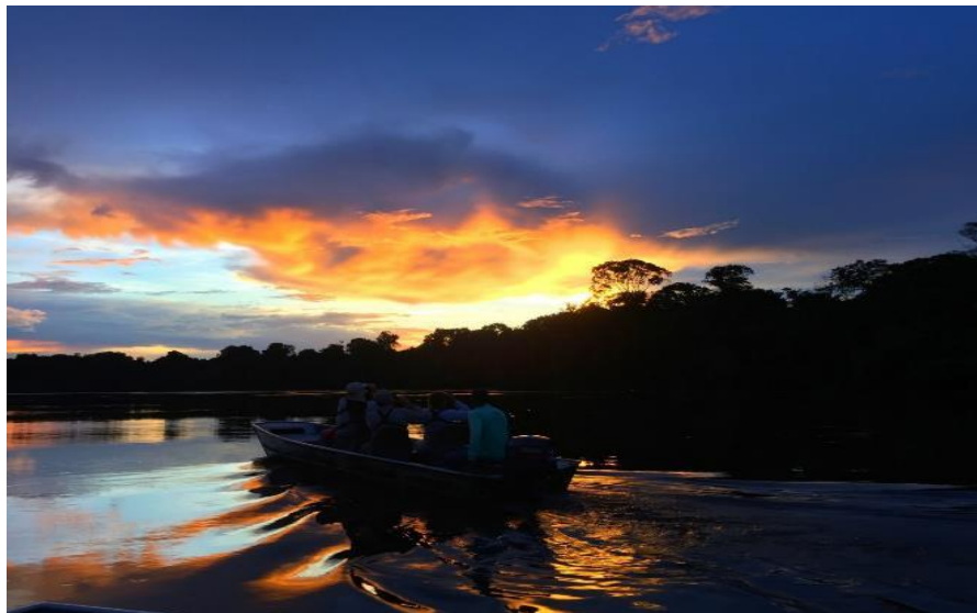
A typically amazing Amazonian sunset!

Imagine yourself on an afternoon boat trip, drifting down the Rio Roosevelt at the end of a great day's birding, sipping an ice-cold refreshing drink as a spectacular Amazonian sunset unfolds in front of you. Meanwhile, a chorus of toucan yelp and croak from the forest, serenading the last flight of macaws and parrots as they thread their way across the river to their evening roosts with the sun waning on the horizon and Sand-colored Nighthawks dancing above the beaches, and a group of primates are going to sleep on the tallest emergent. Capping off yet another magnificent day in this Amazonia paradise. Simply life just doesn't get much better than this!