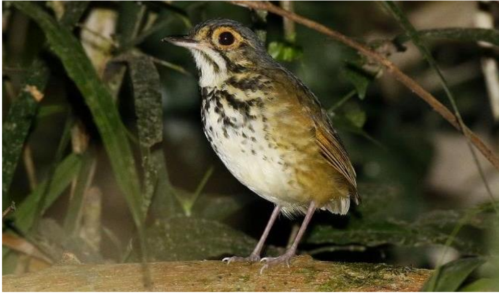
Alta Floresta Antpitta, named after your tour leader and described in 2012

A night excursion will treat us to a spectacular star-filled sky, and may reveal a secretive Zigzag Heron, or a nightbird or two, such as Black-banded or Spectacled owl, Tawny-bellied Screech Owl, or even a Rufous, White-winged or Long-tailed potoo. Drifting along in the boat, we may well hear the lonely calls of the Gray Potoo, known in Portuguese as “Mãe da Lua” (“Mother of the Moon”); the odd calls of an Amazonian Bamboo-Rat; or the owl-like hoots of a Night Monkey troop.