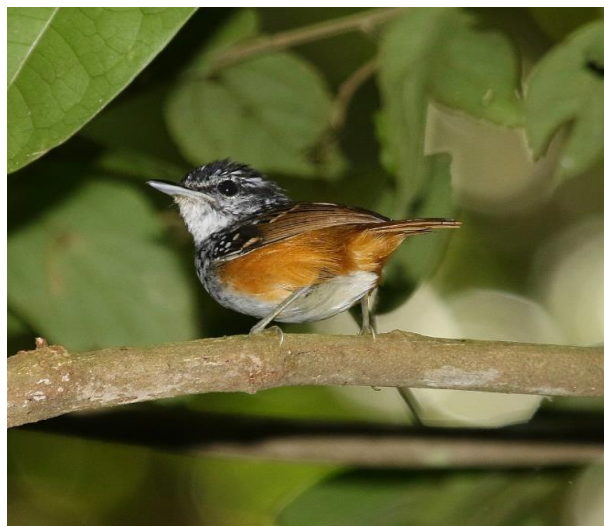
The endemic Manicore Warbling-Antbird (male), described in 2013

VENT is immensely proud to have pioneered the birding here through the process of Andrew opening forest trails way back in 2004, siting the location of the canopy tower, and bringing the fishing lodge its first ever birding groups. The whole effort culminated in 2008 when Andrew, after extensive research, published a preliminary bird list for the lodge of close to 500 species with more species being added every year!