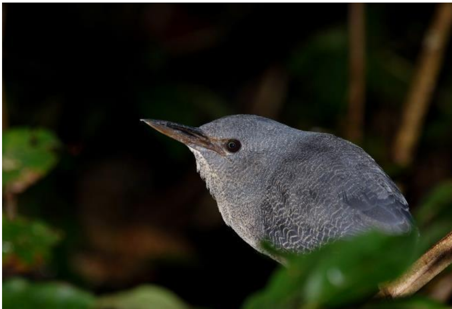
Zigzag Heron, a highly-sought regional specialty

A night excursion will treat us to a spectacular star-filled sky, and may reveal a secretive Zigzag Heron, or a nightbird or two, such as Black-banded or Spectacled owl, Tawny-bellied Screech Owl, or even a Rufous, White-winged or Long-tailed potoo. Drifting along in the boat, we may well hear the lonely calls of the Gray Potoo, known in Portuguese as “Mãe da Lua” (“Mother of the Moon”); the odd calls of an Amazonian Bamboo-Rat; or the owl-like hoots of a Night Monkey troop.