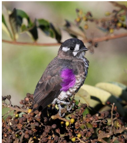
White-browed Purpletuft

This fascinating area requires early starts for the best birding to allow us to get into the prime birding areas. Vast grasslands are home to several target species including the spectacular but skulky and beautiful Ocellated Crake which is rather common here, therefore we will have enough to pairs to play with! Other targets should include; Ash-throated, and Russet-crowned crakes, Spot-tailed Nightjar, Long-tailed Ground-Dove, White-eared Puffbird, Green-tailed Goldenthrout, Southern White-fringed and Rusty-backed antwren, Sharp-tailed Tyrant, White-browed Purpletuft, White-throated Kingbird, Cinereous-breasted Spinetail, Black-masked Finch, White-rumped Tanager, Plumbeous Seedeater as well as an odd breeding population of Dark-throated Seedeater!