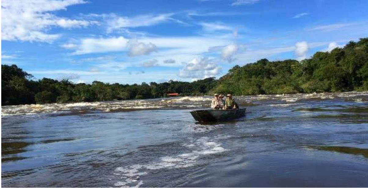
A relaxed afternoon boat trip below Santa Rita Falls, with the lodge in the background