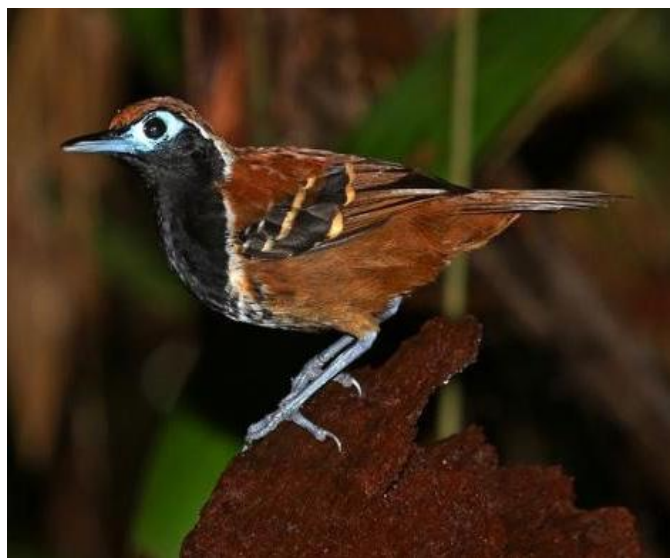
The lovely, terrestrial Ferruginous-backed Antbird (male)

Exploration of these rainforests will produce an astonishing number of bird and mammal possibilities including Gray, Brazilian, Brown, and Variegated tinamous; the bizarre Razor-billed Curassow; flocks of Dark-winged Trumpeter; or Sunbittern and Sungrebe along the streams. The forested riverbanks hold flocks of prehistoric looking Hoatzin, while a flash of color could prove to be a Green-and-rufous or tiny Pygmy kingfisher. Dawn and dusk are the optimum times for