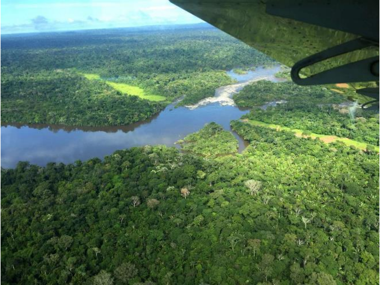
On approach to the wilderness haven of Pousada Rio Roosevelt, our home for the week

Amazonia is a vast, mystical region representing the greatest treasure trove of biodiversity and tropical rainforests on the planet, with the majority of this immensely rich biome 60 percent located in Brazil! From the time such great legendary explorers as Henry Walter Bates and Alfred Russel Wallace entered the region in the 1840s, Amazonia has captivated naturalists and explorers alike, and continues to enthrall visitors today. Few other locations have the power to entice return visits as does Amazonia, in part because no two locations in this immense ecosystem (an incredible 2.1 million miles 2 ) are alike! Simply put, after crossing any major Amazon river system each bank is home to an exciting different array of uniquely exotic, often endemic birds,