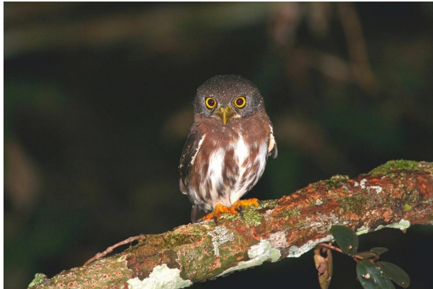
Amazonian Pygmy-Owl

Thankfully while searching for this highly roaming jay there will be several other exciting forest species to keep us happy; Bonaparte's Parakeet, Amazonian Pygmy-Owl, Golden-collared Toucanet, Guided Barbet, Curl-crested and Ivory-billed aracaris, Brown-banded and Western Striolated puffbird, Pale-tailed Barbthroat, Needle-billed Hermit, Banded Antbird, Rio Madeira Stipplethroat, Ocellated Woodcreeper, Cinnamon-rumped Foliage-gleaner, Point-tailed Palmcreeper, Citron-bellied Attila, Fiery-capped and Blue-crowned manakin and if luck is on our side maybe such rarities as Undulated Antshrike, Black Bushbird, Band-bellied Woodcreeper, Fulvous-chinned Nunlet or even Dotted Tanager.