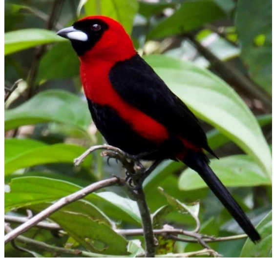
Masked Crimson Tanager

The airy, breezy ship and air-conditioned cabins mitigate the effects of even the hottest days, and visitors soon discover that insects and mosquitoes, far from being the torment they are imagined, are restricted or no problem