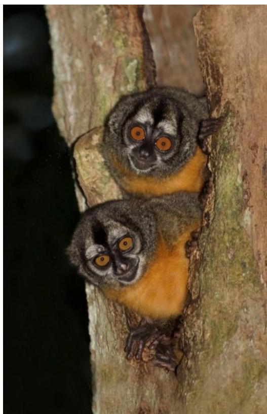
Night Monkeys

tailed Swift; Glittering-throated Emerald; Scarlet-crowned and Lemon-throated barbets; Spotted Puffbird; Cream-colored Woodpecker; Dark-breasted Spinetail; Long-billed Woodcreeper; Great and Black-crested antshrikes; Amazonian Streaked-Antwren; Plumbeous, Band-tailed, and Silvered antbirds; Black-spotted Bare-eye; Plum-throated Cotinga; Varzea Schiffornis; Yellow-crowned Tyrannulet; Forest Elaenia; Social Flycatcher; and Velvet-fronted Grackle.