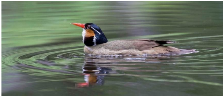
Sungrebe (singing)

If we were able to anchor near Zapote Creek overnight, we'll likely be out along this stream early this morning, or on another similar tributary of the Ucayali where we will continue to explore the area from small boats. Because the upper part of this river is a particularly wild area, we'll get an early start. This is a good region for raptors as well as parrots and parakeets, and we may see pairs or families of Blue-and-yellow Macaws, and even Scarlet Macaws along the river. In the upper portions of Zapote Creek, we have had good success with raptors, and have, on past tours, recorded both Harpy Eagle and Crested Eagle here, as well Gray-headed Kite, Hook-billed Kite, Slender-billed Kite, Buckley's Forest-Falcon (very rare) and more common species such as Black-collared Hawk and Slate-colored Hawk. A sample of other birds here might include almost any of the species mentioned on days 3 and 4, as well as Capped Heron, Rufescent Tiger-Heron, Green Ibis, Great Black-Hawk, Speckled Chachalaca, Sungrebe, Sunbittern (scarce), Chestnut-fronted Macaw, Black-throated Mango, up to five species of kingfishers, Forest and Yellow-crowned elaenias, Cinnamon and White-eyed (Dull-capped) attilas, Lesser Kiskadee, and Gray-capped Flycatcher. This is also an excellent area for primates and among the possibilities are Red Howler Monkey, Night Monkey, Squirrel Monkey, Saddle-backed Tamarin, Dusky Titi-Monkey, Brown capuchin, and perhaps even the unusual Monk Saki (scarce and retiring).