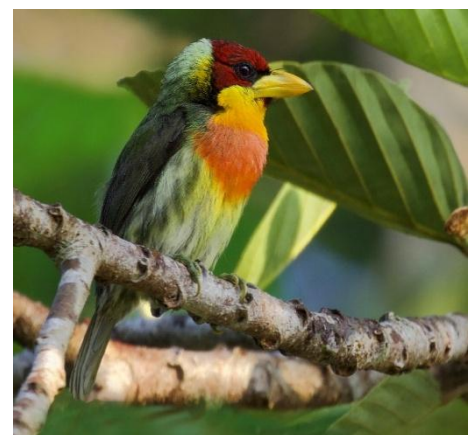
Lemon-throated Barbet

During these two days, we will explore small streams, rivers, riverbanks and maybe even a river island or two as we gradually make our way up the Río Ucayali. Along relatively narrow and heavily forested streams, we should continue to see species typical of várzea and igapó forest, although the taller forest and narrower channels of some creeks here should give us opportunities to add many new species each day. A sampling could include almost any of the species mentioned previously, as well as Horned Screamer; Black Caracara; Hoatzin; Muscovy