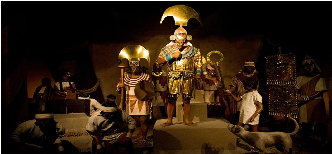
Royal Tombs of the Lord of Sipan

Neotropical Cormorants, Band-tailed, Gray-hooded and Kelp Gulls and Peruvian Terns. We should be at the hotel for lunch and respective check-in.