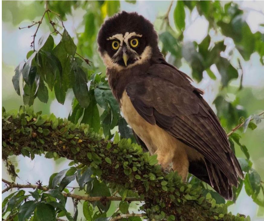
Spectacled Owl

white Antbird; Brownish Elaenia; River Tyrannulet; Lesser Wagtail-Tyrant; Riverside Tyrant; and Pearly-breasted Conebill. Other species we could see on or in the vicinity of river islands include Lesser Yellow-headed Vulture; Wattled Jacana; Greater and Smooth-billed anis; Ringed and Amazon