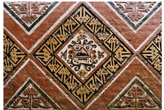
Temple of the Sun and Moon

In the afternoon we'll explore the Temples of the Sun and the Moon. These pyramid-like structures were constructed by the sophisticated Moche people who ruled the northern coast between A.D 100 and 800. Their walls are plastered with distinctive murals depicting the Moche creator God Ai Apaec, the temple is thought to have been used for religious and ritual ceremonies. At the end of this exciting day, we will enjoy a delicious dinner at the hotel restaurant.