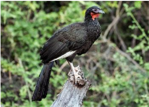
White-winged Guan

This morning after a well-deserved sleep, enjoy a cup of coffee while we indulge our eyes at a small hummingbird pool-party by a running creek just below the outdoor dining room, a great way to start the day! The number of species vary seasonally and based on weather conditions, with less species on overcast mornings. This oasis is visited frequently by Amazilia and Tumbes hummingbirds. Purple-collared Woodstars, Long-billed Starthroat, Peruvian