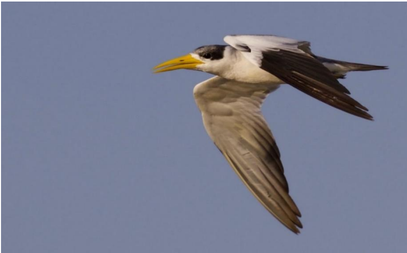
Large-billed Tern

Embarkation. Our flight to Iquitos is currently scheduled for a morning departure from Lima and our activities once we reach Iquitos will depend, in large part, upon the amount of time we have available. If our flight is early there may be some time available for birding along the promenade and/or a short drive through the food market area of