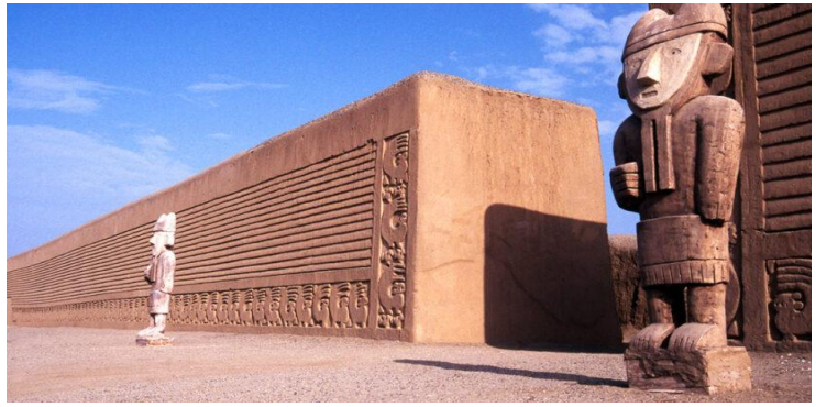
Chan Chan, largest mud city in the world

We'll enjoy a full day exploration of the charming city of Trujillo and its nearby archaeological wonders beginning with a short walking tour of its historical center visiting the Main Plaza, its Cathedral, and the neoclassical and baroque style mansion homes such as the Urquiaga and Bracamonte. Chan-Chan, the biggest pre-Hispanic urban center built entirely with mud bricks is located only three miles northeast of the city and was declared a World Heritage Site by UNESCO back in 1986. This amazing complex features plazas, workshops, streets, walls and pyramidal temples. Its enormous walls are profusely decorated with reliefs of geometric figures, zoomorphic stylizations and mythological creatures.