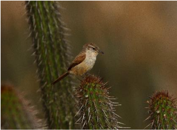
Cactus Canastero

On our last morning, we will visit a nearby and newly created private reserve known as Lomas Cerro de Campana (45 mins drive from Trujillo). The main objective of this reserve is to protect the delicate coastal hills and lomas ecosystems with its unique flora and fauna. The vegetation develops on the slopes facing the sea, favoring the condensations of mists brought by winds from the south and southwest. These slopes can start at sea level and