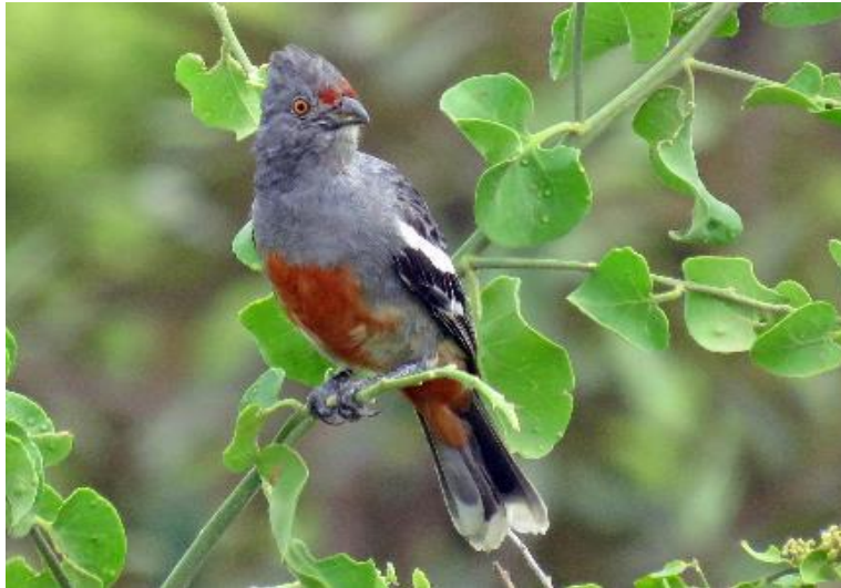
Peruvian Plantcutter

The archaeological wonders of northern Perú offer a unique opportunity to look into Peru's earliest complex societies. Traveling the territory of the former Moche and Chimu kingdoms will truly be an epic adventure. Stretching from modern day Chiclayo to Trujillo, the Pacific-hugging landscape where the cold nutrient rich waters of the northern end of the Humboldt Current mixes with the warmer waters flowing south creating a wealth of marine life, the perfect setting for the flourishing of these cultures.