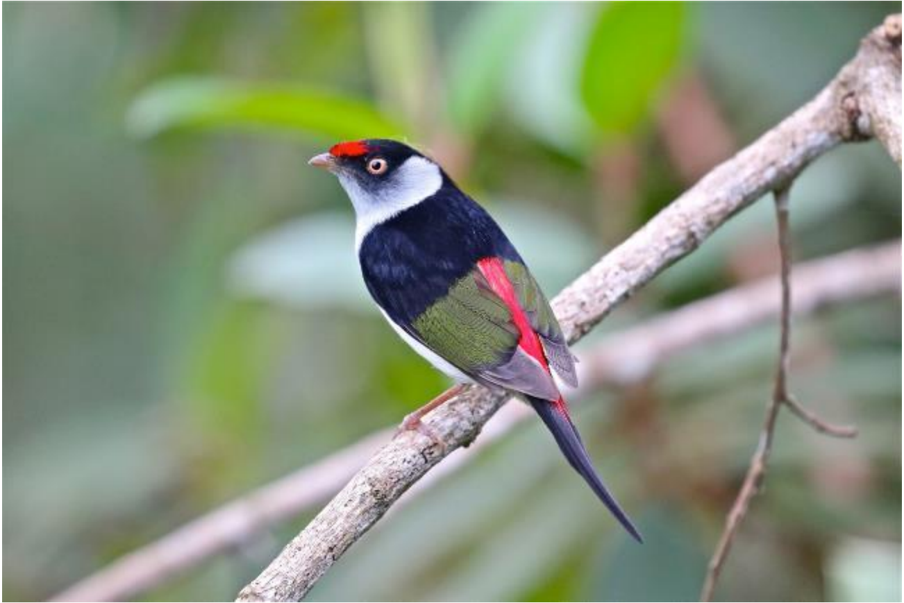
Pin-tailed Manakin (male), one of more than 150 Atlantic Forest endemic birds possible on this tour Photographed at Itatiaia National Park

South America's largest country is also one of its richest for birds. Nowhere is this more apparent than in southeastern Brazil, where habitats range from coastal rain forest and wet pampas to montane cloud forest and plateau grassland. Long isolated from Amazonia by the dry brushlands of central Brazil (left in the wake of receding glaciers during the last ice age), the avifauna of southeast Brazil has radiated in a myriad of directions. Today there are more than 170 species of regional endemics that are confined to the Atlantic Forest and found nowhere else in the world. This truly is a must destination for birders.