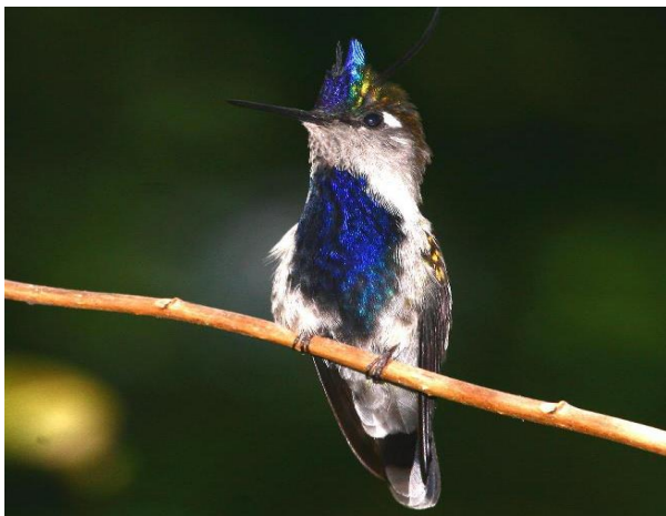
The dazzling Purple-crowned Plovercrest is best found at leks, where multiple males appear daily to display for the purpose of attracting females. There are a couple of well-known leks of this species in Intervales

Although our exact schedule will remain somewhat flexible for these two days, one morning will be devoted to exploring the rich forests of Fazenda Angelim and possibly the adjacent Fazenda Capricornio. These are excellent spots for seeing the endemic Buff-throated Purpletuft, the tiniest member of the genus Iodopleura , a group formerly placed with the cotingas, but now considered to be of uncertain taxonomic affinities. Other possibilities here include Mantled and White-necked hawks, Spot-billed Toucanet, Buff-bellied and Crescent-chested puffbirds, Pale-browed Treehunter