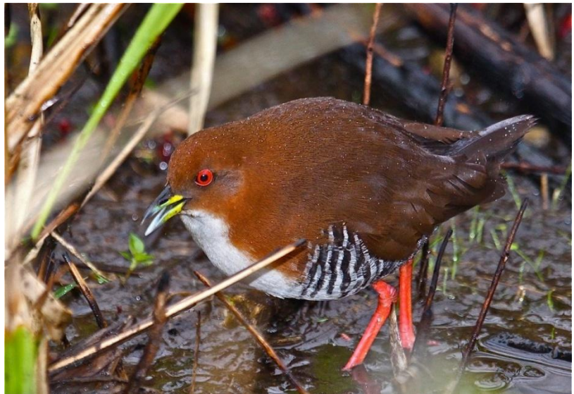
Red-and-white Crake, a lovely “phantom of the marsh” that we often connect with at one of our stops during the tour

Today will be devoted mostly to travel with a fairly early start, as we have a long drive from Intervales to Ubatuba, via São Paulo. We’ll break up the drive