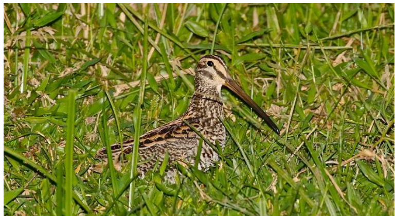
Giant Snipe is not an Atlantic Forest endemic, but this striking, crepuscular snipe is uncommon and patchily distributed throughout its range, and is rarely seen anywhere. We've enjoyed excellent luck with this iconic bird during each of our recent visits to the Itatiaia region.

Even the grounds of our charming hotel are exceptionally productive for birds and nearby hummingbird feeders can produce a nearly non-stop show. Photographers will enjoy the opportunity to train their cameras at leisure on such jewels as Frilled Coquette, Black Jacobin, Violet-capped Woodnymph, and Brazilian Ruby.