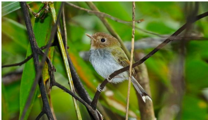
Fork-tailed Pygmy-Tyrant is an uncommon and patchily distributed endemic that we often see in the Ubatuba area. This distinctive little flycatcher is strongly associated with thickets of native bamboo.