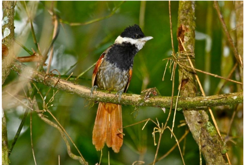
White-bearded Antshrike (male), a rare bamboo-specialist, and one that we have not failed to see on our Southeastern Brazil tours since 1993