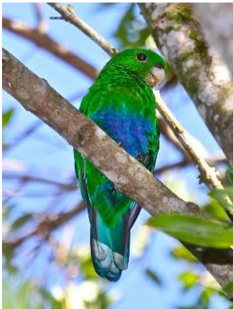
Intervalles State Park is one of the best places to see the unique (it has its own genus!), endemic, Blue-bellied Parrot, although we are only rarely lucky enough to get such great views of a perched male as this.

Special attention will be devoted to searching for the Helmeted Woodpecker, one of the rarest and most localized of all Atlantic Forest endemics, but one which seems to be more often found at Intervalles than elsewhere, and one which we've seen on more than 50% of our visits. We will plan to visit leks of two endemic hummingbirds, the Dusky-throated Hermit and the Purple-crowned Plovercrest. Intervalles is a particularly good spot for several of the more localized Atlantic Forest endemics, among them, Spot-winged Wood-Quail, White-bearded Antshrike, Squamate Antbird, Slaty Bristlefront (southern vocal type, soon to be described as a new species), Spotted Bamboowren, Atlantic Royal Flycatcher, Oustalet's Tyrannulet, Bay-ringed Tyrannulet, Red-ruffed Fruitcrow, and Half-collared Sparrow. Likewise, the spectacular Swallow-tailed Cotinga and poorly known Black-legged Dacnis are perhaps better found here than anywhere else in their ranges and both species often nest