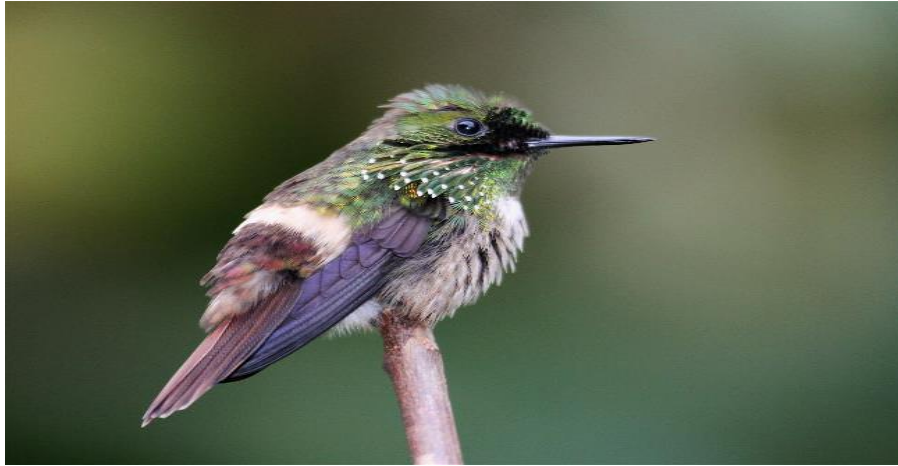
Festive Coquette (nominate subspecies) is probably more readily seen at Sítio Folha Seca than at any other location in the world. © Kevin J. Zimmer