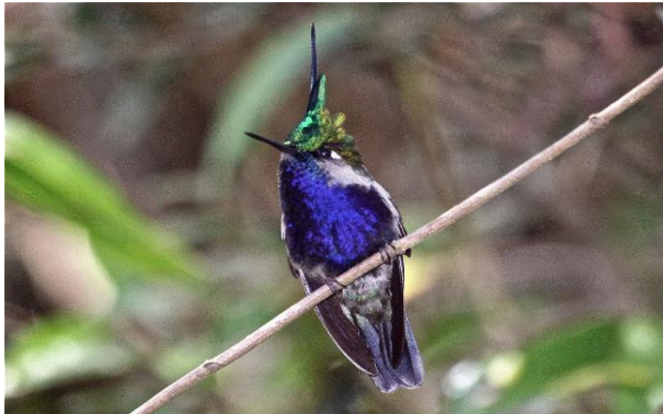
The Green-crowned Plovercrest, another denizen of the Agulhas Negras highlands, is arguably even more spectacular than its sibling species, the Purple-crowned Plovercrest.

tyrants); Fork-tailed Pygmy-Tyrant; Shear-tailed Gray-Tyrant; Rufous-tailed Attila; Serra do Mar Bristle-Tyrant; Olivaceous Elaenia; Tanager; Thick-billed Saltator; Bay-chested and Buff-throated warbling finches; and many more.