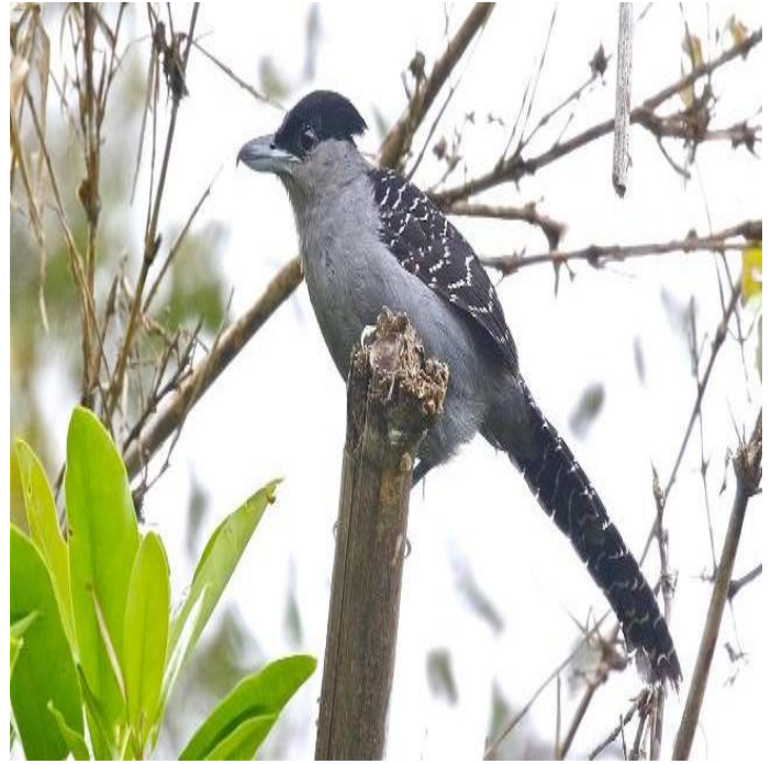
The aptly named Giant Antshrike is nearly as large as a Squirrel Cuckoo. It could turn up at either Intervalles or Itatiaia, and is an instant trip highlight when it does!