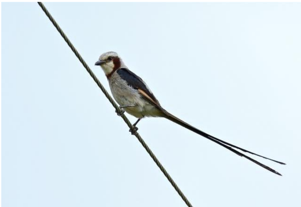
Streamer-tailed Tyrant is another spectacular bird to be found in the marshes and open country in the Itatiaia region. The displays of duetting pairs or family groups of these birds are simultaneously comical and impressive.