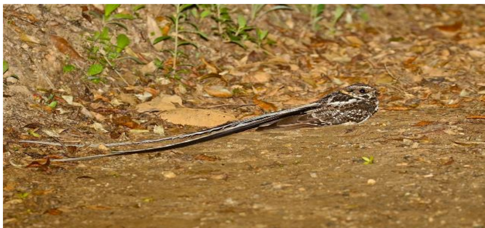
The spectacular and endemic Long-trained Nightjar is one of the primary targets of our planned night birding excursion at Intervales State Park.