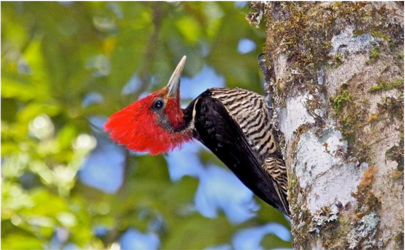
The Helmeted Woodpecker (male pictured here) is one of the rarest and most difficult to find of all the Atlantic Forest endemics. It was only recently moved to the genus Celeus, after previously having been incorrectly placed in the genus Dryocopus. Its strong plumage similarities to the sympatric and much larger Robust and Lineated woodpeckers are thought to represent an example of Interspecific Social Dominance Mimicry (ISDM), an evolutionary adaption to avoid aggression from similar looking, but larger and more dominant species.