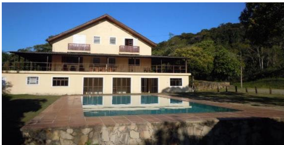
Intervales State Park's Pica-Pau House