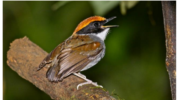
Several sites in the Ubatuba region are particularly good places to see the handsome Black-cheeked Gnatcatcher, the male of which, is pictured here

birders. We'll be quartered in roomy, private chalets, each with its own balcony and fireplace. The balcony outside of the dining room is lined with hummingbird feeders that attract a number of hummingbirds and some tanagers. We may fall asleep to the eerie calls of Tawny-browed Owls, and awaken to the pre-dawn wing-rattling of Dusky-legged Guans! This is truly a magical spot.