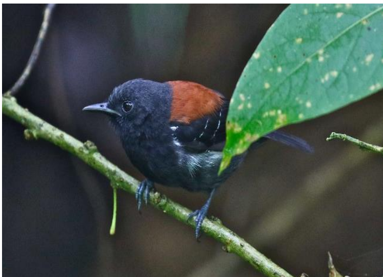
The Black-hooded Antwren, lost to science for over 100 years, was rediscovered in 1987, and now is a regularly seen attraction of our visits to Perequê.

Most of the rest of our day will be spent driving to Itatiaia (about four to five hours). Upon arrival at the park, we will wind our way up to near the top of the main park road. Our lovely hotel, to which we have been bringing groups since the 1980s, is family-owned and operated. Situated at about 3,500 ft. and surrounded by forest, with an expansive view of both the upper and lower slopes, it is an idyllic base for