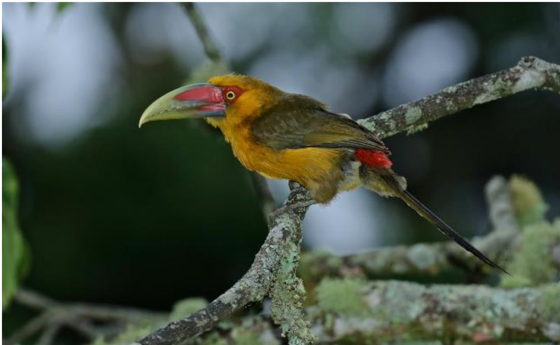
Saffron Toucanets are also regular visitors around the lodge at Itatiaia National Park.