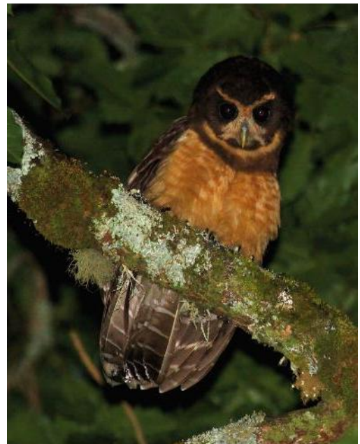
This magnificent Tawny-browed Owl was photographed from the parking lot at our lodge in Itatiaia National Park.

Other possibilities include Tawny-browed Owl; Rufous-capped Motmot; Saffron Toucanet; White-browed Woodpecker; Buff-fronted, White-browed, and Buff-browed foliage-gleaners; Rufous-breasted Leaf-tosser; Large-tailed, Tufted, White-bearded and Giant antshrikes; Spot-breasted and Rufous-backed antvireos; Star-throated Antwren; Rufous-tailed, Ferruginous, Bertoni's and Ochre-rumped antbirds; White-shouldered Fire-eye; Rufous-tailed and Such's (Cryptic) antthrushes; Speckle-breasted Antpitta; Rufous Gnateater; Slaty Bristlefront (northern vocal type); Mouse-colored Tapaculo; Pin-tailed Manakin; Black-capped Piprites; Drab-breasted and Brown-breasted pygmy-tyrants (bamboo-