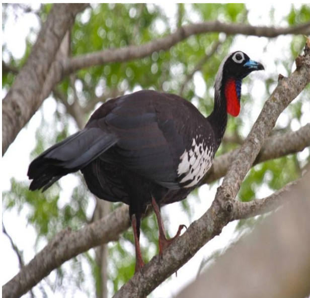
The endangered Black-fronted Piping-Guan is one of the most sought-after of the many regional endemics to be found at Intervales State Park.

Mornings will find us working a variety of jeep tracks through lush, foothill Atlantic Forest. These tracks are ideal for groups—wide enough to comfortably accommodate everyone, yet narrow enough to be part of the surrounding forest. Constantly moving mixed-species flocks of colorful tanagers (including Brassy-breasted, Chestnut-backed, Red-necked, Green-headed, Diademed and Azure-shouldered) and challenging woodcreepers, foliage-gleaners and tyrannulets will compete for our attention with the myriad of understory species, many of which will require special efforts to see. We will be especially alert to the presence of fruiting trees, which could