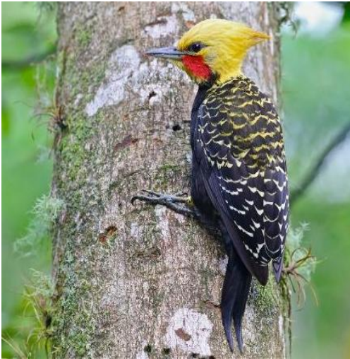
Few woodpeckers are fancier in appearance than the aptly named Blond-crested Woodpecker, a species that we usually see at Intervalles, Ubatuba, and Pereque

Established in 1937, Itatiaia was Brazil's first national park. It protects more than 65,000 acres of montane Atlantic Forest in the Serra da Mantiqueira range, which straddles the border between the neighboring states of Rio de Janeiro and Minas Gerais. Four full days and part of a fifth morning here will give us a nice introduction to its avian riches and allow us to savor the park's scenic beauty and pleasant climate. A combination of roads and trails will enable us to cover various elevational levels of the park, each with its own special birds. On one day we'll ascend to the high paramo-like grasslands at over 7,000 ft. in search of the Green-crowned Plovercrest (a spectacular little hummer with a "punk-rocker" crest), Velvety Black-Tyrant,