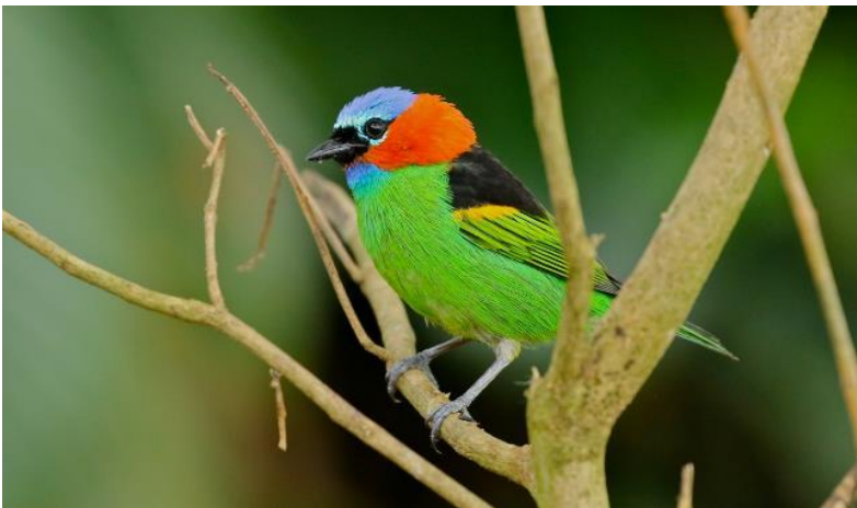
Red-necked Tanager is, arguably, the most striking of the many colorful frugivores that attend the feeders at Sítio Folha Seca

We'll probably spend most of this morning birding the Ubatuba area, likely concentrating our efforts along the Folha Seca Road. The sandy soil here supports a somewhat stunted forest with a slightly different mix of birds from that found on the slopes of the nearby Serra do Mar. Among the possibilities are Orange-eyed Thornbird, Tawny-throated and Rufous-breasted