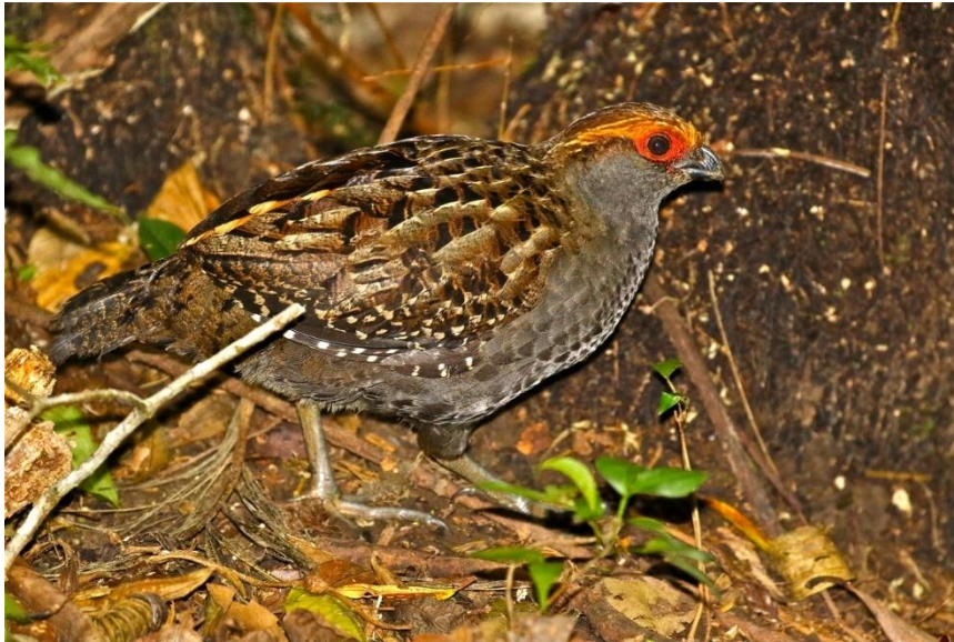
Spot-winged Wood-Quail is one of many elusive forest birds at Intervalas that will require a focused effort to see.

(subspecies C. l. holti , a likely split from more northern nominate leucophrus ), Squamate Antbird, Salvadori's Antwren, Black-cheeked Gnatcatcher, Fork-tailed Pygmy-Tyrant and Black-legged Dacnis.