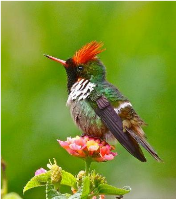
Frilled Coquettes are frequent visitors to flowering Lantana and the feeders at our lovely lodge in Itatiaia National Park.