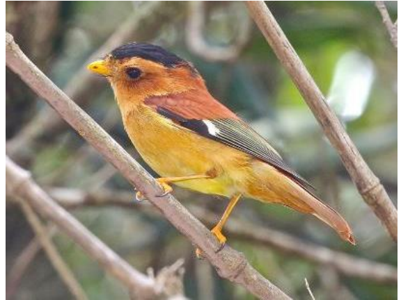
Black-capped Piprite is one of several specialties that we'll search for in the Agulhas Negras high country.

After some final early-morning birding at Itatiaia, we will enjoy lunch en route to Sao Paulo's Guarulhos International Airport (airport code GRU) and arrive in plenty of time for evening international flights. Participants can choose from a variety of overnight flights to the U.S., which will arrive on the morning of November 6, in time for homeward connections.