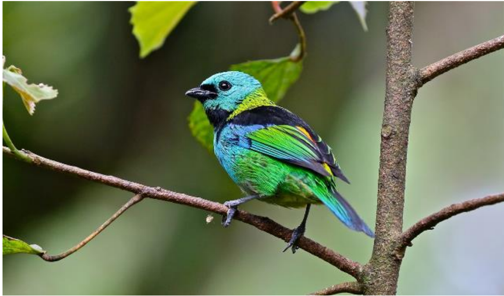
The multi-colored Green-headed Tanager is one of the most common visitors to the feeders along our route