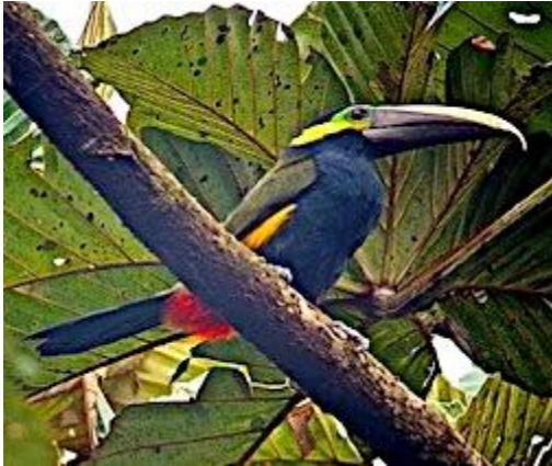
Yellow-eared Toucanet