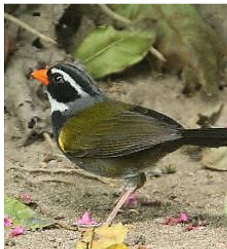
Flame-rumped Tanager Sara Longwing Orange-billed Sparrow