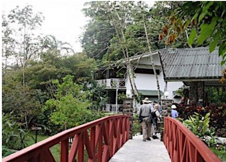
Arriving at Canopy Lodge in El Valle de Antón

The fabulous Canopy Lodge is situated approximately 60 miles west of Panama City in the picturesque El Valle de Antón, known as El Valle for short, a pleasant and quiet community of country homes. Nestled in the crater of an extinct volcano and surrounded by jagged ridges and hills, El Valle is considered a “secret getaway” for many Panamanians. The three forested peaks of Cerro Gaital National Monument loom over the valley and impart a deep sense of tranquility.