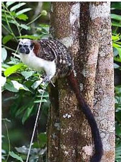
Geoffroy's Tamarin