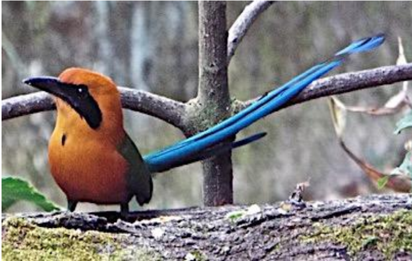
Rufous Motmot

sequence in which we cover the various spots, will remain flexible, and, in part, be determined by conditions on the ground, including weather and current birding conditions.