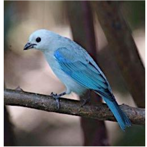
Blue-gray Tanager

After a delicious lunch we will take time for a siesta or watching the feeders from chairs on the porch. From El Valle, a country road leads a short distance up through scattered farms and forest to the back side of three tall peaks to a flat area known locally as “La Mesa,” where we will spend the afternoon. At 2,800 feet, this area sits below the crest of the Continental Divide. For much of the year, it is brushed by clouds passing over from the Caribbean slope. The frequent misting creates a super moist environment, where the remaining forests are fantastically sculpted and laden with epiphytes that shade the dense understory.