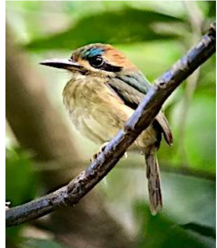
Tody Motmot