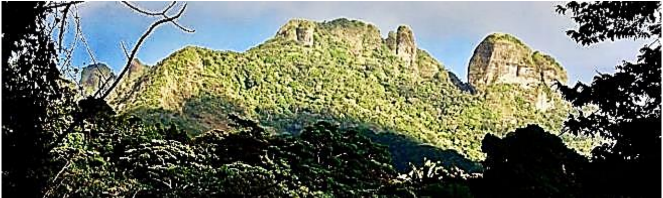
One of the volcanic ridgelines of Altos del Maria

have more time to explore areas in which the original vegetation still supports native highland species. Strategic stops will expose us to several impressive stretches of forest.