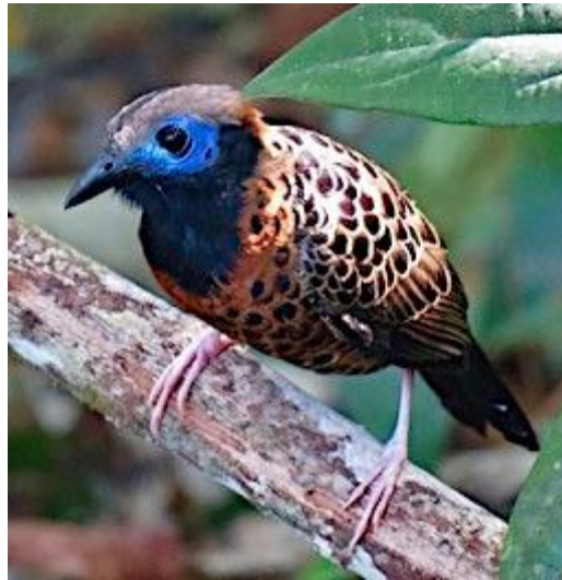
Ocellated Antbird © Cliff Hawley