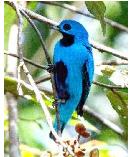
Blue Cotinga

By mid-morning we'll tear ourselves away from the Tower and begin working our way down the one-mile entrance road. As we descend Semaphore Hill, a host of new birds will greet us. Broad-billed and Rufous motmots, various trogons, Chestnut-backed Antbird, and Velvety and Red-capped manakins are among the many possibilities. Army ant swarms are sometimes encountered along this road as well, with a variety of attendant antbirds and woodcreepers possible.