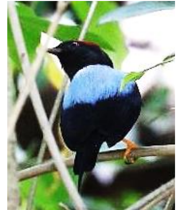
Lance-tailed Manakin