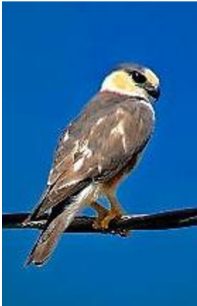
Pearl Kite

ago produced the only American Oystercatcher for this tour. Small ponds might have ducks and Southern Lapwings.