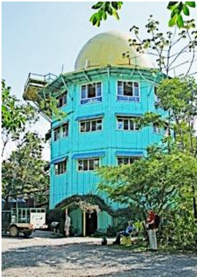
Canopy Tower © Bill Fraser