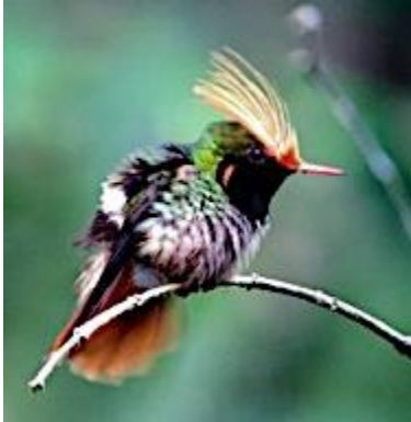
Rufous-crested Coquette © Carlos Bethancourt