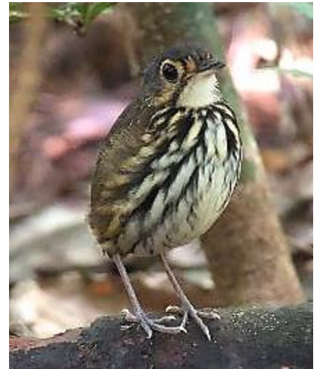
Streak-chested Antpitta

Some of the other birds we may encounter in the Pipeline Road area are Black Hawk-Eagle, Blue-headed and Mealy parrots, Slaty-tailed and Black-throated trogons, Rufous Motmot, Great Jacamar, Cinnamon Woodpecker, Scaly-throated Leaf-tosser, Fasciated and Black-crowned antshrikes, Spot-crowned Antwren, Streak-chested Antpitta (secretive), Brownish Twistwing, and Chestnut-headed Oropendola.