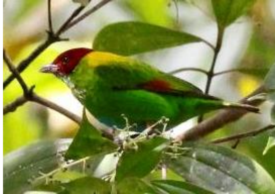
Rufous-winged Tanager