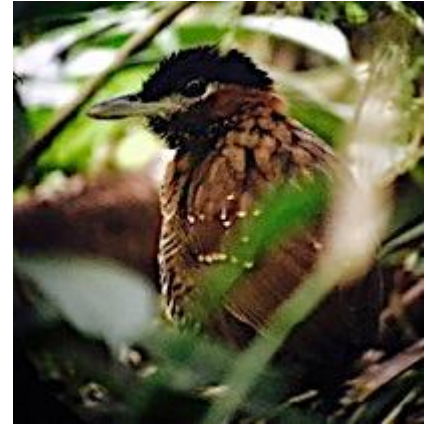
Black-crowned Antpitta