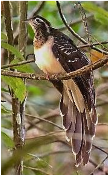
Pheasant Cuckoo

Birds are abundant in this patchwork of habitats. We will make our way through the bustling little town en route to the Canopy Lodge, our home for the next four nights.