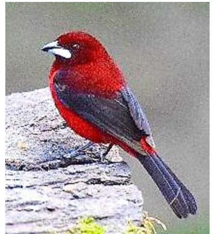
Crimson-backed Tanager