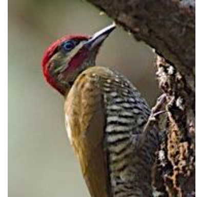
Stripe-cheeked Woodpecker