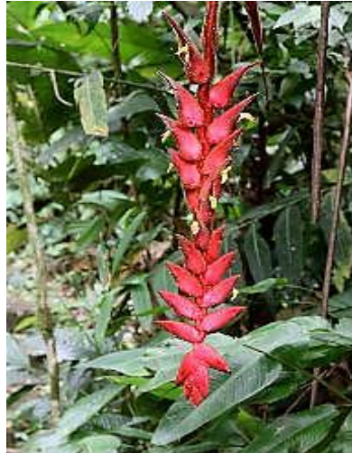
Heliconia rostrata