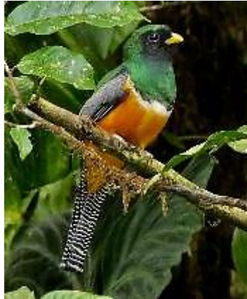
Collared Trogon