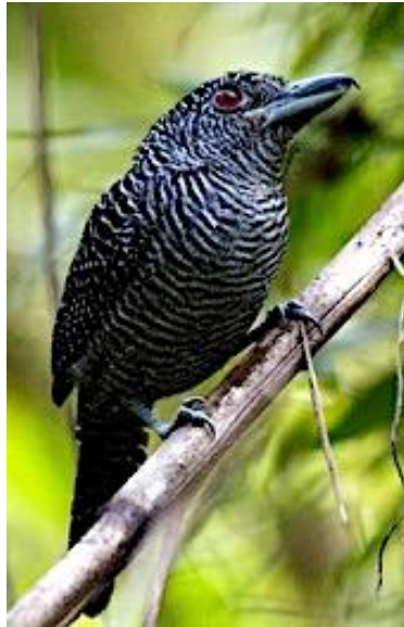
Fasciated Antshrike