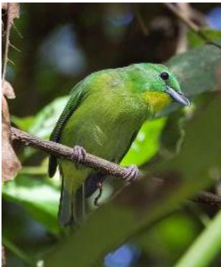
Green Shrike-Vireo

gorgeous Green Honeycreepers. We'll also keep a sharp eye out for two of the true prizes of the treetops, the spectacular Blue Cotinga (increasingly scarce) and the brilliant, but difficult to see, Green Shrike-Vireo. We've had good luck seeing Blue Cotinga here (about half of our trips), often at close range. Green Shrike-Vireo, whose monotonous titmouse-like song sounds like "can't-see-me" and can be heard in many areas of the tropics, can perhaps be viewed best here at the Canopy Tower or the tower at the nearby Discovery Center. It can be hard to leave the show outside to go inside for breakfast. Fortunately, the dining room has panoramic windows that will allow us to keep an eye out even while eating, and during breakfast we often see Geoffroy's Tamarins visiting the bananas set up in the tree next to our table!