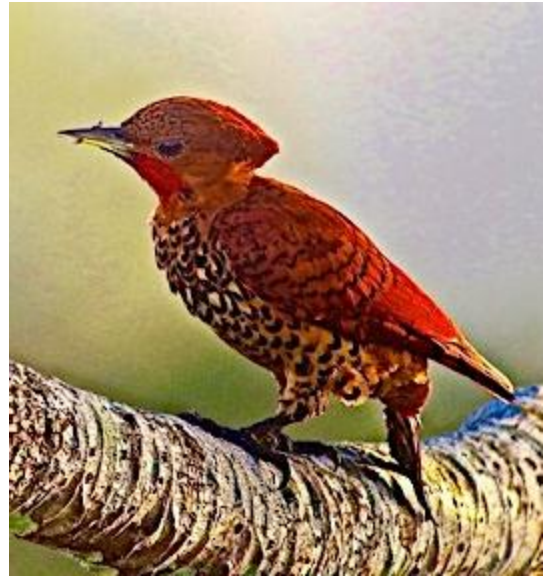
Cinnamon Woodpecker

The Canopy Lodge's guestrooms offer large comfortable beds, private baths, and tasteful interior decoration. The grounds, meanwhile, are a birder's paradise! The gardens and walkways are often loaded with birds. In fact, it is not uncommon to record 60 species from the property alone in a single visit. Greatly enhancing the delightful setting are feeding stations that attract hordes of birds every morning and afternoon. This is indeed an incredible way to bird. For added effect, a beautiful clear stream tumbles past the open-air dining room and our luxurious guestrooms. Highlights of this location include expansive grounds, with flowering bushes that attract hummingbirds, and banana feeders right off the porch where we may see Gray-headed Chachalaca; White-tipped Dove; Red-crowned Woodpecker; Black-chested Jay; Bananaquit; Blue-gray, Crimson-backed, Flame-rumped and White-lined tanagers; Black-striped Sparrow; Buff-throated Saltator; and Chestnut-headed Oropendola (a colony of which nests on the hillside above). Gorgeous Rufous Motmots are known to visit the feeders too.