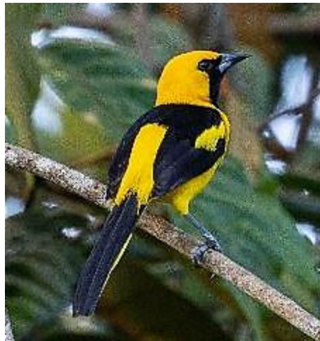
Yellow-tailed Oriole