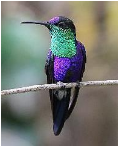
Crowned Woodnymph