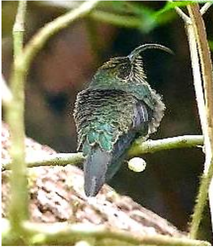
White-tipped Sicklebill