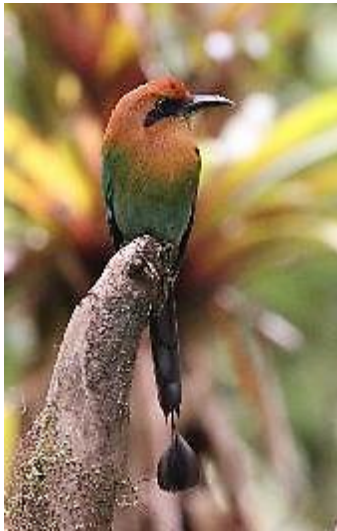
Broad-billed Motmot

area we've found in the Neotropics for locating army ant swarms. Surely the whirl of activity around a swarm is one of the most exciting phenomena of the bird world. As the voracious ants march along the forest floor seeking smaller terrestrial prey, the birds pursue larger, more mobile insects and other arthropods. Because the birds are so intent on feeding, it is often possible to get very close views of them.