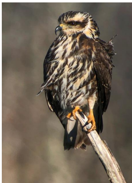
Snail Kite © Rafael Galvez