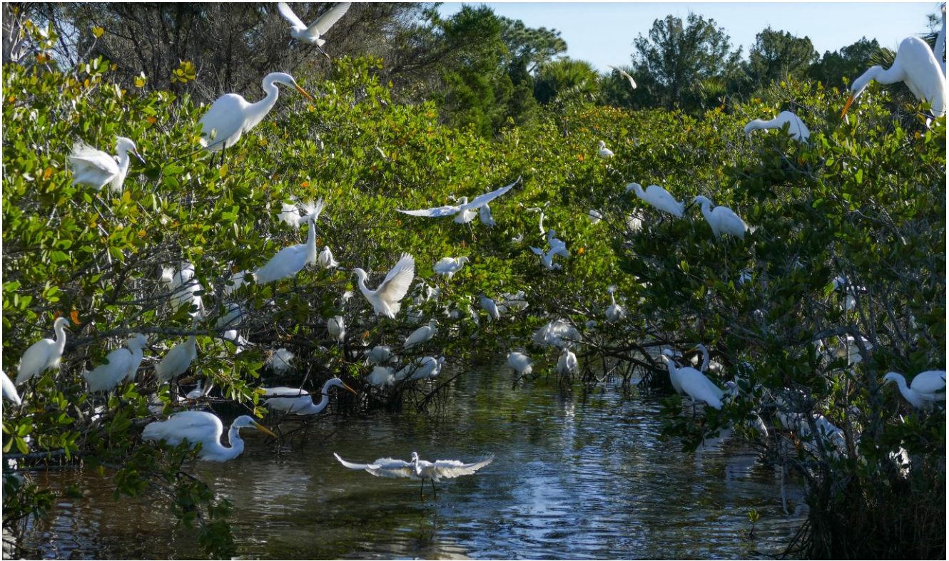
Feeding frenzy of egrets at Merritt Island