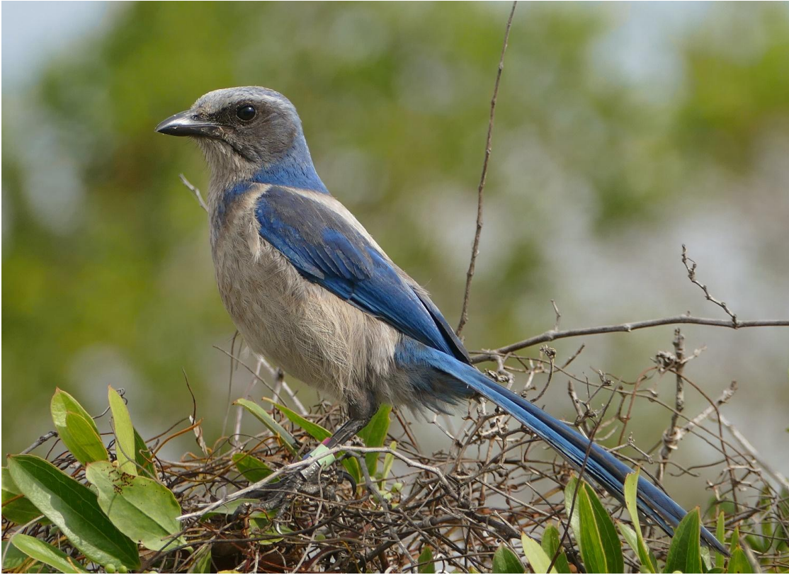
The endemic Florida Scrub-Jay

On this trip, participants will travel a swath of Florida from Gulf beaches to the Space Coast on the Atlantic Ocean, experiencing the wonders of winter birding in one of the country's top birding areas.