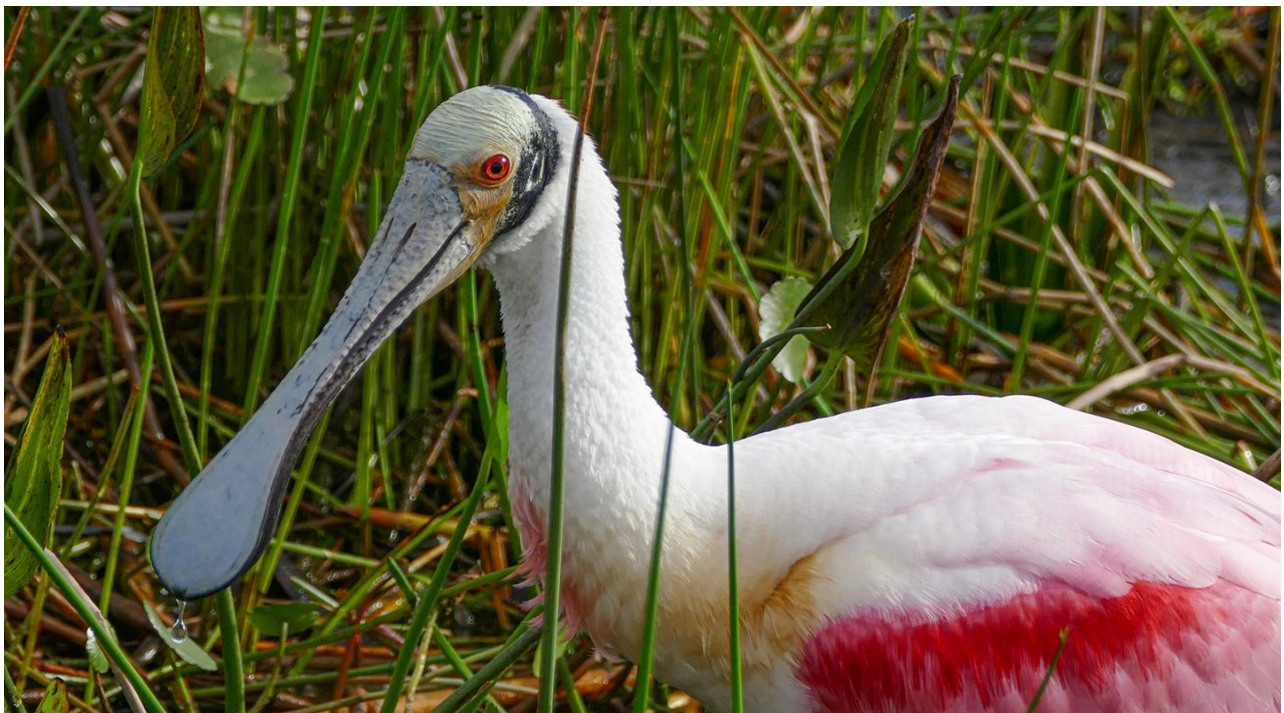
Roseate Spoonbill