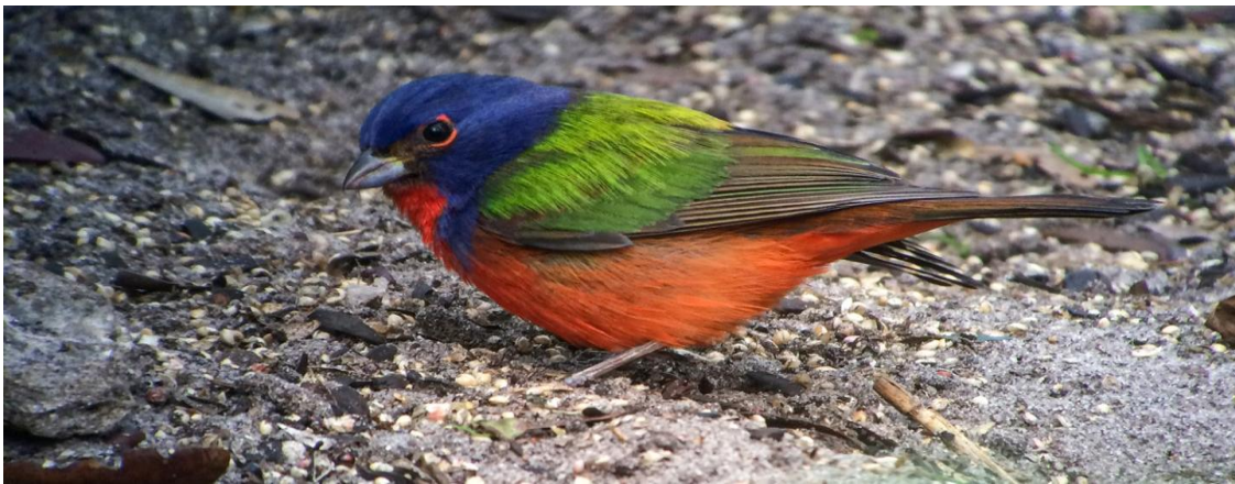
Painted Bunting