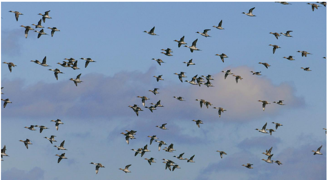
Northern Pintail over Merritt Island