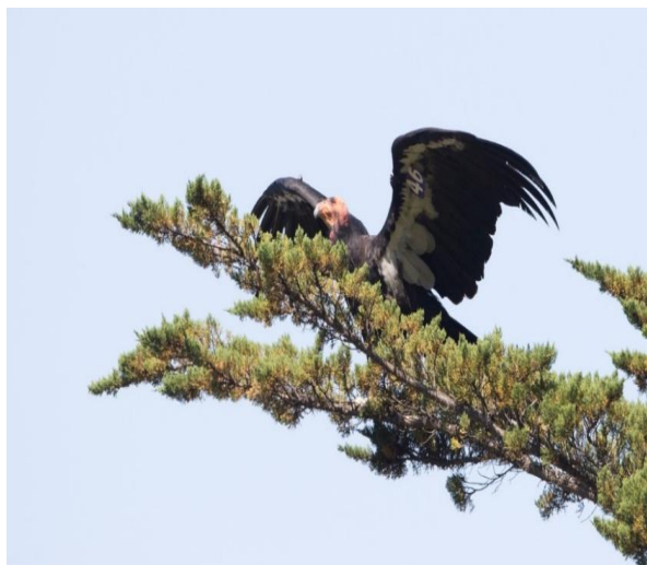
California Condor

Our chances of seeing condors are high, but we may need to check several areas throughout the morning and early afternoon hours before we can claim success. If we are fortunate, we may see