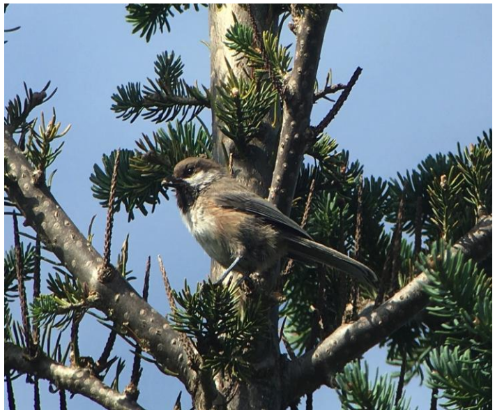
Boreal Chickadee

The scenic coastline can be productive for such species as loons, scoters, Great Cormorants, Common Eiders, and Black Guillemots, not to mention the gorgeous maritime scenery and the spectacle of some of the world's highest tides. Raptors should also be in evidence, including Bald Eagle, Peregrine Falcon, and Merlin. It's rare to find a single spot that has so many attractions for the visiting birder. That this abundance is found amidst such a charming and attractive setting makes Grand Manan the kind of place that one longs to visit repeatedly.