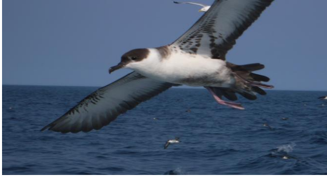
Great Shearwater

underwater barriers, great upwellings are created which propel the colder, nutrient-rich bottom waters to the surface. This, in turn, concentrates plankton, fish, and ultimately, large numbers of pelagic birds and whales.