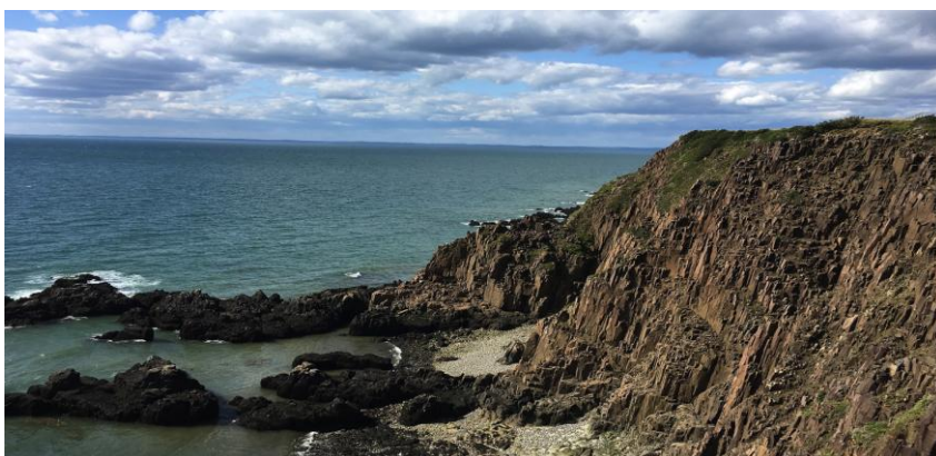
Southwest Head, Grand Manan, New Brunswick

Today we will drive to Blacks Harbour, New Brunswick, to catch our ferry for the ninety-minute ride to Grand Manan. We will likely do