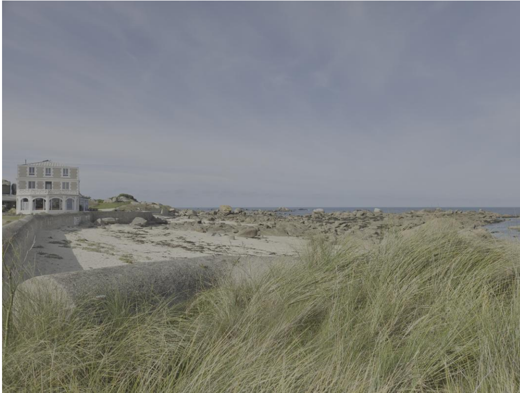
The Hotel de la Mer.