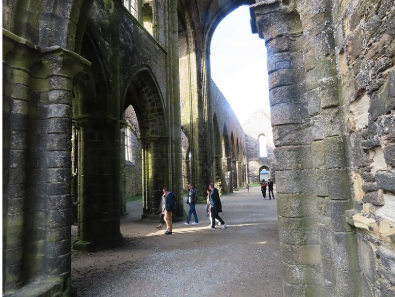
The awe-inspiring ruins of the abbey church of Saint-Mathieu.

mile coastal path skirts the shore here, giving us excellent access to good vantage points over the water and mudflats, where Common Shelducks, Sandwich Terns, and European Stonechats are among the specialties we will hope to encounter. Eurasian Spoonbills, locally scarce, are possible here, and Northern Wheatears, Meadow Pipits, and Eurasian Skylarks can occur in good numbers given the right winds.