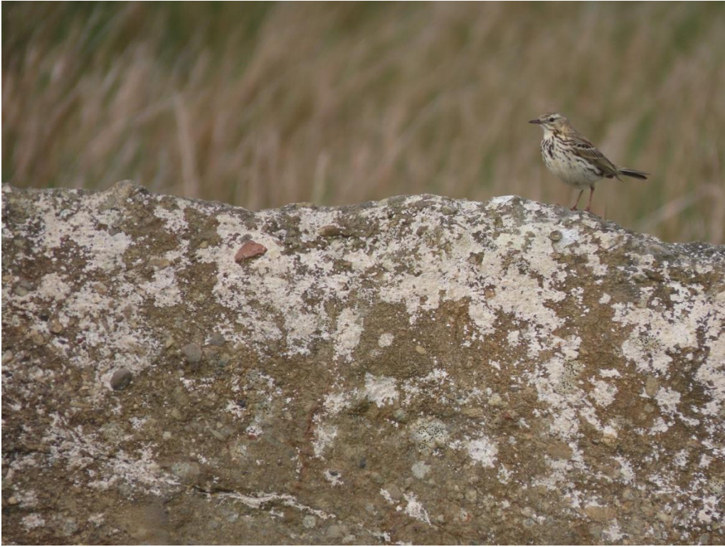
Meadow Pipits are the most abundant passerine migrant at this season.

Seabirds, too, occur at this season in respectable numbers, and we will watch from the seawall at our hotel for Parasitic Jaegers, Northern Gannets, and Manx Shearwaters. Much of our time, though, will be spent birding traditional migrant traps in search of everything from Crested Tits and Zitting Cisticolas to Firecrests and Fieldfares. October is prime time, too, for a wide range of much scarcer migrants, among them the enchanting little, Red-breasted Flycatcher, the bizarre Rosy Starling, and the irresistible Pallas's Leaf Warbler. Even if a given day passes without our discovering a real rarity, we can count on enjoyable days in the field with large numbers of birds, a chance to truly get to know species seen elsewhere in scattered ones and twos.