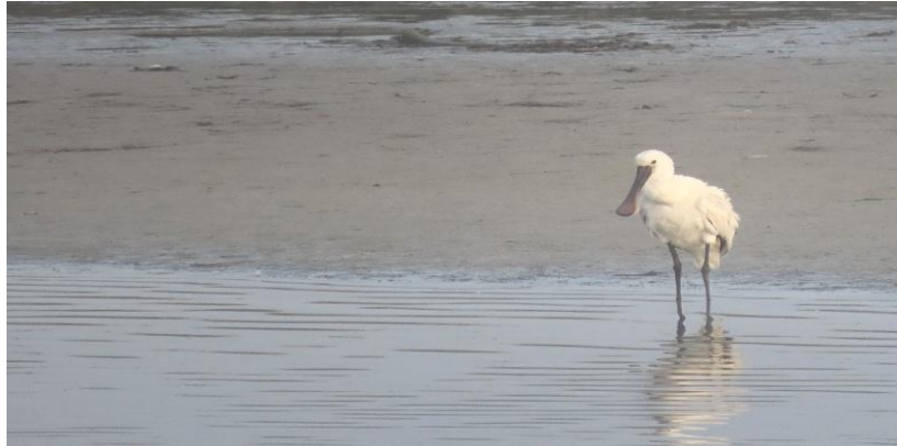
An uncommon visitor to the Bay of Goulven, the European Spoonbill.

Brest has excellent rail, road, and air connections to the rest of France and to many other European destinations. If you are interested in extending your stay, the VENT office, given sufficient notice, will be happy to help you with any arrangements.