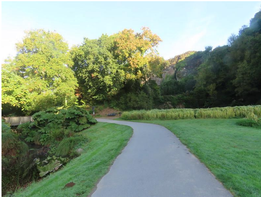
The National Botanical Conservatory in Brest.

Lunch will be in the charming town of Lesneven, after which we will visit one of Brittany's most impressive churches built in the fourteenth and fifteenth centuries. The massive tower, walls, and unusual narthex of the basilica of Notre Dame in Le Folgoët are densely ornamented with statues carved out of the local granite, the same unyielding material used for the church's altars and for its world-famous choir screen, one of the great treasures from the Golden Age of Breton art.