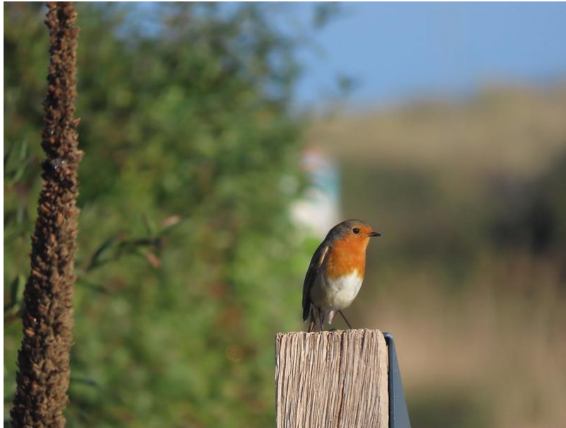
Common, confiding, and noisy at this season: the European Robin.

Oystercatchers—but it is the juxtaposition of structures and functions that makes this beautiful site unique.