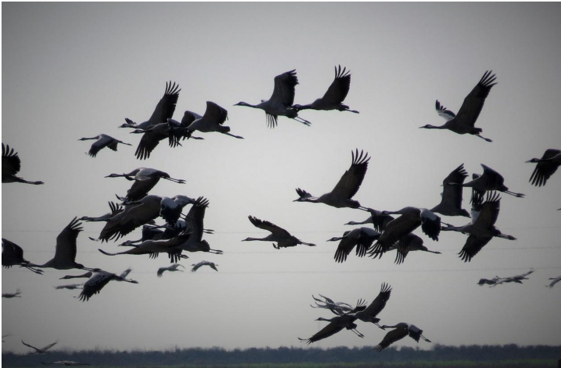
Common Cranes at La Janda