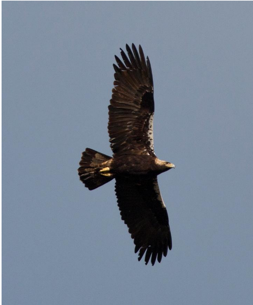
Spanish Eagle

Lunch today, featuring the finest of local delicacies, will be served in Doñana Natural Park, which was created in 1989 to afford further protection to the area's sensitive habitats and wildlife.