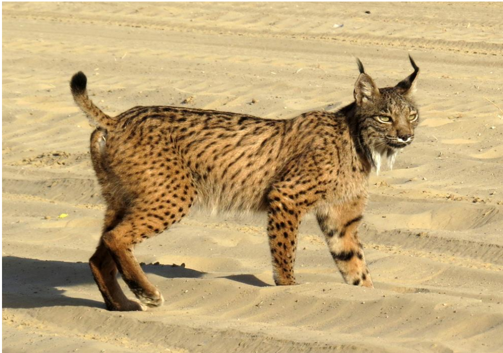
Iberian Lynx

The Iberian Peninsula, separated from the rest of Europe by mountains and sea, is virtually a continent unto itself, with a range of natural and cultural features to match. Our new tour combines outstanding birding with an exploration of equally famous cultural and historical sites in beautiful southern Spain. Headquarters for the first days of our time together is glorious Seville, bastion of Mudéjar art and culture and birthplace of the Renaissance Age of Discovery; here we will visit the largest Gothic cathedral in the world and the fantastically ornate Alcázar, a royal palace built—figuratively and literally—on the foundations of an older Islamic structure. And Seville remains just as vibrant today as it was half a millennium ago, as an exciting evening performance of authentic Andalusian flamenco will prove.