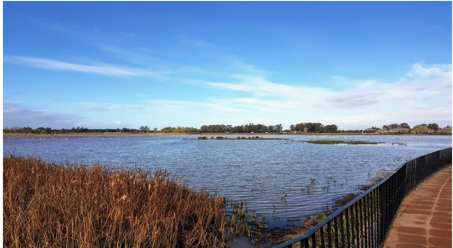
Madre de las Marismas in Winter

There are several visitor centers nearby, each with good paths and blinds where we can hope to see these and other species at close range. Here, too, bird concentrations and viewing opportunities will depend on water levels, which can be very low if the autumn rains were disappointing.