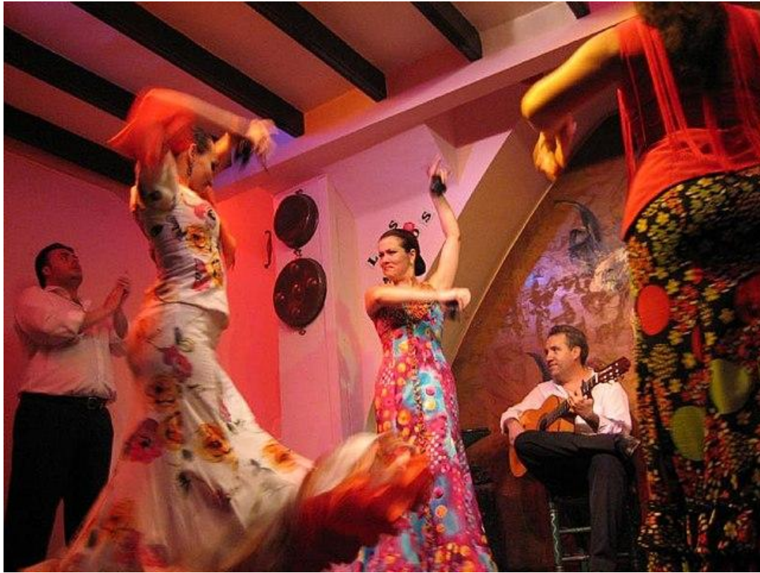
Flamenco in Seville