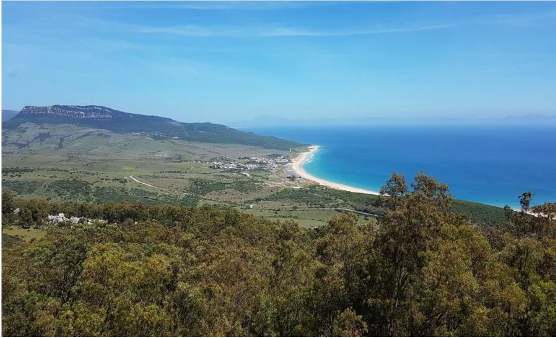
El Estrecho National Park

El Estrecho Natural Park, the southernmost wildlife refuge in Spain, and thus in Europe, safeguards more than 72 square miles of terrestrial and marine habitats between the towns of Algeciras and Tarifa. The mix of agricultural fields, mountains, beaches, cliffs, and lagoons makes the area as appealing to birders as it is to birds. We will make our way through the park from east to west, with Africa just off our left shoulder as we visit such exceptional localities as the marshes of the Palmones River, the watchpoints at Punta Camorro and Cazalla, Los Lances Beach, the Sierra de la Plata, and Puerto de Facinas.