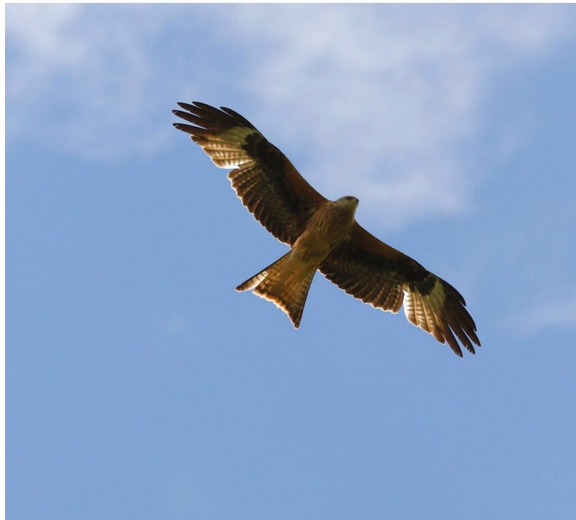
Red Kite

In winter, Andalusia's resident Cinereous Vultures are joined by amazing numbers of two other important scavengers, the Eurasian Griffon and the Red Kite, imposing birds themselves but still dwarfed by the Cinereous, which can stand nearly four feet tall with a wingspan of almost ten feet. Even the Golden and Spanish Eagles—we will be scanning the skies for both of these local specialties—can seem puny in comparison.