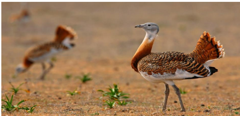
Great Bustards