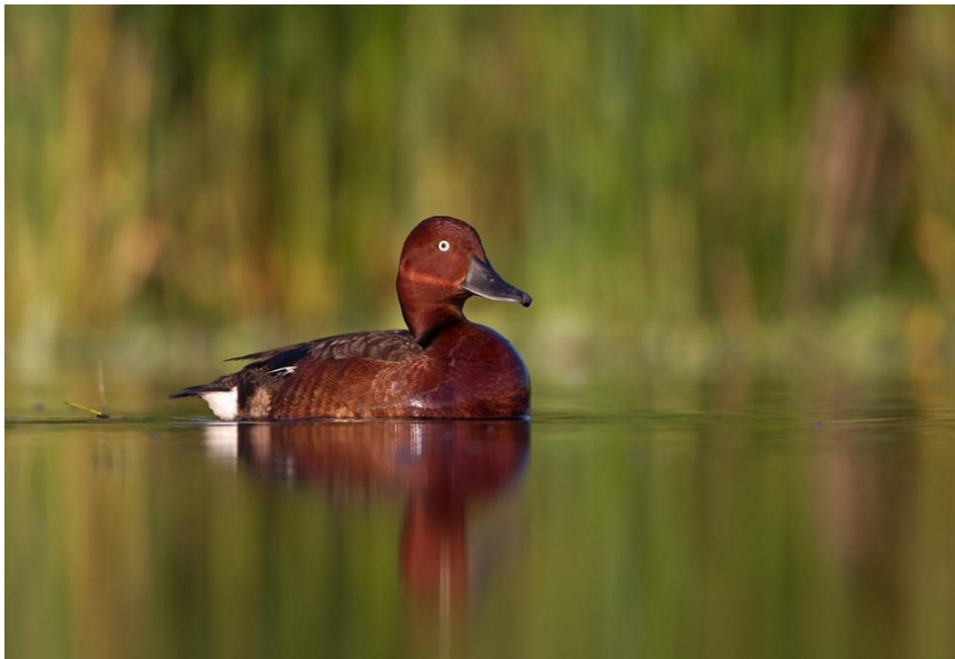
Ferruginous Duck

Once in Sanlúcar, we will visit the salt pans of Bonanza, which attract an impressive variety of shorebirds and gulls, along with Greater Flamingos. At the marina of Chipiona, we should meet up with one of the newest additions to Spain's breeding avifauna, the Little Swift, which has colonized a few sites in Cadiz after expanding from northern Africa with the warming climate.