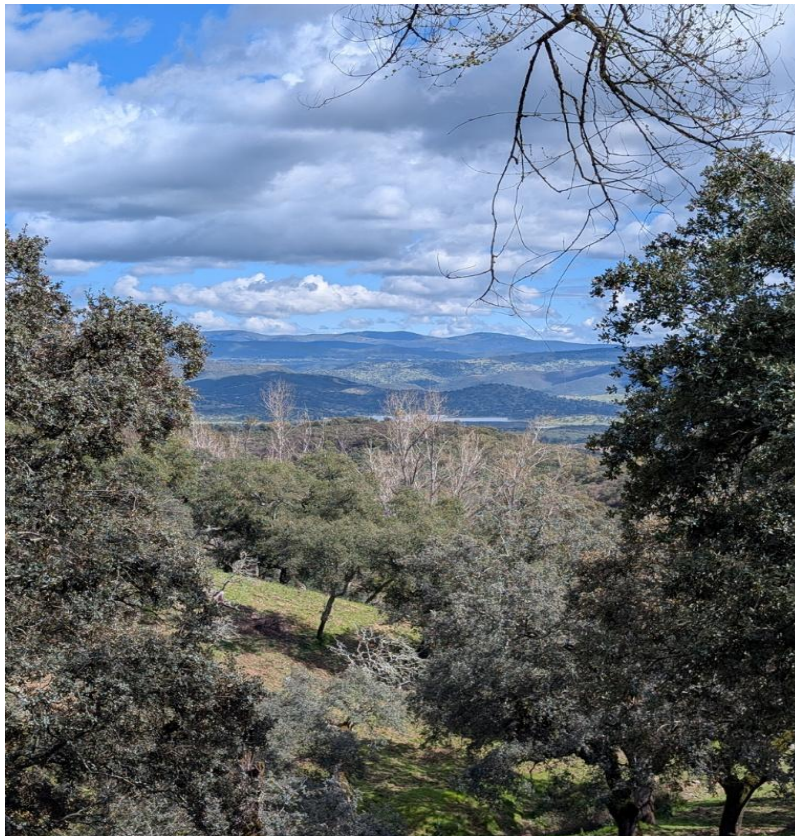
Sierra de Aracena National Park