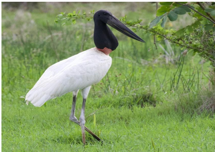
Jabiru © David Ascanio

We will leave Lethem early this morning to allow time for birding stops. Along the road we will pass by ponds containing Brazilian Teal and Sharp-tailed Ibis while in areas of drier ground we may find pairs of the attractive Buff-necked Ibis and Jabiru. As we continue on, we will encounter an open country avifauna rich in tyrant-flycatchers that includes Plain and Lesser elaenias, Southern Scrub Flycatcher and Mouse-colored Tyrannulet. Also, this is a key area to look for the unique White-naped Xenopsaris, a member of the becard and tityra family with an odd distribution in South America. We'll reach Wichabai Ranch in time for lunch.