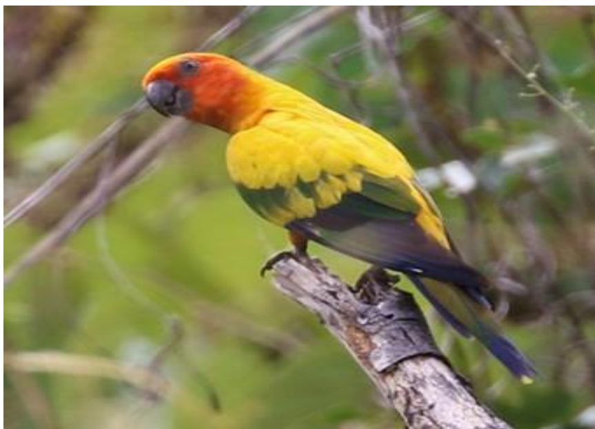
Sun Parakeet

Seeing the Sun Parakeet is significant for more reasons than one. Certainly, it is an amazingly beautiful bird and always a delight to see. Yet, it is also a very rare bird, a species once almost wiped out of the region by intense trapping for the pet trade, and now serves as a good example of a bird conservation project hosted by a local community. The population of the parakeet has begun to rebound under the protection of this indigenous community. We are likely to spend some time learning from the local community about this successful conservation program.