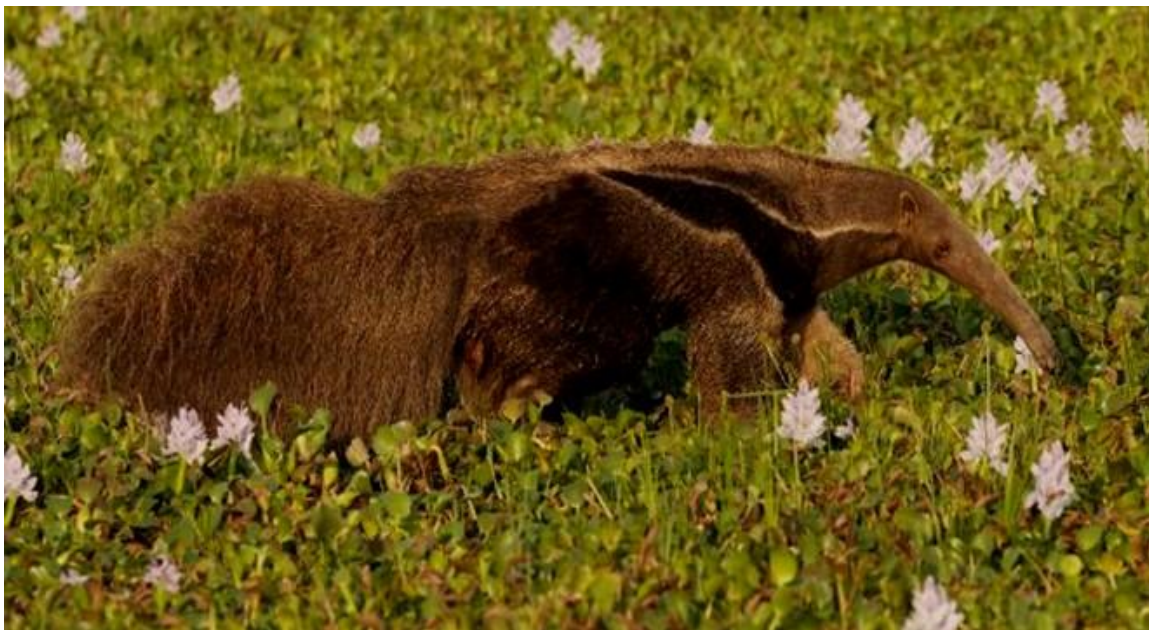
Giant Anteater

Rock View Lodge is located at the edge of the North Rupununi Savanna, close to the Pakaraima Mountains and the Iwokrama Forest. This position creates a savanna–rainforest ecotone, meaning species from both ecosystems overlap. Over the course of the day, we will sample some or all of the following ecosystems: North Rupununi Wetlands, recognized for its near-natural state and diversity of aquatic life; Rupununi Savanna Grasslands, open grasslands and scattered bush islands home to Giant Anteater, raptors, and an array of open-country birds; Iwokrama Rainforest; and Pakaraima Foothills, a region of rolling hills and rocky outcrops with dry forest patches and gallery forest.