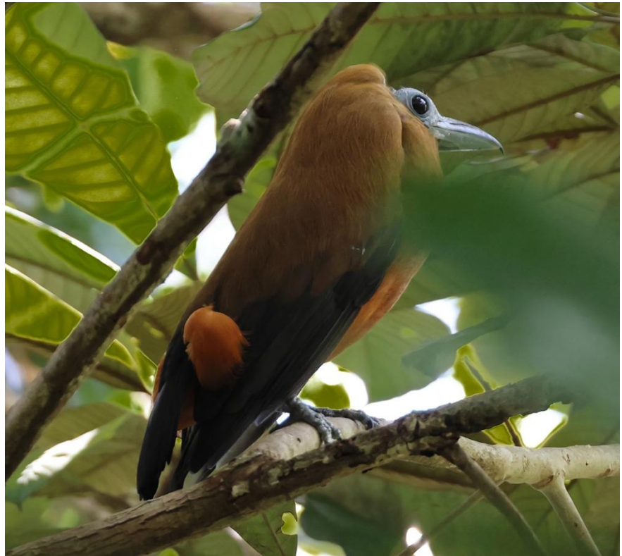
Capuchinbird

Our adventure begins in Georgetown, where a day on the coast presents a pleasing introduction to Guyana, with our sights set on observing a range of special birds, including Rufous Crab Hawk, Festive Amazon, and Blood-colored Woodpecker. A private flight into the interior takes us to Rock View Lodge, in the heart of the North Rupununi Savanna. Here among rolling grasslands and tropical rainforest, we will seek such prized species as Maguari Stork,