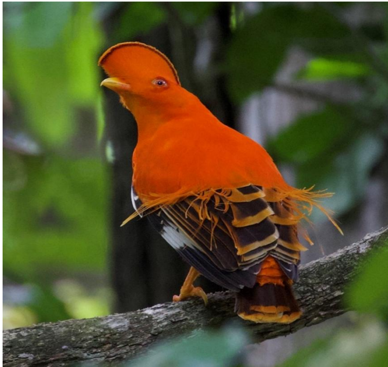
Guianan Cock-of-the-rock

In the early afternoon we will pay a visit to a lek of Guianan Cock-of-the-Rock. The display of this species is mostly silent (as opposed to that of the Andean Cock-of-the-Rock, which is quite vocal) and we hope to see males coming close to the forest floor to show their incredible orange plumage. After this unique experience, we will continue our birding. We may come across Gray-winged Trumpeters running along the roadsides, with their hunched backs and long necks held against their breasts. Other birds found in this general region are the secretive Blue-backed Tanager and an array of tyrant flycatchers and seedeaters.