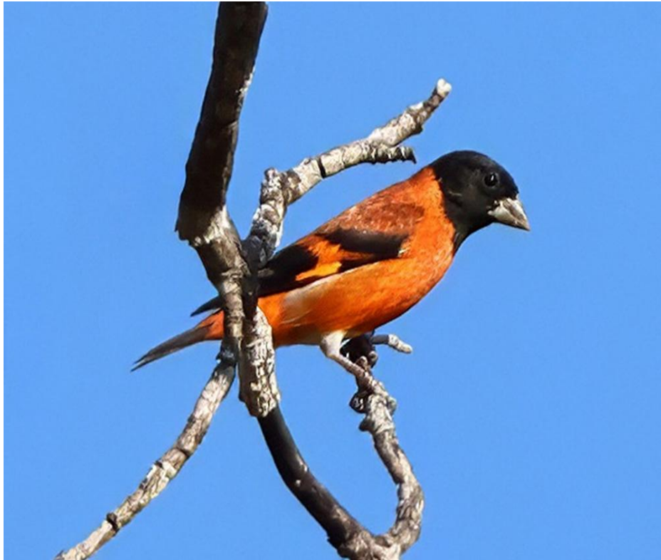
Red Siskin, Guyana

Overlooked, unfamiliar, and largely removed from the world’s public and political eye, the small tropical nation of Guyana is a biological treasure-trove home to some of the most prized birds and vaunted wildlife in South America. On this new tour—our first to Guyana in several years—we will travel to the Rupununi region of southwestern Guyana, one of the last great wildernesses on Earth, known for its stunning biodiversity, rich Indigenous culture, and remarkably varied landscapes.