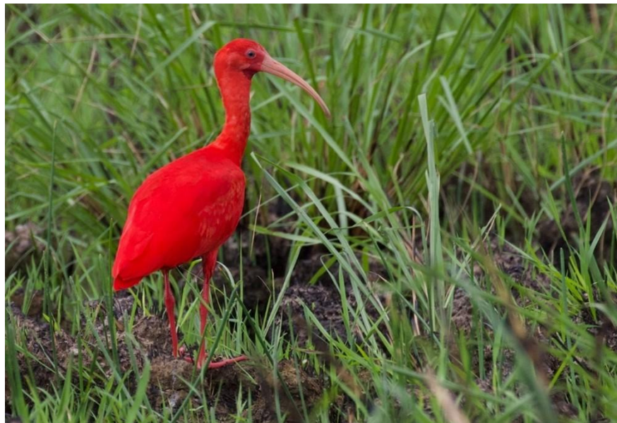
Scarlet Ibis

Located in the far north of the country, Georgetown sits on the coast, where a mosaic of aquatic and forest habitats supports a mix of common and widespread birds and species restricted to the swamp forest and mangrove stands that once blanketed the Atlantic coast of the Guianas. We will sample these habitats. Our day likely begins with a visit to coastal mudflats where the restricted distribution Rufous Crab Hawk occurs. Here, we also may be delighted by brightly-colored Scarlet Ibis, Mangrove Rail, diminutive White-bellied Piculet, and Plain-bellied Emerald, a hummingbird found close to mangrove stands. Next, we will enjoy a boat trip on the tree-lined Mahaica River, where we will look for the bizarre and largely vegetarian Hoatzin. This activity brings the prospect of many birds; among the possibilities are Great Black-Hawk, Snail Kite, Green-tailed Jacamar, Wing-barred Seedeater, Epaulet Oriole, and probably a roost of Boat-billed Heron (a typically crepuscular and nocturnal species). We will also stay vigilant for pairs of the entertaining Black-capped Donacobius, an elegant bird known for its unique display choreography.