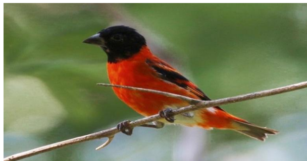
Red Siskin

Today's plan will depend on recent siskin sightings. For that, the assistance of the rangers of the South Rupununi Conservation Society will be invaluable.