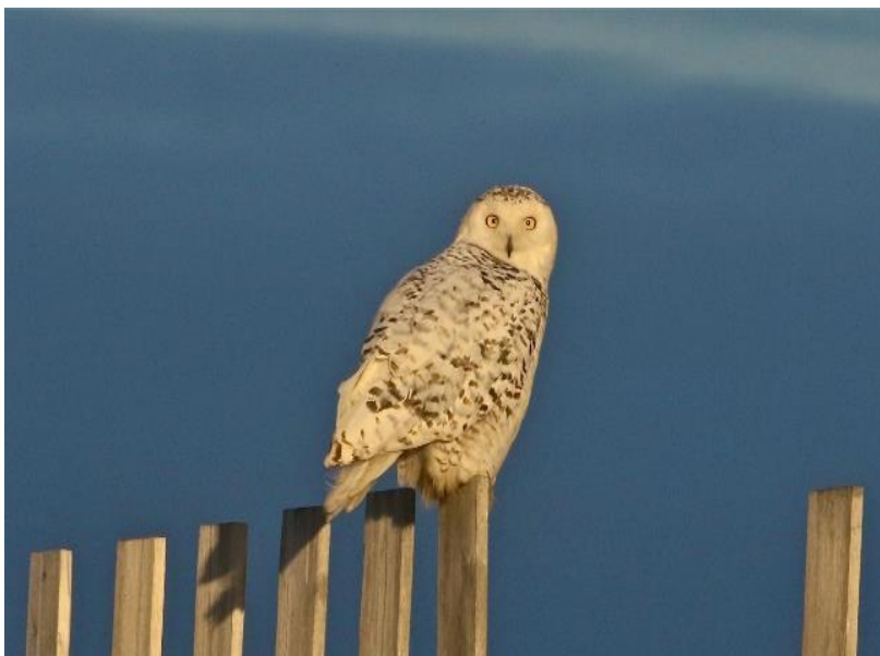
Snowy Owl (female), Barrow, Alaska

Depending on flight schedules, we should have at least a few hours of daylight after breakfast this morning for a last check of the coast for migrating gulls, waterfowl and seabirds, as well as a final shot at finding a Polar Bear, Walrus or Bearded Seal on the ice. We'll then check out of the hotel and head to the airport for our afternoon flight (subject to change) back to Anchorage, where the tour will conclude with a final checklist session and farewell dinner.