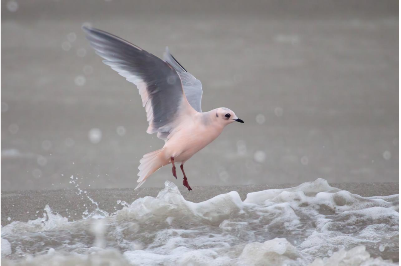
Ross's Gull © Declan Troy

Far out in Alaska's remote Aleutian chain, Adak Island offers a birding experience unlike any other—where the possibility of exceptionally rare birds, dramatic landscapes, and relative comfort converge in one of the ABA area's most compelling birding destinations. Historically overshadowed by famous outposts like St. Paul Island and Gambell, Adak has re-emerged in recent years as a must-visit location for adventurous birders looking for a level of comfort rarely found in such remote regions. The island's varied habitats—coastal wetlands, mudflats, beaches, willow stands, rugged tundra, and rich offshore waters—attract a diverse mix of regular migrants, vagrants, and seabirds, as well as a few hardy residents. Just offshore, rugged rocky islands host nesting colonies of the elusive Whiskered Auklet, the ABA's least-encountered alcid.