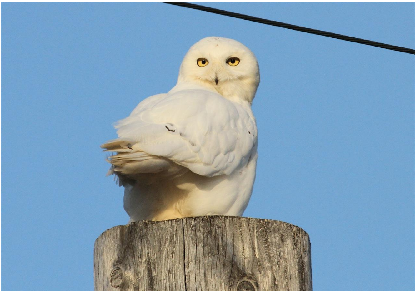
Snowy Owl (male), Utqiagvik (Barrow), Alaska

Yellow-billed Loon are excellent. Any spots where Glaucous Gulls congregate will be of special interest, since we may be able to pick up the odd Slaty-backed Gull or Iceland (Thayer's) Gull out of the masses. Our stay will fall on the early side of average fall arrival dates for Ivory Gull, but we will remain alert to their possible presence, particularly if there are remnants of recent seal or whale carcasses (a major attractant to both Ivory Gulls and Polar Bears!) anywhere along the beach. Cruising the limited open road system by vehicle will provide us with chances for seeing Snowy Owl and Arctic Fox, as well as providing a respite from frigid sea watches. Passerines are scarce this late in the year,