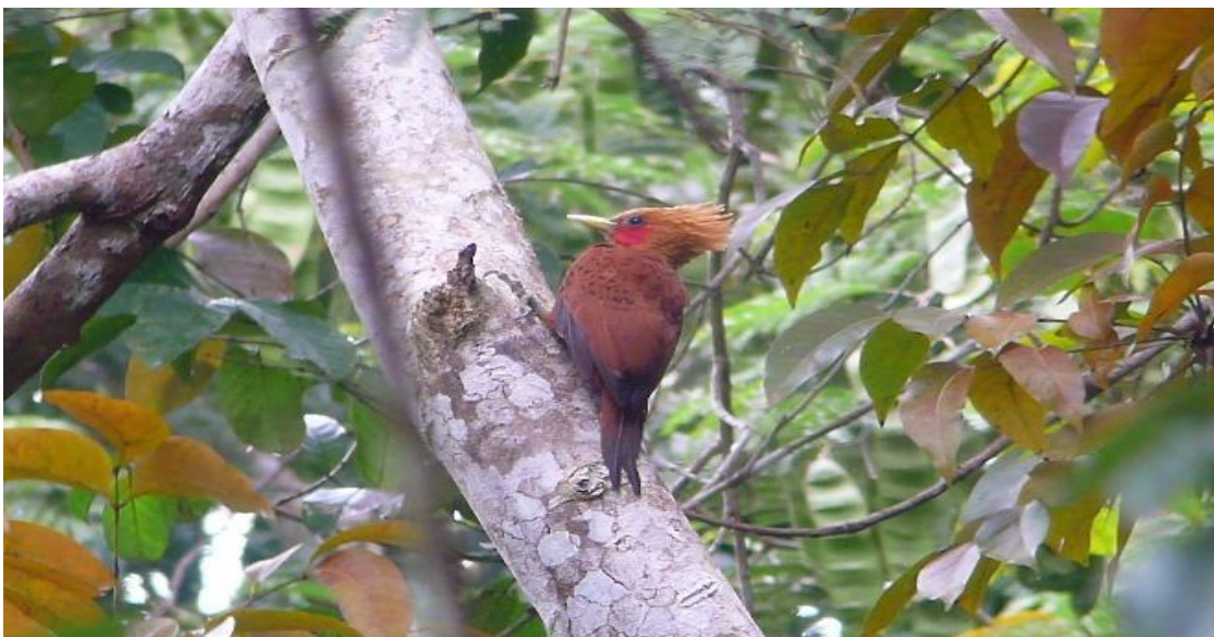
Chestnut-colored Woodpecker

Taller forests produce a different set of birds. Large mixed-species flocks roam about the jungle, often led by a Black-throated Shrike-Tanager. Each flock contains a somewhat different make-up, but Slaty-tailed, Black-headed, and Collared (very uncommon) trogons; seven species of woodcreepers; the incredible Chestnut-colored Woodpecker; Dot-winged Antwren; Northern Plain Xenops; Eye-ringed Flatbill; Ochre-bellied and Ruddy-tailed flycatchers; Yellow-olive Flatbill, Rufous Mourner; Tawny-crowned and Lesser greenlets; Green Shrike-Vireo; Red-crowned and Red-throated ant-tanagers; and Black-faced Grosbeak are among the possibilities in this habitat.