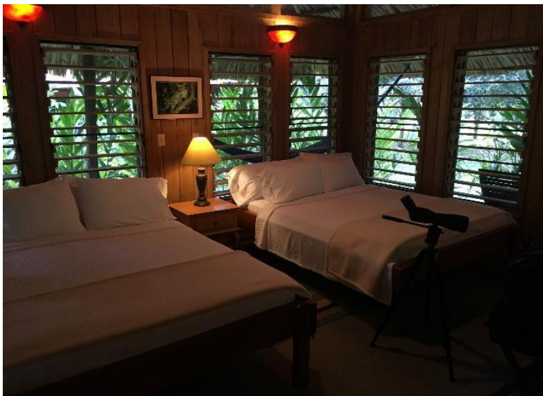
Chan Chich Lodge

Our lodging facilities are nestled on an ancient elevated plaza ringed by grass-covered temples and palaces clothed in dense forest. The owner has a reputation for doing everything first-class and this lodge is no exception. The thatched-roof cabañas are skillfully handcrafted of exquisite hardwoods to blend well with the natural surroundings. Inside each cabaña are two queen-size beds, a large array of well-screened windows, a ceiling fan, a spacious bathroom with shower facilities and hot and cold running water, plus electrical power available twenty-four hours a day.