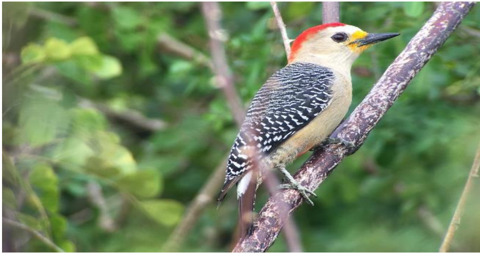
Yucatan Woodpecker

Pigeon, White-fronted Amazon, Great Kiskadee, Vermilion Flycatcher, Brown Jay, Gray-breasted Martin, Mangrove Swallow, Clay-colored Thrush, Tropical Mockingbird, Cinnamon-bellied Saltator, Melodious Blackbird, and Hooded Oriole. Several less numerous species will be our main targets of