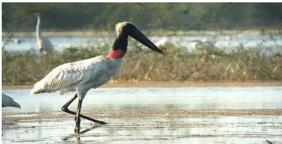
Jabiru

NIGHT: Fort George Hotel and Spa, Belize City