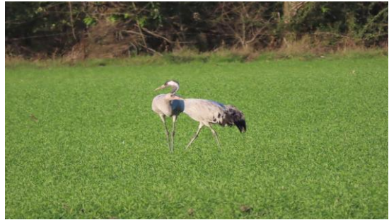
A young Common Crane follows a parent on its first southward migration

In the 1730s, hoping to bring Prussia up to the highest standards in industry and art, Frederick William I, the Soldier King, recruited the best Dutch artisans and craftsmen to move to Potsdam. To make the offer more attractive, the king ordered the construction of more than 130 red-brick houses in the Dutch style, instantly creating the largest Dutch settlement anywhere outside of the Netherlands. Forty-five minutes north of Potsdam, the fields, ponds, and marshes around the village of Linum are the most significant inland staging area in Europe for southwest-bound Common Cranes. We will drive to the area in the early afternoon, looking for corvids, waterfowl, and cranes on the sides of the rural roads. Once in Linum, we will proceed to the fishponds below the village, one of Germany's most famous birding spots and the site of numerous rarities over the years—including the startling two pygmy cormorants discovered on our 2025 tour.