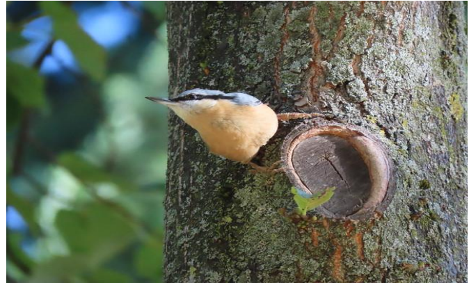
European Nuthatch

We will start the day with an optional early birding walk in the gardens of Sanssouci. This is one of the best sites in the city to find Eurasian Jays, and Eurasian Red Squirrels, Hooded Crows,