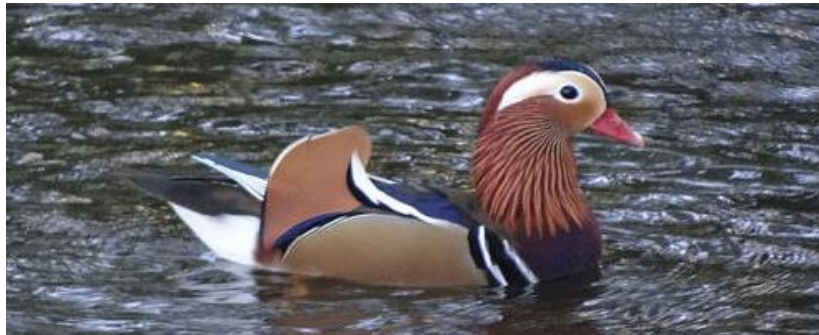
Mandarin Duck