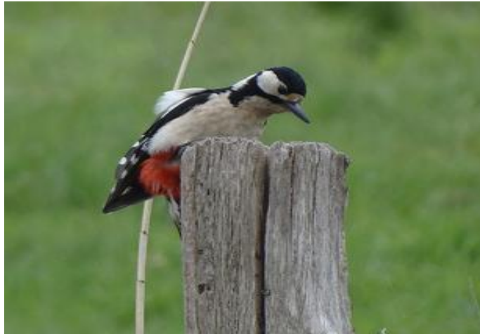
Great Spotted Woodpecker

We will spend most of the morning wandering the paths here, concluding with a look at the exterior of the palace. The interior is closed on Mondays, but those who are interested will have an opportunity to take the tour later this week.