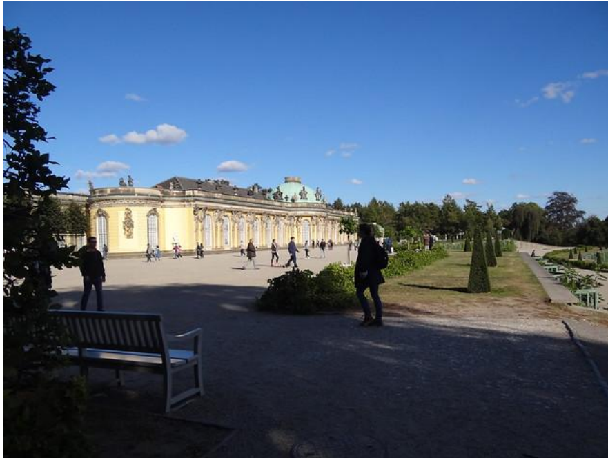
Sanssouci