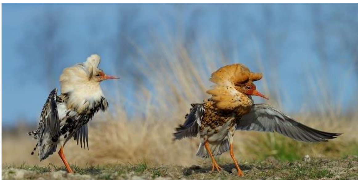
Male Ruff lekking will definitely be a trip highlight.

NIGHTS: Finlandia Hotel Airport Oulu, Kempele, Finland