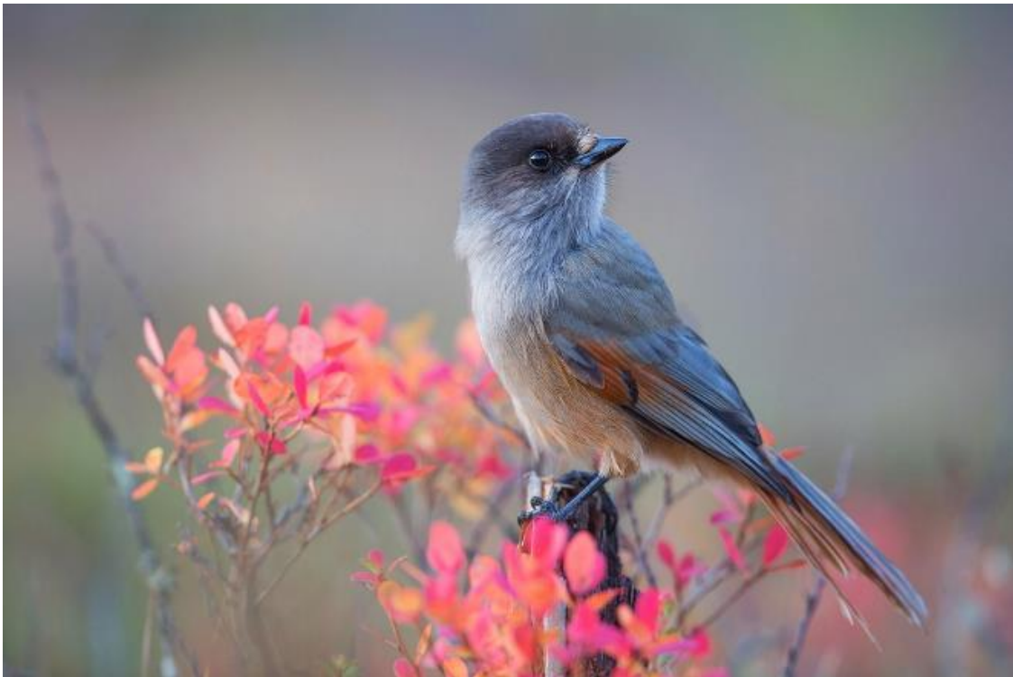
Siberian Jay is one of the classic species of the vast taiga forest.

opportunities as well as great hot chocolate! Species should include cute Red Squirrels, European Greenfinch, Redpoll, Gray-headed Chickadee (Siberian Tit), Siberian Jay, and superb Brambling in summer plumage as well hopefully amazing Pine Grosbeaks.