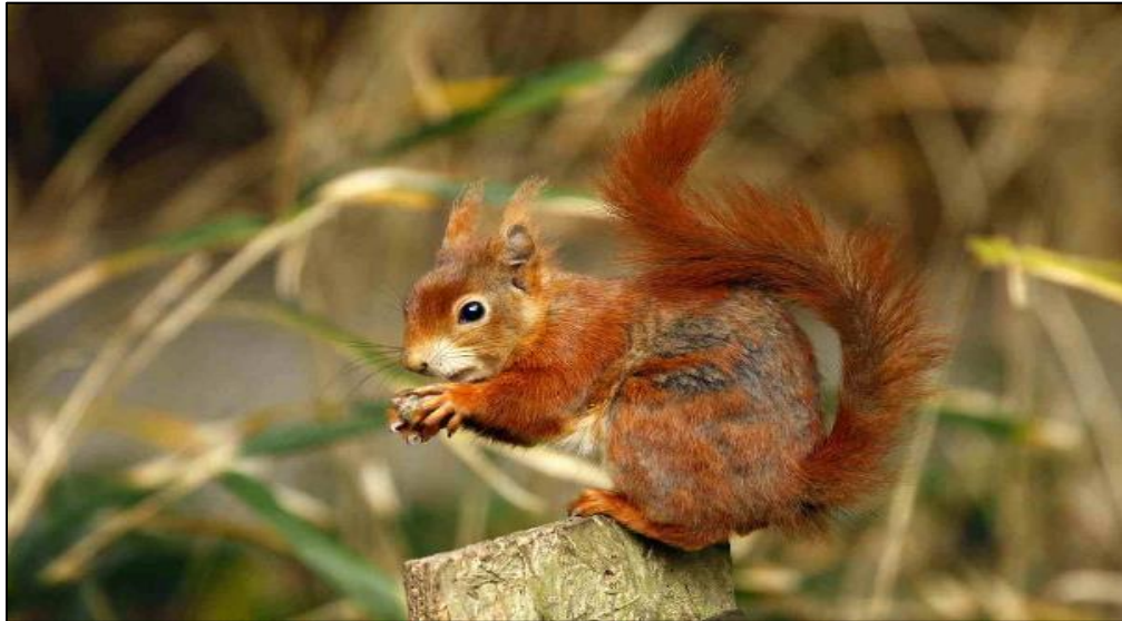
A charming European Red Squirrel

NIGHT: Hotel Puustelli, Lieksa / Wolverine blind