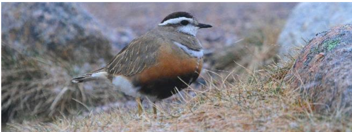
Striking Eurasian Dotterel breed on the tundra.

Apart from a splendid list of very unusual Arctic birds, the tour should be a delight for the stunning, unspoiled and varied scenery, and the excitement of civilized, safe and comfortable travel into some of the most remote wilderness areas northern Europe has to offer. The Finns (after the Brits!) are some of the keenest birders in Europe and there is a wealth of local knowledge from our Finnish co-leaders to assure that we have the best possible opportunities for finding the most sought-after birds. The Birding Hotline will likely direct us to a number of rarer species also; in 2022 we had a lovely male Pied Wheatear! The road systems, transport, hotels and meals are all (as we might expect from Scandinavia) of a high standard. Several of the national parks have excellent trails, visitor centers, blinds and observation towers to make our birding here an even more pleasurable experience.