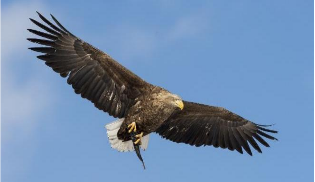
Huge White-tailed Eagles are fairly regular around the magnificent seabird cliffs.

In the rich seas and fjords here, we will especially search for the incomparable King and Steller's (both rare) and Common eider; Yellow-billed Loon; and Velvet and Common scoter. Song birds might include