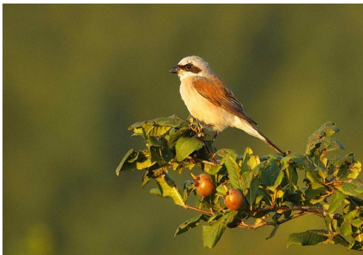
Red-backed Shrike

In agricultural areas and bushy edge habitats we will search for sought-after master songsters like Blyth's Reed and Marsh warblers; however, the prize has to go to Thrush Nightingale with its astonishingly loud and beautiful song. Hopefully, late arriving River or Common Grasshopper warblers (both skulkers) are present. Edge and riverside inhabitants should include Greater and Lesser whitethroats, Whinchats and flashy Common Rosefinches, male Ortolan Buntings, Yellowhammers, and lovely Western Yellow Wagtail & Red-backed Shrikes and with luck even the odd Eurasian Wryneck a truly bizarre brown/gray woodpecker or Eurasian Hobby overhead catching dragon flies.