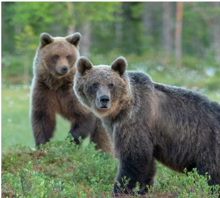
European Brown Bear from bear blind

The Wolverine is a solitary and rare animal that is always on the move. It resembles a small bear with a long tail. They are primarily scavengers and can devour their food quickly in big chunks—their scientific name, Gulo , means glutton. Meanwhile, the Brown Bear is the largest predator in Europe, feeding on anything it can find or catch, ranging from berries to fish and other mammals. Adult males can weigh a massive 300 kilos or 660 pounds. Despite their big size, Brown Bears are agile and males can travel hundreds of kilometers in a short period of time; females and cubs inhabit smaller territories.