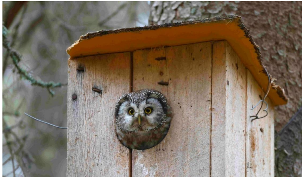
A cute Boreal Owl inspects us.

Continuing eastwards towards Kuusamo and closer to Russia, we find a land of lakes, bogs and extensive forested hills providing habitats for Taiga Bean Goose, Great Crested and Red-necked grebe, Arctic Loon, Jack and Common snipe, European Golden-Plover and Spotted Redshank.