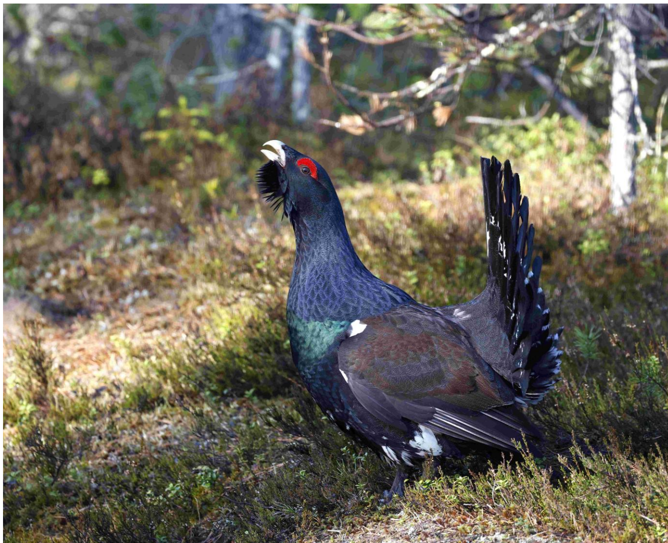
A magnificent male Western Capercaillie displaying.

Our trip is perfectly timed to enjoy the best of early spring as we follow this natural burst of life, offering many sought-after Arctic breeding specialties along with an excellent opportunity to experience exciting spring migration as countless water, sea birds, shorebirds and songbirds are arriving to enjoy breeding in the Land of the Midnight Sun. This tour has been meticulously designed, along with expert local birders, enabling us to highlight the best Scandinavian avian treasures, including many of Europe's most