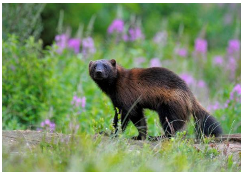
The poorly known Wolverine

NIGHT: Hotel Puustelli, Lieksa / Wolverine blind