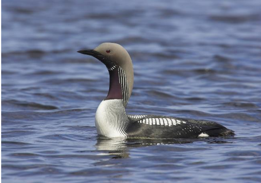
Breeding plumaged Arctic Loon

NIGHT: Båtsfjord Hotel, Båtsfjord, Norway