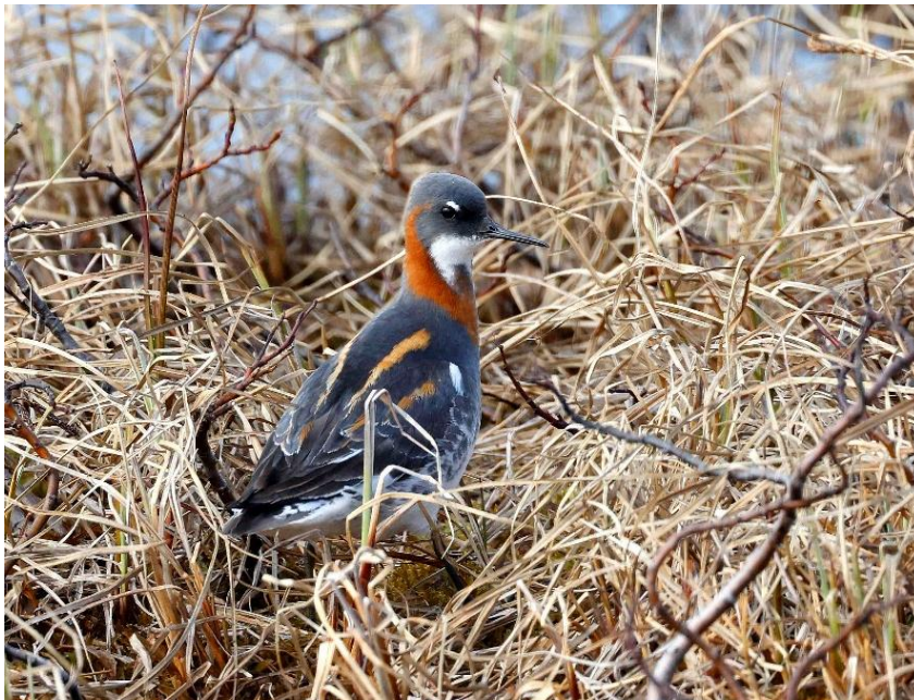
Red-necked Phalarope female © Andrew Whittaker

The road follows the unique rocky coastline and there are excellent vantage points for sea watching from the end of the road which can be great with the correct winds. Here we will search for White-billed and Common loon, Northern Gannet, Northern Fulmar, and again pay special attention to hopefully find either King or Steller's eider (both rare). Also, sea watching at times can be very productive, giving us chances of both Parasitic and Pomarine jaegers and Great Skua. The arctic coast is always a great place to look for whales and dolphins, and we have a good chance of detecting