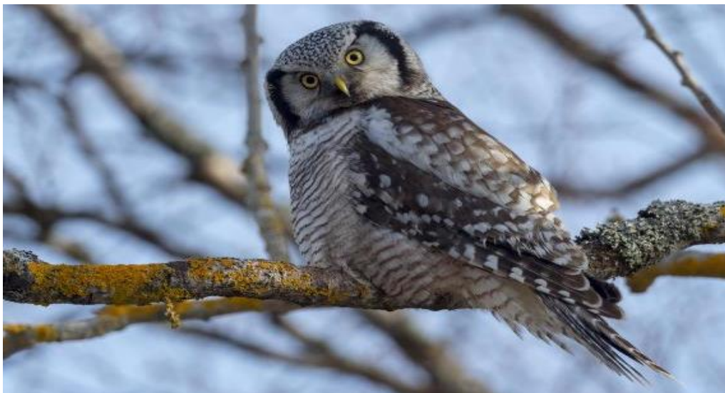
Northern Hawk Owl

We will spend two full days birding the forests and coastal areas around Oulu. The region is best known for its northern owls. Our local guides specialize in showing these to visiting birders and often have active nests located here and at other locations where we stay later in the tour. While breeding numbers fluctuate from year to year, the breeding species include Great Gray, Ural, Boreal, Pygmy and Short-eared owl and most years also the nomadic Hawk and maybe Long-eared owl too. Depending on the vole numbers, some owl species might also be encountered further north in the Kuusamo and Ivalo regions, including Hawk Owl up in Norway. In the forests surrounding Oulu, we will also look for Common Buzzard; Eurasian Woodcock; Eurasian Three-toed, Greater-spotted and sought-after massive Black woodpecker. One of our prime targets is the incredible sought after Western Capercaillie. Black or even Hazel grouse are also possible. Songbirds should include Fieldfare, Crested Tit, Eurasian Bullfinch, Yellowhammer, Wood Warbler, Common Rosefinch and Great Gray Shrike (rare) among several other interesting species that breed in the area.