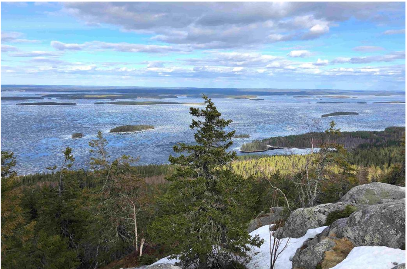
Pristine boreal forest holds many exciting Arctic and Siberian specialties.

Finland and Arctic Norway offer the perfect combination for birders of many European specialties found in spectacular rugged landscapes with vast boreal taiga forests, endless lakes, majestic tundra's and an intricate coastline boasting remote fjords and stunning Norwegian Sea cliffs and offshore islands brimming with countless thousands of breeding seabirds. During the Arctic's short summer, the sun never really sets for months, fueling this spectacular land of plenty; the all too brief explosion of Arctic life makes our visit to Scandinavian Lapland so special. Be prepared for a fascinating adventure in one of Europe's most varied, untouched and exciting wildlife-watching destinations!