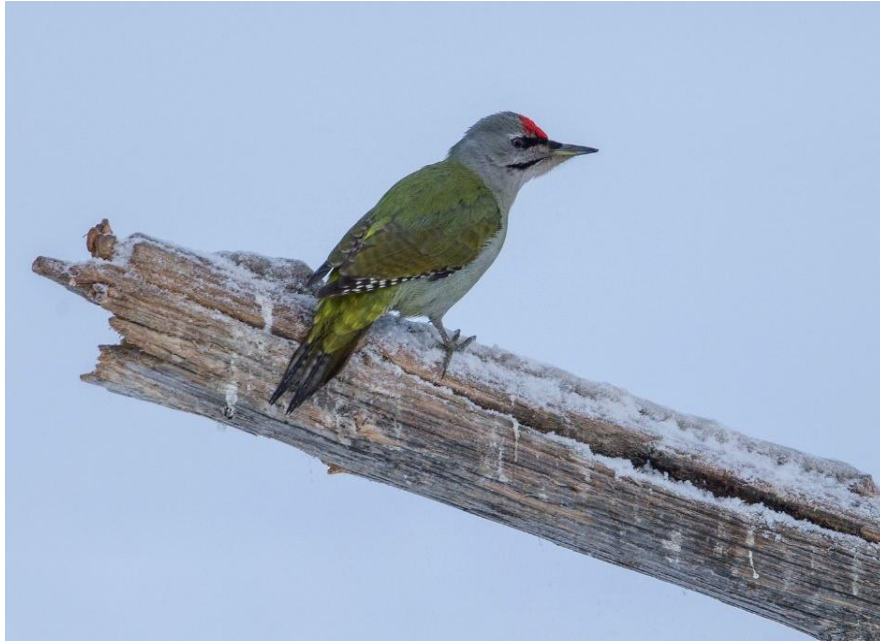
Gray-headed Woodpecker

Depending on departure flight times, we may offer a couple of hours of early morning birding before coming back to the hotel with time to clean up and finish packing. We'll provide a group transfer to the international airport, timed to accommodate any flights leaving Helsinki after 12:00 noon.