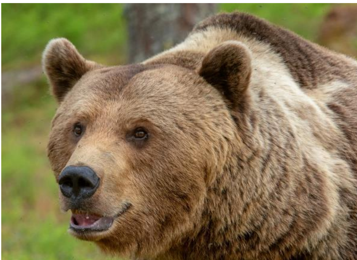
European Brown Bear taking a close look outside the blind

NIGHT: Boreal Wildlife Centre, Kuhmo / Bear blind