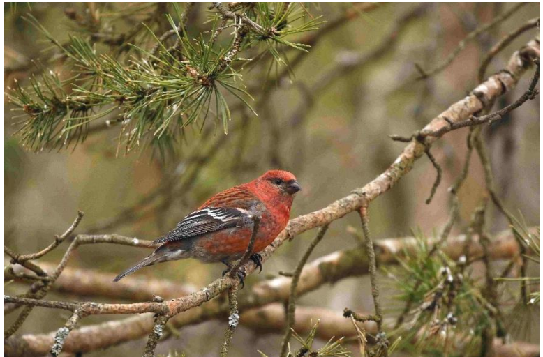
Stunning male Pine Grosbeak

After breakfast we continue our tour towards the northernmost part of mainland Europe. As we explore the Lappish forests and bogs along the way, we will concentrate this morning on searching for several target species with a delightful stop in Kaamanen at the bird café offering wonderful active bird feeders (dependent on cold weather) and offering super photographic