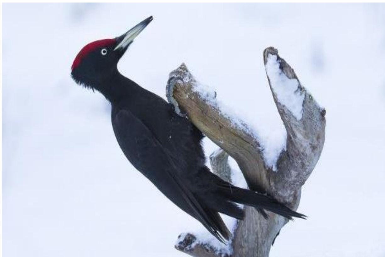
The Impressive Black Woodpecker

NIGHT: (May 12) Koli: Break Sokos Hotel on Top, Koli