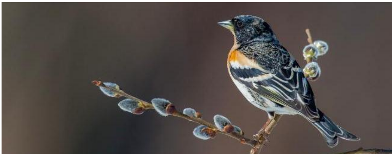
Brambling is a fairly common bird of Scandinavian forests.

NIGHT (May 17): Finlandia Hotel Airport Oulu, Kempele, Finland