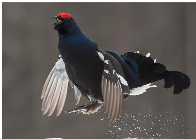
Lekking male Black Grouse have to be seen to be believed.

Kuusamo is an exciting birding destination with a mouth-watering number of eastern and arctic species breeding here. It is also well known for its incredible natural beauty. For one of our two full days here, we'll visit the unspoiled wilderness of taiga forest in Oulanka National Park, which embraces river valleys with endless tracts of forest, bogs, riverine meadows and gorges. It also adjoins a huge protected area on the Russian side of the border. The vast forests and meadows are excellent Hen Harrier and grouse habitat, and an early morning drive will be taken to search for Willow and Black grouse, the enormous and highly sought-after Capercaillie, plus the elusive snazzy Hazel Grouse.