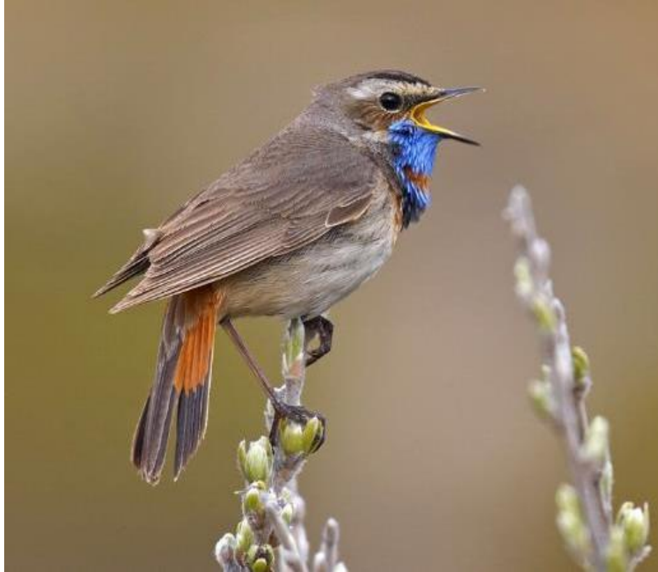
A magnificent singing male Bluethroat

Our next destination (a distance of 375 kilometers) is the quaint and remote village of Ivalo in the land of the midnight sun! This lovely area is a vast, sparsely populated region of field ridges, spruce and pine forests, open tundra heath and bogs with streams—the heart of Lapland. Tourists visit every year for winter sports (downhill and cross-country skiing, snowboarding, husky and reindeer sled riding) and for summer activities (trekking and hiking in the Saariselkä fjells, canoeing in Lapland’s rivers, mountain biking, panning for gold and fishing, etc.). We plan to arrive in time for dinner at our quaint hotel. On route keeping our eyes open for Moose.