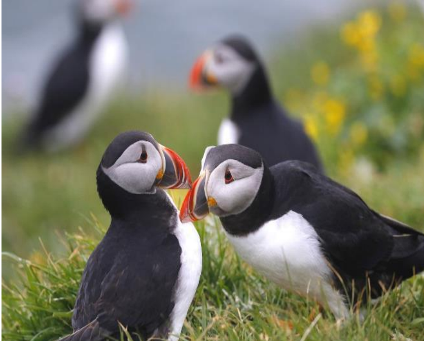
The rock star of northern seabird colonies is the Atlantic Puffin.

We have two full days to explore this exciting northern outpost. One morning, weather permitting, we will make a half-day excursion by boat (15-minute boat ride) to visit one of Europe’s most impressive