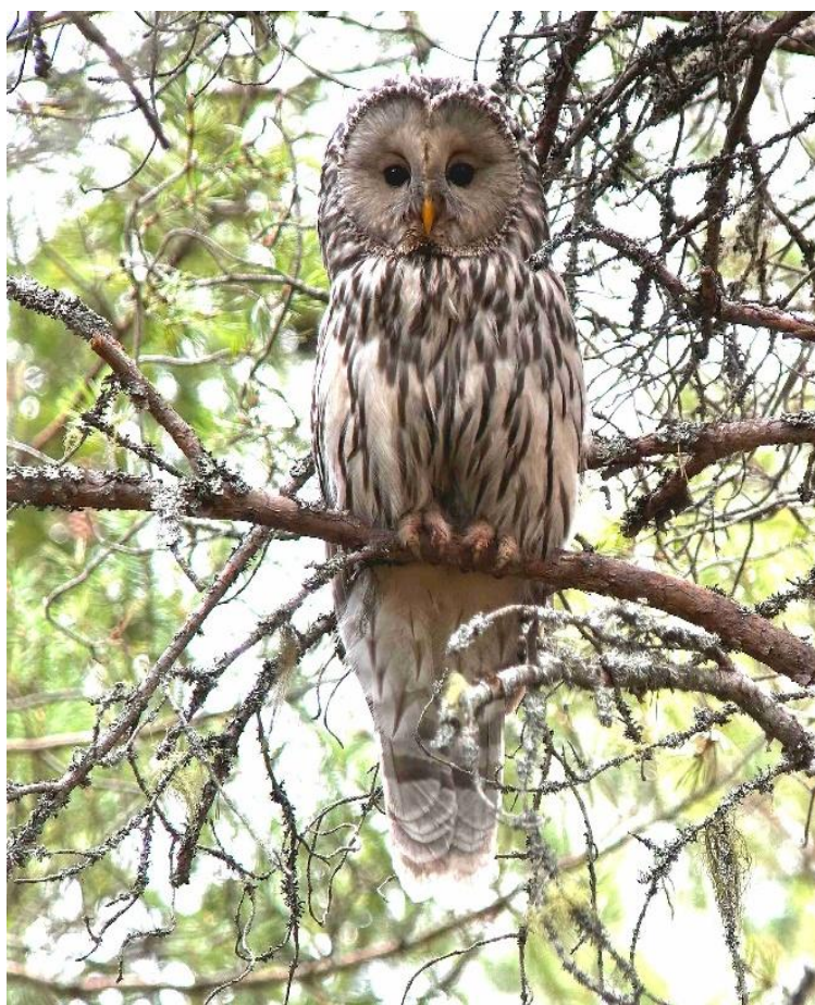
A stunning Ural Owl

We wind up this fabulous trip around Helsinki (the greenest capital in the world), where spring is at its peak offering an amazing variety of different sought-after birds and birding opportunities to many