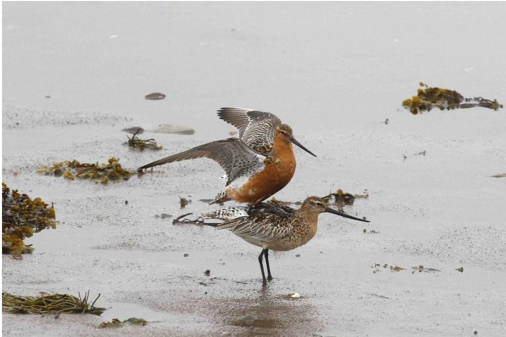
Spring and love are in the air - breeding plumage Bar-tailed Godwit.

We have previously observed Red Fox and Lemmings. A reintroduction of the endangered Arctic Fox is ongoing here but we would be very lucky to come across this tiny, delicate northern fox. After driving through an impressive deep tunnel for three kilometers, we'll exit out into the pleasant island town of Vardo, our home for the next three nights. The Black-legged Kittiwake certainly love the town as thousands nest on the buildings. Time allowing, we can visit the nearby Memorial Site commemorating the execution in 1621 of 91 people for witchcraft, which is in an easy 5–10-minute walking distance from our hotel.