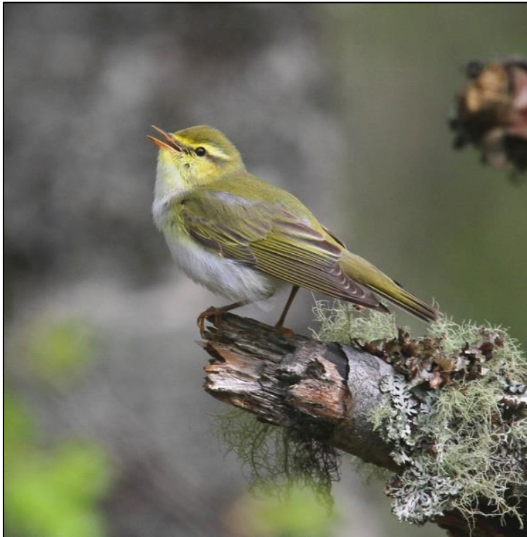
The Wood Warbler is a true delight.