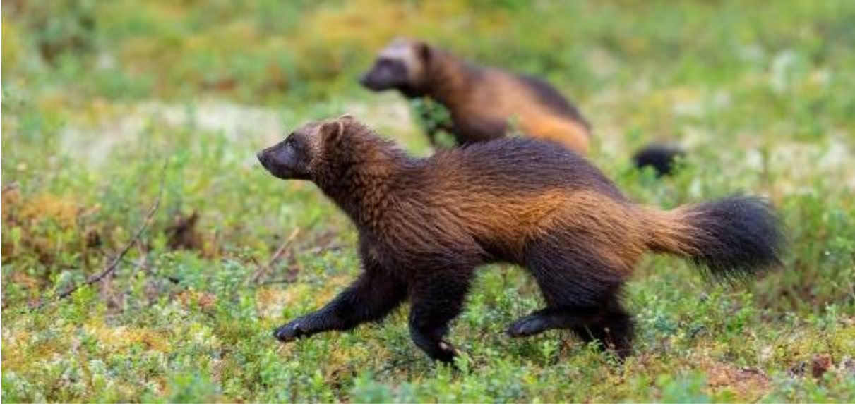
Playful Wolverines outside the comfortable Wolverine blind

visit during its peak season of activity, and without doubt will offer us plenty of great photographic opportunities, too.