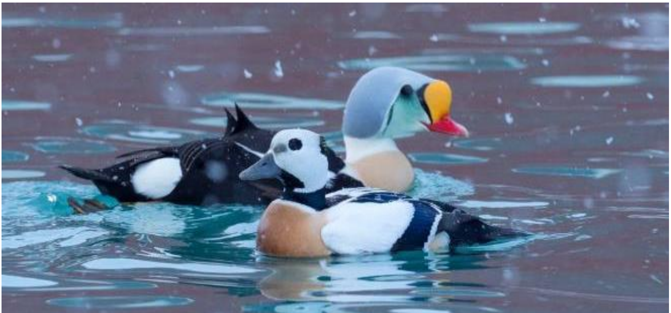
An incomparable male King and Steller's eider

In the rich seas and fjords here, we will especially search for the incomparable King and Steller's (both rare) and Common eider; Yellow-billed Loon; and Velvet and Common scoter. Song birds might include