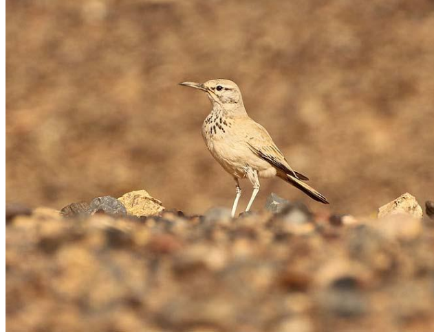
Greater Hoopoe-Lark

All participants should arrange to arrive at Marrakech Menara International Airport (Airport Code RAK) on the afternoon of March 14 (Day 2). You will be met by our local tour operator and transferred from the airport to the hotel where a room will be reserved in your name. The group will meet in the hotel lobby this evening at for a get-acquainted dinner.