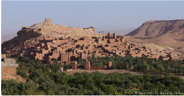
Kasbah Ait Ben-haddou

This morning we will visit the medieval fortified village (ighrem or ksar in Arabic) of Aït Benhaddou which, centuries ago, was a small settlement on the caravan route from the Sahara Desert to the imperial city of Marrakech. Inside the walls of the ksar are half a dozen kasbahs or merchants' houses. The kasbah is a great example of earthen clay architecture, commonly used in Moroccan architecture. Aït Benhaddou has been a UNESCO World Heritage Site since 1987. We will do some birding en route to the High Atlas Mountain pass called Tichka. Here, chances exist for Tristram's Warbler, Levaillant's Woodpecker, Moussier's Redstart, Hawfinch, Red Crossbill (North African race), and migrant raptors, mainly Booted and Short-toed Snake-eagles. In the evening we will arrive in Oukaimeden where a fine dinner will restore our minds from this long day of travel. The magnificent drive into the mountains will include a stop or two at some roadside pullouts, which should reveal our first mountain birds. The Atlas Wheatear is here as well but might require more effort to find. In the Ourika valley Barbary Partridge, Corn Bunting and the regional endemic African Blue Tit will be on our minds. We will make a few more stops on the return trip tomorrow and hope to add Levaillant's Woodpecker and more sightings of the common but absolutely splendid Moussier's Redstart to our already long list of birds.