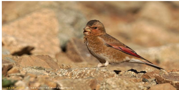
(African) Crimson-winged Finch by Santi Villa © Spainbirds

NIGHT: Hotel Aurocher Ourika, Atlas Mountains near Oukaimeden