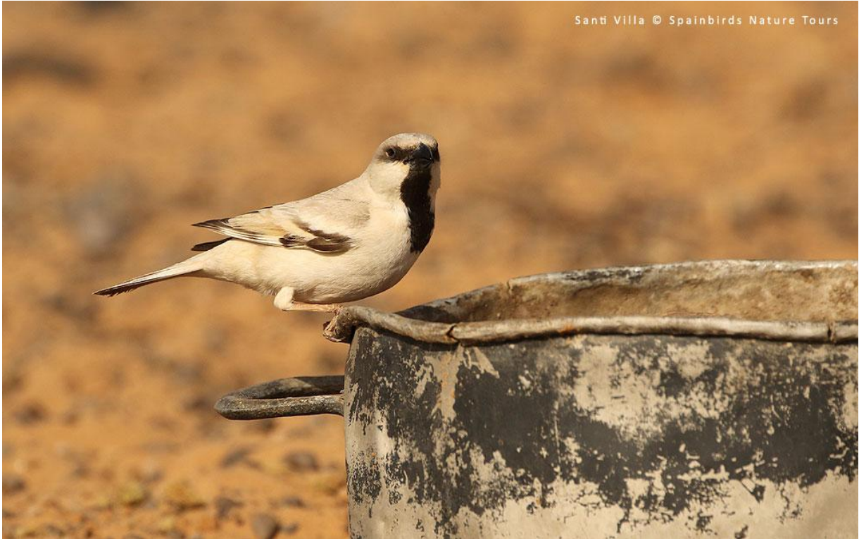
Desert Sparrow

Birding the Atlas Mountains, coastal wetlands, and inland all the way to the dunes of the Sahara in style. Spectacular scenery, ancient cities, excellent food, kasbahs, souks, and friendly Moroccan hosts at palm-lined oases.