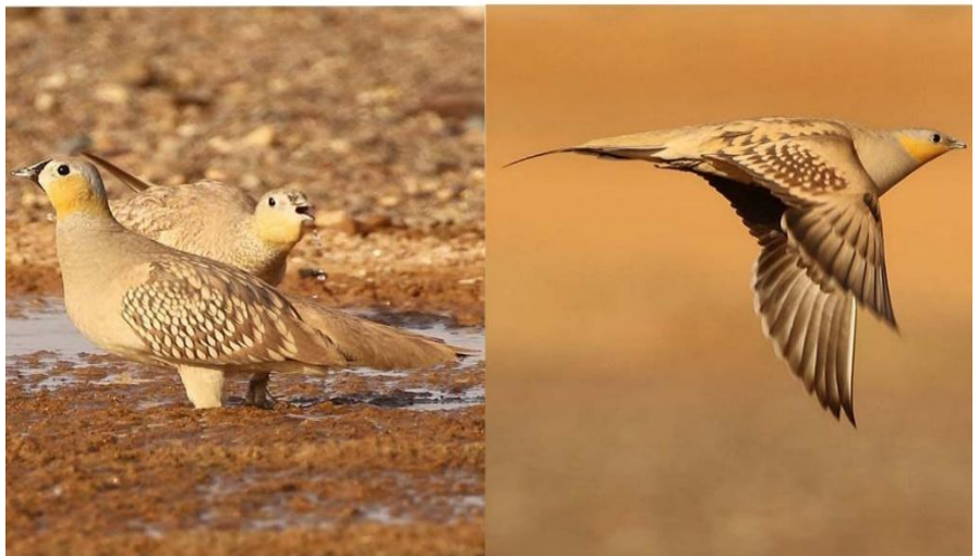
Crowned (L) & Spotted Sandgrouse (R)

This morning we will travel towards Ouarzazate, crossing the stony deserts and impressive acacia landscapes of Alnif, Nkob and Agdz (pronounced Ag-Dez). Along the road we should find Desert Lark, Black Wheatear, and Trumpeter Finch. If time allows, we will stop again at Al Manssour Reservoir. Five days after our first visit, a second stop here will