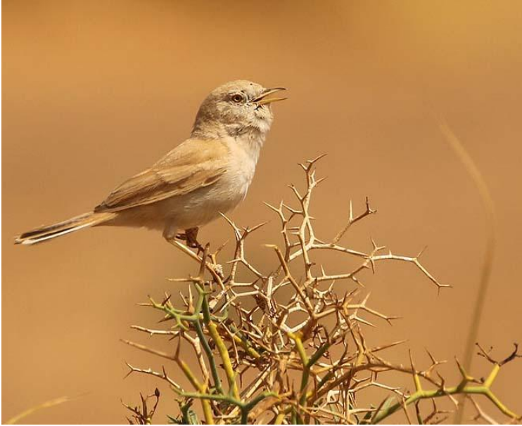
African Desert Warbler by Santi Villa

of the Sahara! The Kasbah Hotel Tombouctou will be our home for the next three nights, located near the impressive Erg Chebbi Dunes, the largest sand dune complex in Morocco.