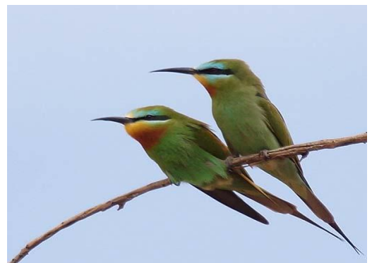
Blue-cheeked Bee-eater by Santi Villa

algeriensis subspecies of Great Gray Shrike, a truly impressive bird. After a stop for the enigmatic Scrub Warbler at one of the wadis while en route, we'll arrive in Erfoud—the gateway town to the sand dunes