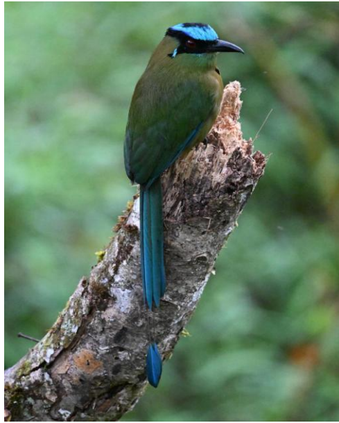
Andean Motmot at Cabañas San Isidro

This Cabañas San Isidro Short Tour focuses on a relatively small area that holds a wide range of habitats and surprising elevational diversity on Ecuador's northeastern Andean slope, mainly within the subtropical zone, with visits to three higher elevation sites—at Antisana National Park, Guango Lodge, and Papallacta Pass—on our first and final days, while also dipping lower to a couple of Amazonian foothill sites. The internationally renowned Cabañas San Isidro will be our base of operations from which we will explore its domain and additional nearby hotspots. We can expect a wide range of species, representing many Neotropical avian families, which could include: ducks, guans, Andean Condor, hawks and eagles, owls, quetzals, Masked Trogon, Andean Motmot, Southern Emerald-Toucanet, mountain-toucans, woodpeckers, Collared Forest-Falcon, falcons, parrots, antpittas, tapaculos, woodcreepers and a variety of furnariids, fruiteaters, Andean Cock-of-the-rock, a wide variety of tyrant-flycatchers, vireos, jays, wrens, White-capped Dipper, thrushes, siskins, brushfinches, oropendolas,