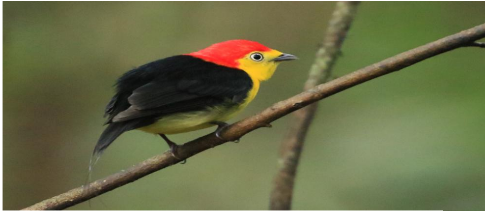
Wire-tailed Manakin, Puerto Inírida, Colombia

Bare-necked Fruitcrow, Amazonian Umbrellabird, Screaming Piha, White-browed Purpletuft, Várzea Schiffornis, Wire-tailed Manakin, Golden-headed Manakin, Tropical Gnatcatcher, Violaceous Jay, Black-faced Tanager, Paradise Tanager, Burnished-buff Tanager, Flame-crested Tanager, Fulvous-crested Tanager, Pectoral Sparrow, Epaulet Oriole, Velvet-fronted Grackle, and both Green and Olive oropendola.