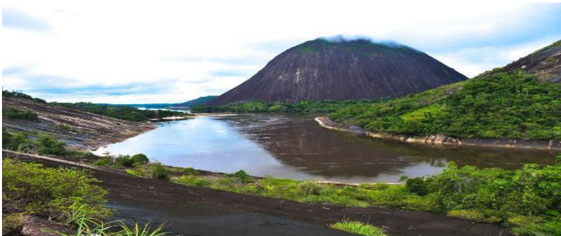
Rio Inírida and Cerros de Mavecure near Puerto Inírida, Colombia

There will, of course, be many other species, some widespread, others less so. There also will surely be a few surprises in this region because there has been relatively little attention here from birders or the ornithological community. And, added to some exciting birding will be an exotic landscape of alluring, domed mountains, rocky outcrops and blackwater rivers, that seem as if they could have been drawn straight from Sir Conan Doyle's fictional The Lost World .