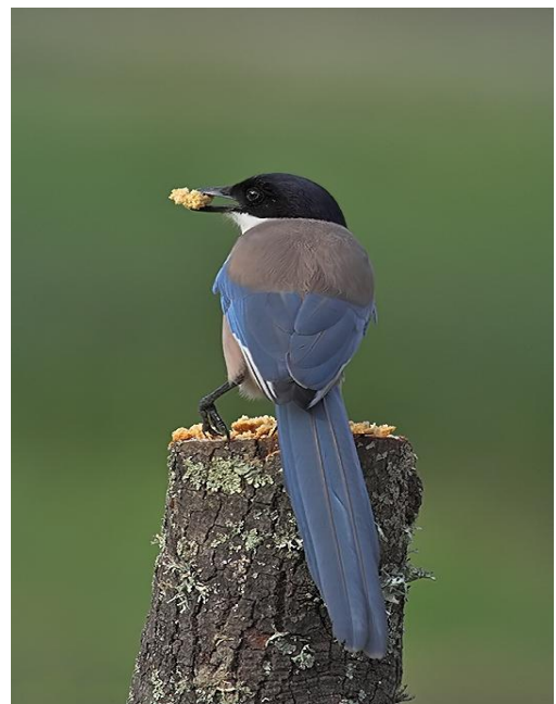
Iberian Magpie

To the west of Mértola, the Castro Verde region is one of open “pseudo-steppe” peppered with small towns and villages. Much of the countryside is a mix of native grasslands, pasturelands, and farms spread over approximately 220 square miles. So important is this area that it is classified as a Special Protection Area for birds. It is not hyperbole to refer to the birdlife here as amazing. White Storks nest atop the numerous power poles during the breeding season, and a few individuals will start to occupy the nests; Iberian Magpie is a common roadside bird; Great and Little bustards thrive in the rolling countryside; and the skies are patrolled by Eurasian Griffon and Cinereous vultures. The Spanish