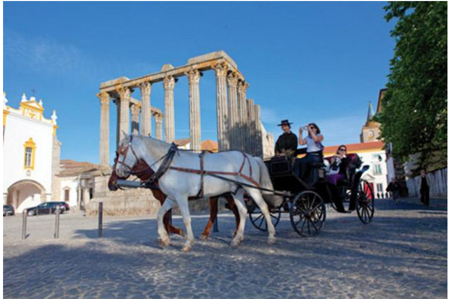
Roman Ruins, Évora

Branded as a UNESCO World Heritage Site, Évora is the proud owner of a rich heritage that spans every period in Portuguese history. Our tour will start from Praça do Giraldo in the heart of the city, from which we'll wander through the narrow cobblestone streets to the Cathedral of Évora, the largest medieval cathedral in Portugal, dating