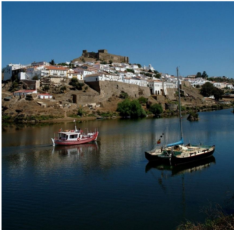
Acropolis at Mértola

The Algarve is Portugal's southernmost administrative region. It is one of the most economically prosperous regions of Portugal, due in large part to a beautiful coastline that draws millions of people a year. Beyond tourism, the Algarve is a major source of food production, especially for seafood and agricultural products. Away from the more touristy facilities, the Algarve contains extensive natural areas and considerable scenic beauty. The Tavira area on the southeastern coast, where we'll spend three nights, is home to a complex of canals, saline flats, and salt pans, all of which often teem with birds.