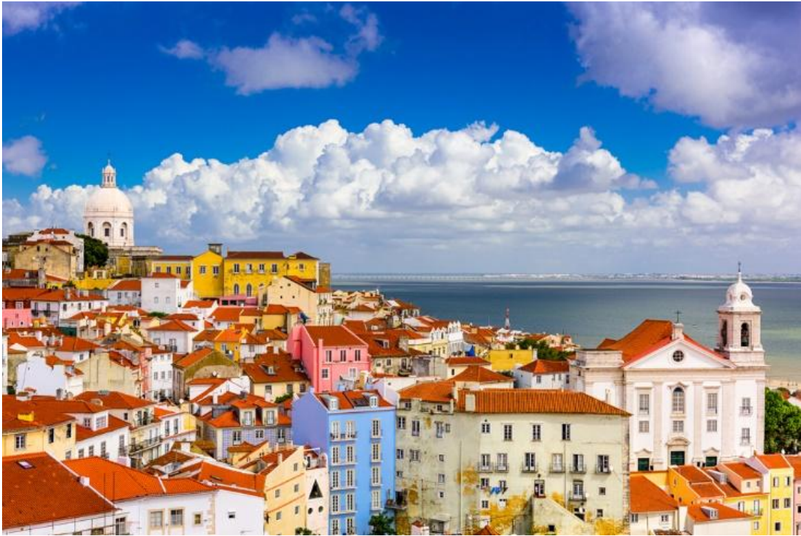
Alfama District, Lisbon

In the late morning we'll make our way to Belém. At the far west end of Lisbon, Belém is the location of the old harbor from which ships departed for voyages across the Atlantic in the fifteenth and sixteenth centuries during the Age of Discovery. After lunch we'll stop to view the iconic Torre de Belém (Tower of Belém), followed by a visit to the Monument to the Discoveries. The tour will conclude with a visit to the Jerónimos Monastery, a masterpiece of gothic architecture and the burial place of Vasco da Gama.