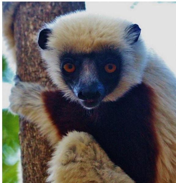
Coquerel's Sifaka

We will spend the day searching for all of the key endemic species this outstanding park offers. With luck they may well have Schlegel's Asity staked out nesting. Hopefully after superb views of this quite unbelievable bird we will move into drier habitats to search for other key special endemics like White-breasted Mesite and Van Dam's Vanga which may require some searching as they are both low density species. After a break in the heat of the day we will take a boat trip out on a nearby reservoir, Lac Ravelobe, where we hope to see one of the pairs of the extremely rare Madagascar Fish-Eagle. The extensive wetland is a good site for a view of the scarce Humblot's Heron. We will have a short drive to a nearby village wetland that supports one of the few known populations of publicly accessible Madagascar Jacana. Hopefully African Pygmy-geese will be present. This species decline seems to be linked to the proliferation