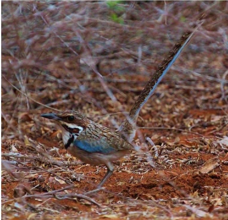
The enigmatic Long-tailed Ground-Roller

Following our early morning excursions to the spiny desert, we will return to our beachside hotel for the afternoon. With its relaxed ambience and very comfortable facilities, our hotel is a most pleasant place in which to rest and relax during the heat of the day. When the tide is low, some interesting shorebirds turn up on the adjacent beach. Shorebird possibilities include Whimbrel, Common Greenshank, Terek and Curlew Sandpipers, White-fronted Plover and Greater Sand-Plover.