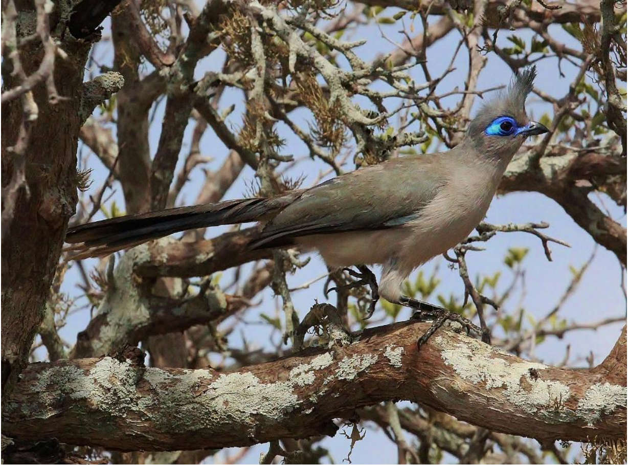
Verreaux's Coua--a challenging-to-find endemic