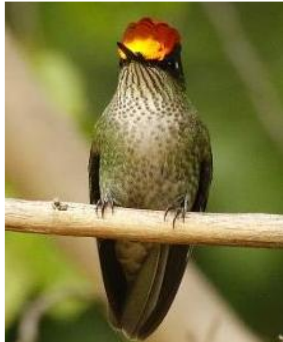
Green-backed Firecrown (male)

Our first objective will be to track down the endemic Chestnut-throated Huet-huet (pronounced wet-wet ); we will turn its loud vocalizations to good purpose as we search for this large and remarkably colorful member of the tapaculo family. Another of South America's truly