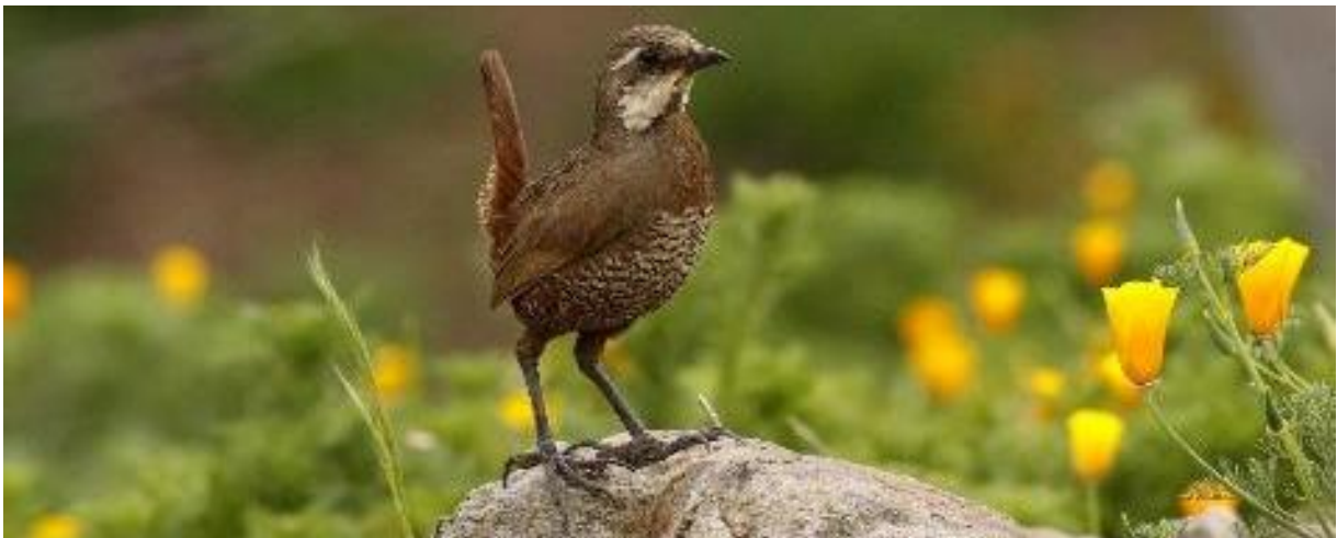
The endemic Crag Chilia

We'll leave Santiago after an early breakfast, head south and east through rich farmland and the Maipo River valley. As we start to gain altitude, we'll pass through the valley's picturesque "capital," San José de Maipo. Following the river, we have a good chance of finding the stunning Torrent Duck, often with ducklings in this season. Once at our destination, El Yeso Valley, we will bird our way up a rough and rocky road.