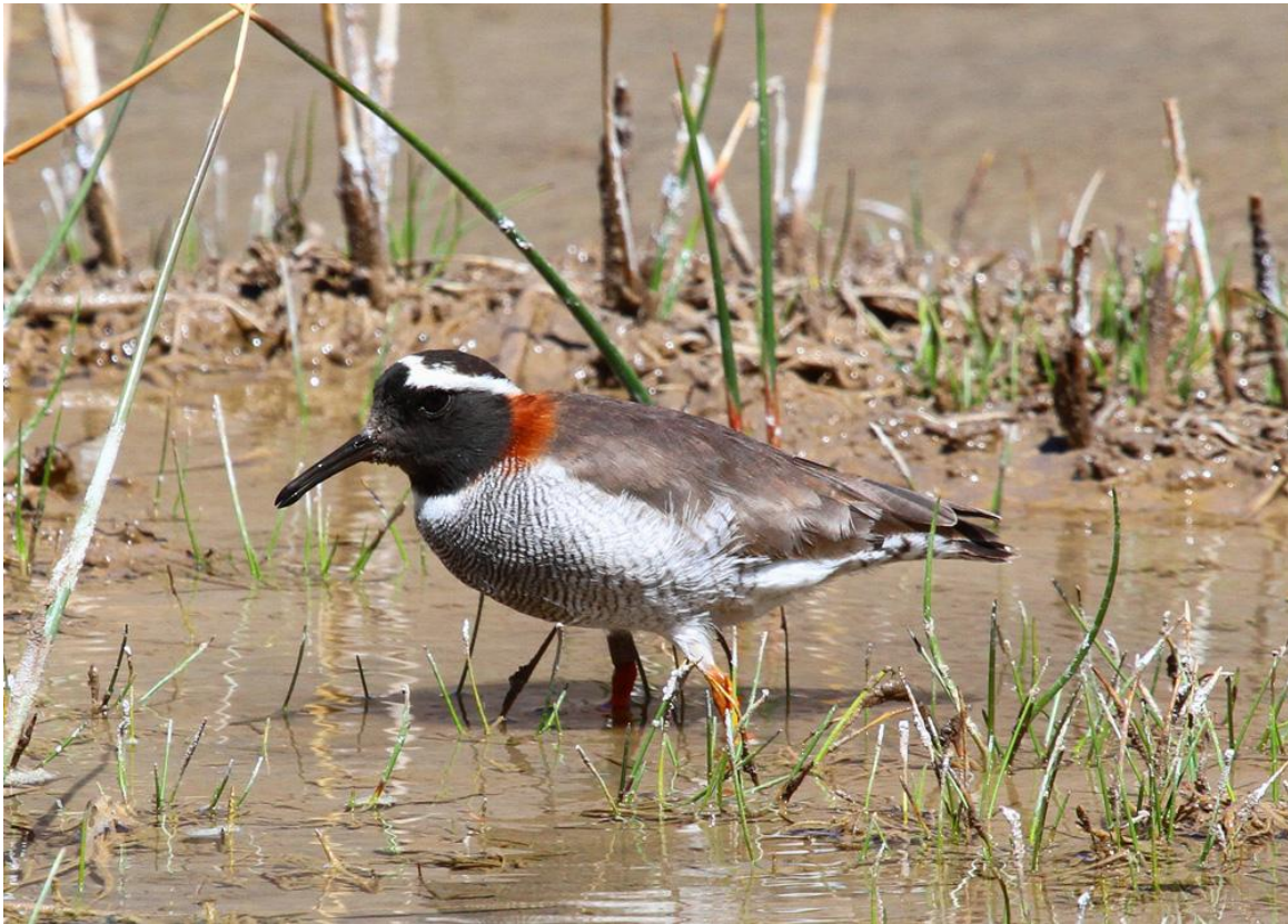
Diademed Sandpiper-Plover, Yeso Valley, Chile

Chile is among the world’s most spectacular countries, renowned—and beloved—for its vivid landscapes, varied culture, and amazing wildlife. From the Atacama Desert in the far north to the steppes of Patagonia in the far south, Chile offer limitless opportunities for discovery and exploration.