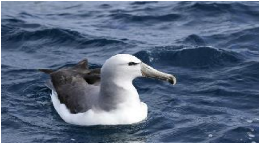
The Salvin's Albatross is always the most common of the albatross.

After an early breakfast, we'll embark on our private boat (with a bathroom) for five or six hours of nonstop excitement. Spring, when the seas are typically very calm, is the perfect time to go offshore. No place on earth offers more productive seabirding than the Humboldt Current, where any trip can turn up a wonderful cross-section of sub-Antarctic seabirds and warm-water petrels. On a "good" day, the number of birds out here reaches the thousands!