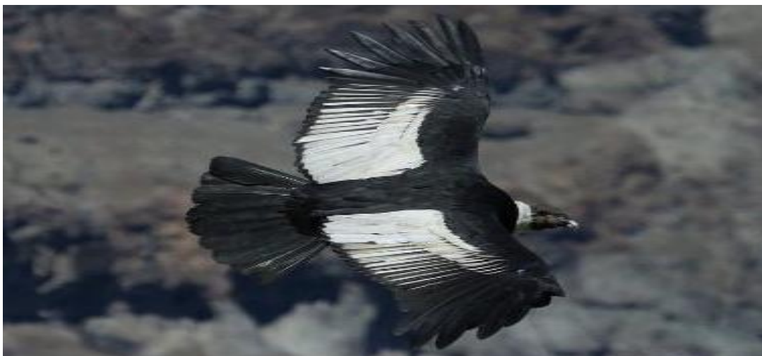
Andean Condor (male)

Our final destinations for the afternoon are the mountain town of Farellones and the Valle Nevado, the Valley of Snow. The road to Farellones is marked by some 40 switchbacks before reaching the Valle Nevado, at an elevation of 9,000 feet.