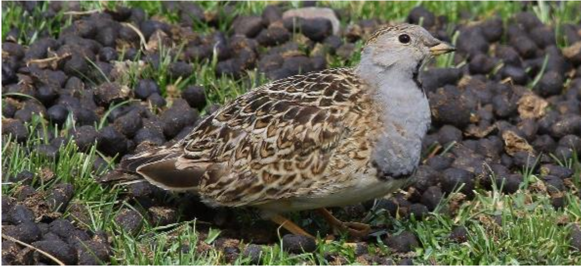
Gray-breasted Seedsnipe

ground, foraging like towhees as they move along: this is bold behavior for a tapaculo. In damp meadows, we'll seek Yellow-rumped and Thick-billed siskins (the latter rare), Mountain Parakeet, White-sided Hillstar, Giant Hummingbird, and Chilean Flicker. We will keep our eyes open on rocky outcrops for the Southern Mountain Vizcacha, a large half-squirrel-half-wallaby-like rodent.