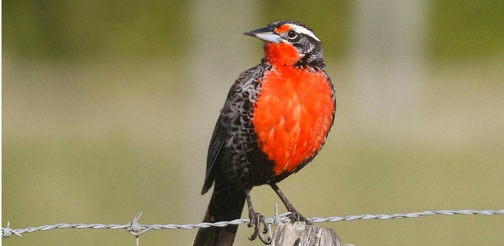
Long-tailed Meadowlark (male)

We'll continue to gain elevation into Yerba Loca Reserve. At about 7,200 feet, Yerba Loca is a good place to look for such sought-after species as Striped Woodpecker, Patagonian Tyrant, and Long-tailed Meadowlark. Overhead, we can hope for fine looks at an Andean Condor or a Black-chested Buzzard-Eagle. Among the mammals, we will keep a special eye out for the Culpeo (Andean Fox).