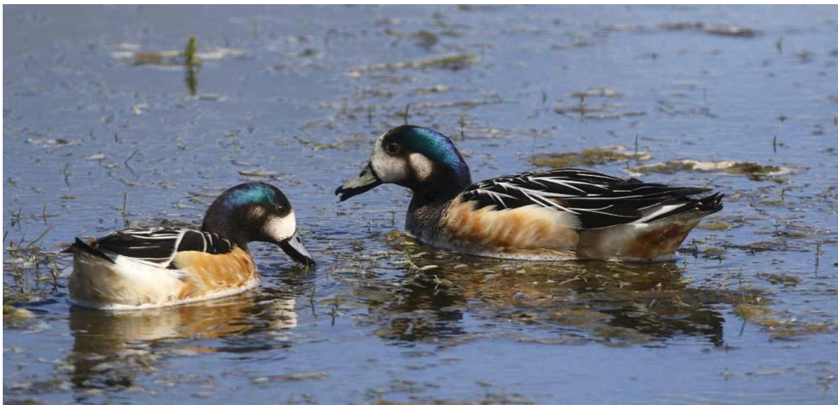
Chiloé Wigeon

The well-kept trails of Laguna Cartagena Reserve offer close-up views of an abundance of waterfowl, and the photographic opportunities here are excellent. The many secluded pools are ideal for viewing species typical of reedbeds and of open water alike. We have chances here for Red Shoveler, Chiloé Wigeon, White-cheeked and Yellow-billed pintails, Silvery and White-tufted grebes, the elegant “White-backed” Black-necked Stilt, Chilean Swallow, Diuca Finch, and Yellow-winged Blackbird.