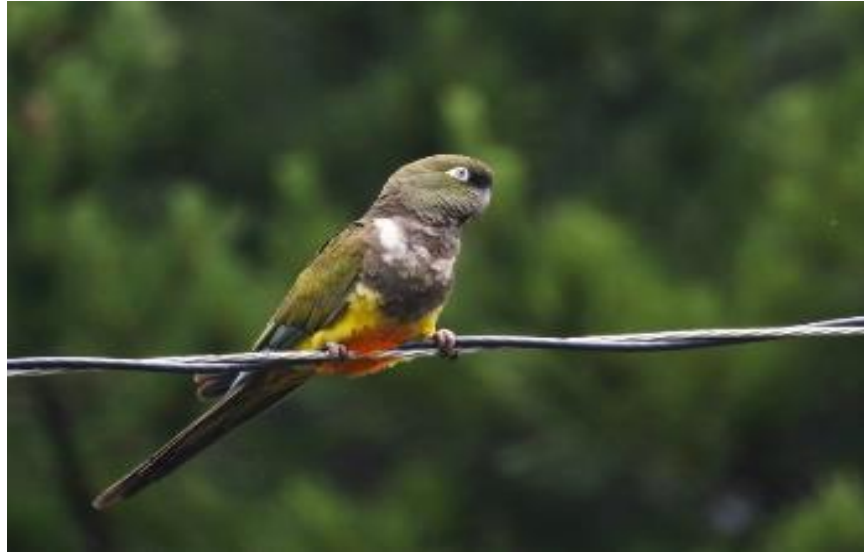
Colorful Burrowing Parakeets breed along riverbanks.

Spectacled Duck, Black-faced Ibis, Andean Gull, Chilean Pigeon, and, best of all, a superb colony of colorful Burrowing Parakeets, big and bright and noisy as macaws.