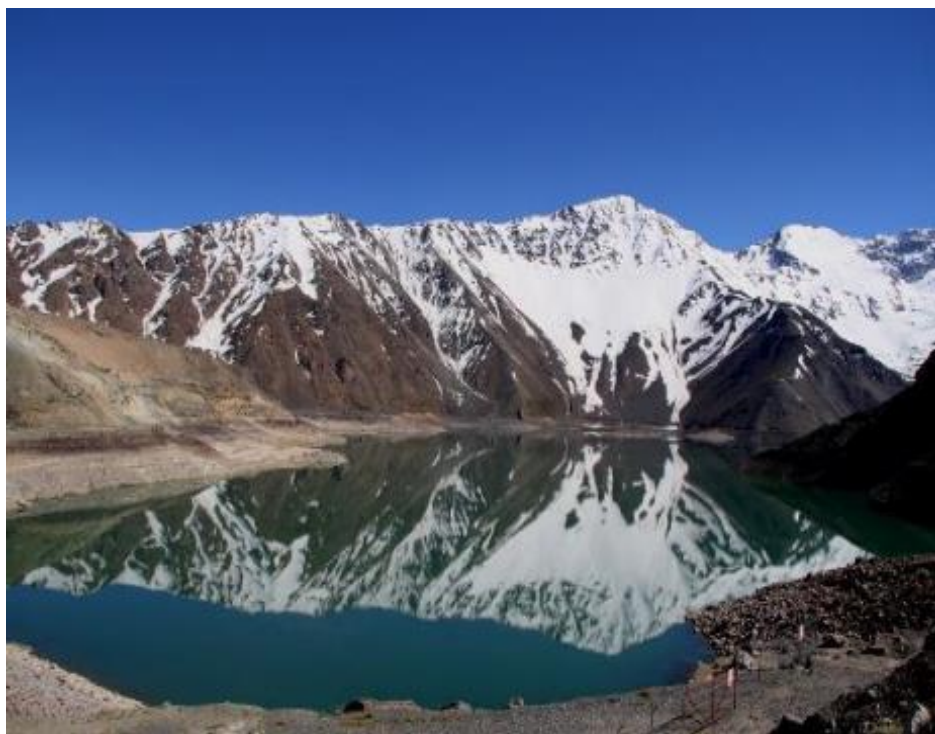
Reservoir in El Yeso Valley

Our picnic lunch will be set in scenery glorious even by Chilean standards. Our explorations will turn up a fine variety of other target species, among them Crested Duck, Andean Condor, Mountain Caracara, White-sided Hillstar, Sharp-billed and Cordilleran canasteros, Buff-winged and Gray-flanked cinclodes, Scale-throated Earthcreeper, Rufous-banded Miner, and possibly its highland counterpart, the Creamy-rumped Miner. In grassy areas, we will learn how to distinguish the Cinereous, Spot-billed, and White-browed ground-tyrants. Wherever a supply of seeds is to be found, we should expect Gray-hooded and Plumbeous sierra finches.