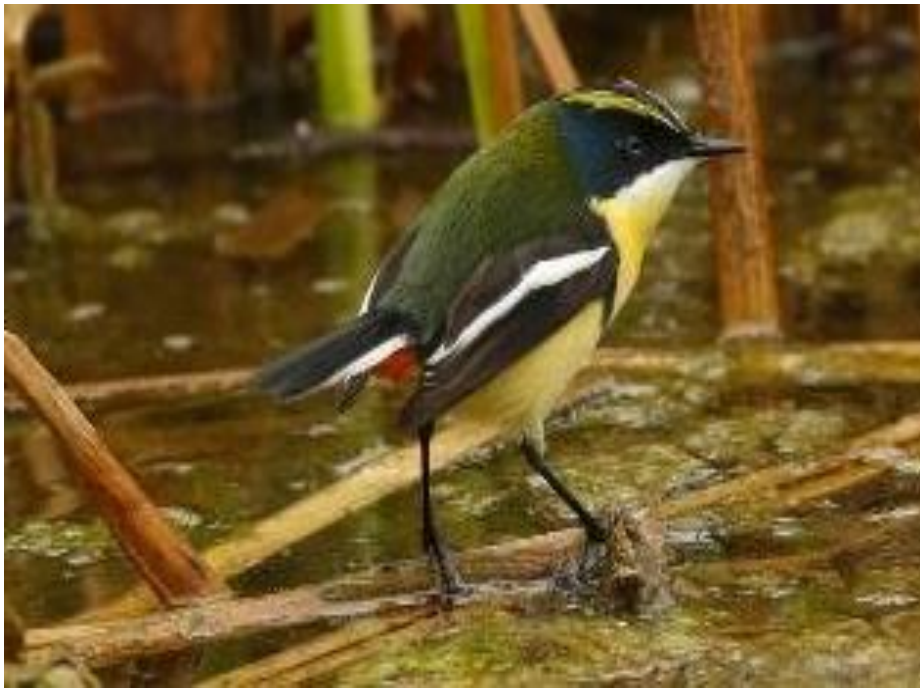
Many-colored Rush-Tyrant

About an hour and forty-five minutes west of Santiago exists one of Chile's most important bird refuges, the Maipo River Wetland and Estuary. This area, where the Maipo River flows into the Pacific Ocean, is of such great conservation importance that it has been made part of the Western Hemisphere Shorebird Reserve Network (WHSRN). In an area of 345 acres are a sand bar, estuary, grasslands, marshes, shrublands, dunes, and beach—a vital nesting area for gulls, terns, and skimmers, and a sanctuary for wintering shorebirds from North America.