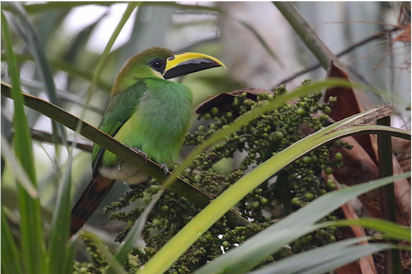
Northern Emerald-Toucanet

In western Belize's Cayo District, two outstanding lodges, Jade Jungle Resort (formerly Pook's Hill) and Black Rock Lodge, serve as a perfect base for exploring the Maya Mountain foothills and Mountain Pine Ridge. This interesting area has a different mix of species than lowland Belize, including many regional specialties and possibilities for several very rare species.