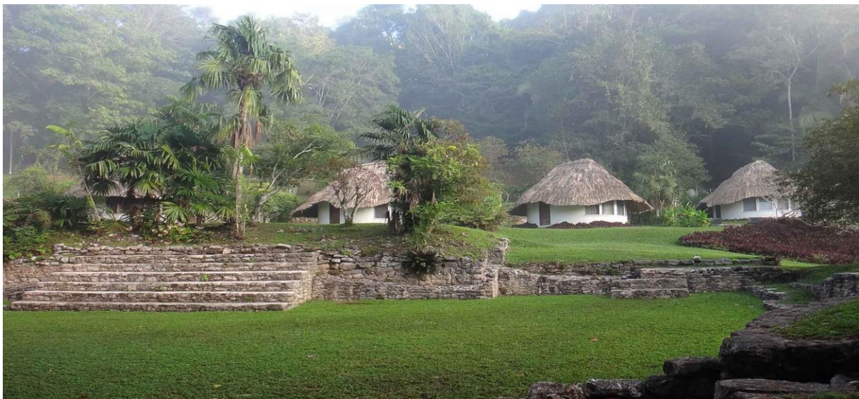
Jade Jungle Resort

Jade Jungle Resort was built around an ancient Mayan residential complex, referred to as a Plazuela Group (a "diminutive plaza"), and much of the forest surrounding the main clearing contains unexcavated Mayan settlements. In our wanderings, we will likely see mounded piles of stones, indicating the presence of an ancient Maya family dwelling. The lodge is simple but very comfortable and is set in some of the finest forest we have birded in Belize. We'll take a full day to explore this fabulous site and may find over 100 species without ever getting into a vehicle!