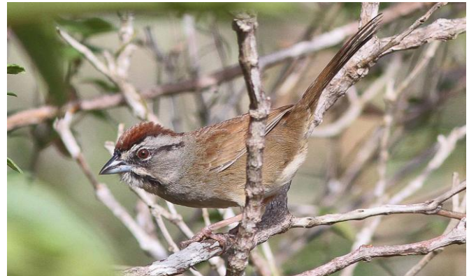
Rusty Sparrow © Michael O'Brien

Today we'll drive up to Mountain Pine Ridge, a 100,000-acre reserve situated largely on a granite massif and established in 1944 to protect Belize's