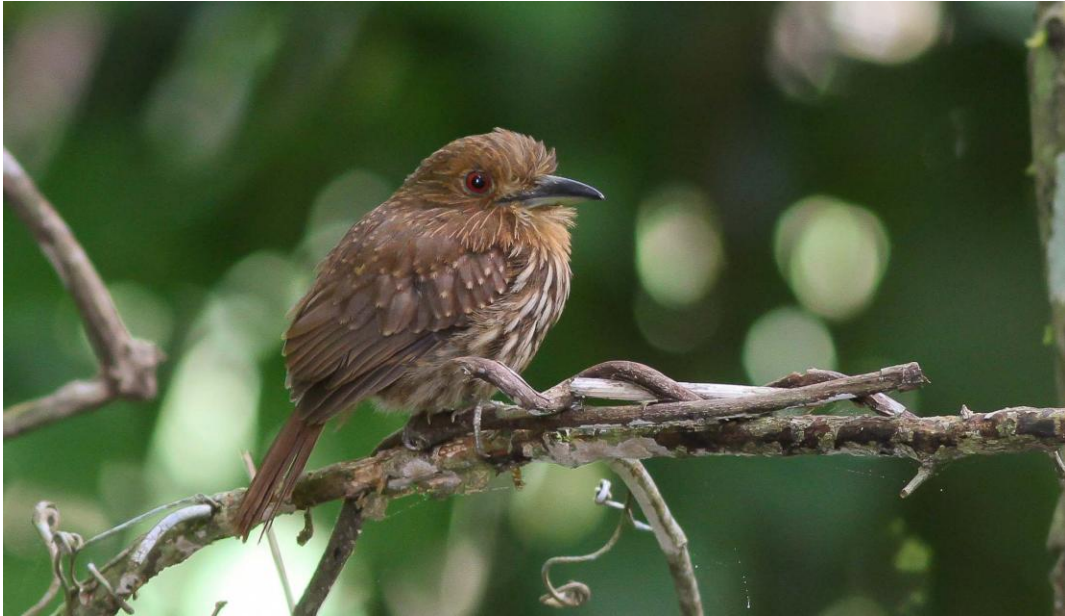
White-whiskered Puffbird