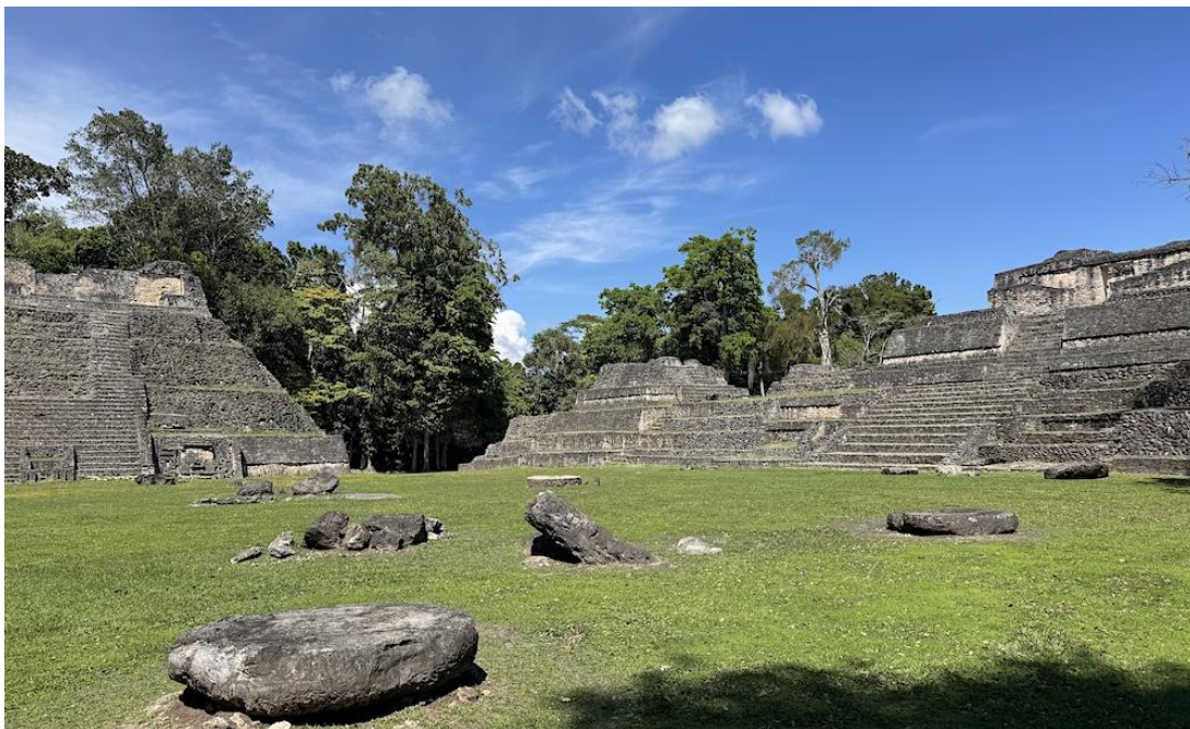
Caracol Archeological Reserve